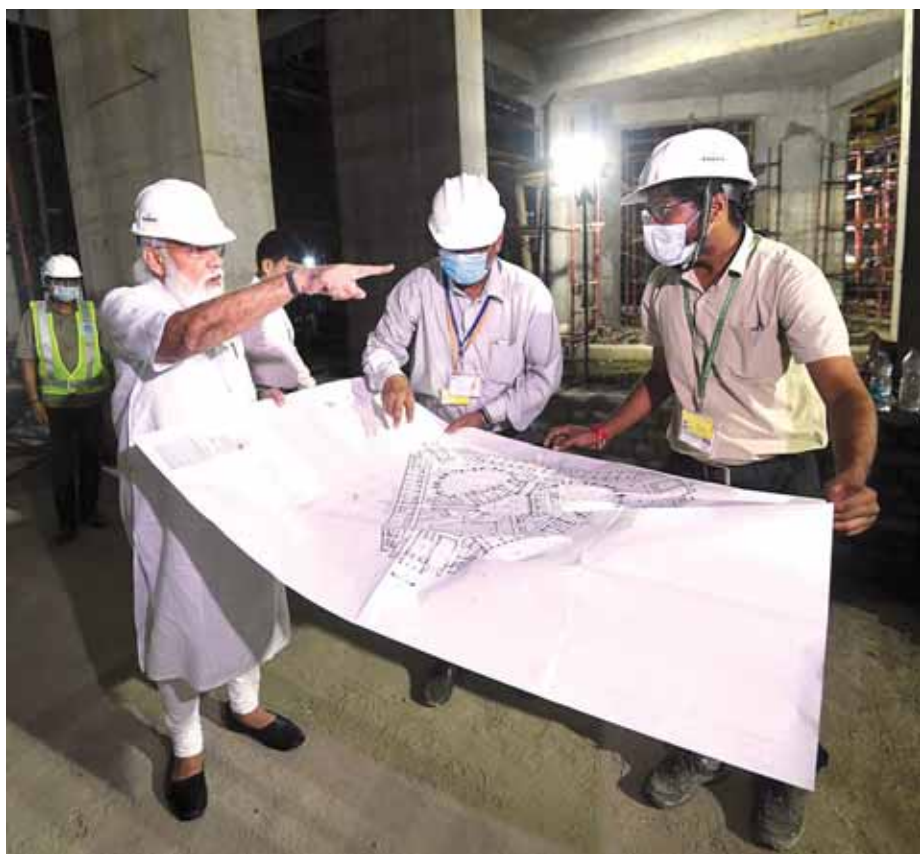
New Delhi: Back from his three-day hectic visit to the US, Prime Minister Narendra Modi made an impromptu tour of the under-construction Central Vista project after he held a meeting on Sunday with Union Home Minister Amit Shah and Defence Minister Rajnath Singh. Wearing a helmet, Modi was seen taking a quick check of the ongoing construction.