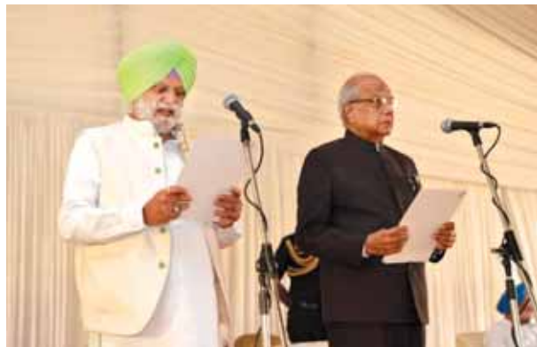
Punjab's Governor Banwarilal Purohit administers oath to Rana Gurjit Singh during the oath-taking ceremony of Punjab Cabinet Ministers on Sunday

The new Cabinet, formed with the approval of the party high command, especially Rahul Gandhi, has three below-