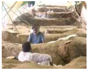
Farmers lie in pits during a protest against farm laws in Ghaziabad

The Congress, the Aam Aadmi Party (AAP), the Telugu