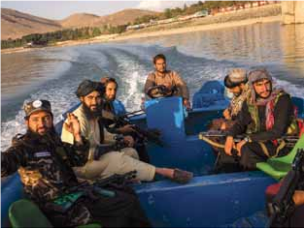
Taliban fighters enjoy a boat ride in the Qargha dam, outskirts of Kabul

Russia, China, Pakistan and the United States are working together to ensure that Afghanistan's new Taliban rulers keep their promises, especially to form a genuinely representative Government and prevent extremism from spreading, Russia's Foreign Minister said on Saturday. Sergey Lavrov said the four countries are in ongoing contact. He said representatives from Russia, China and Pakistan recently traveled to Qatar and then to Afghanistan's capital, Kabul, to engage with both the Taliban and representatives of "secular authorities" — former President Hamid Karzai and Abdullah Abdullah, who headed the ousted government's negotiating council with the Taliban. Lavrov said the interim government announced by the Taliban does not reflect "the whole gamut of Afghan society — ethno-religious and political forces — so we are engaging in contacts. They are ongoing." The Taliban have promised an inclusive Government, a more moderate form of Islamic rule than when they last ruled the country from 1996 to 2001 including respecting women's rights, providing stability after 20 years of war, fighting ter-