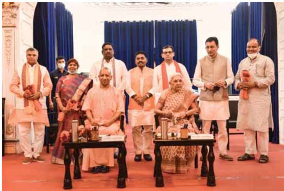
Uttar Pradesh Governor Anandiben Patel and Chief Minister Yogi Adityanath with newly sworn-in State Ministers during the expansion of the Cabinet ahead of the UP Assembly elections in Lucknow on Sunday