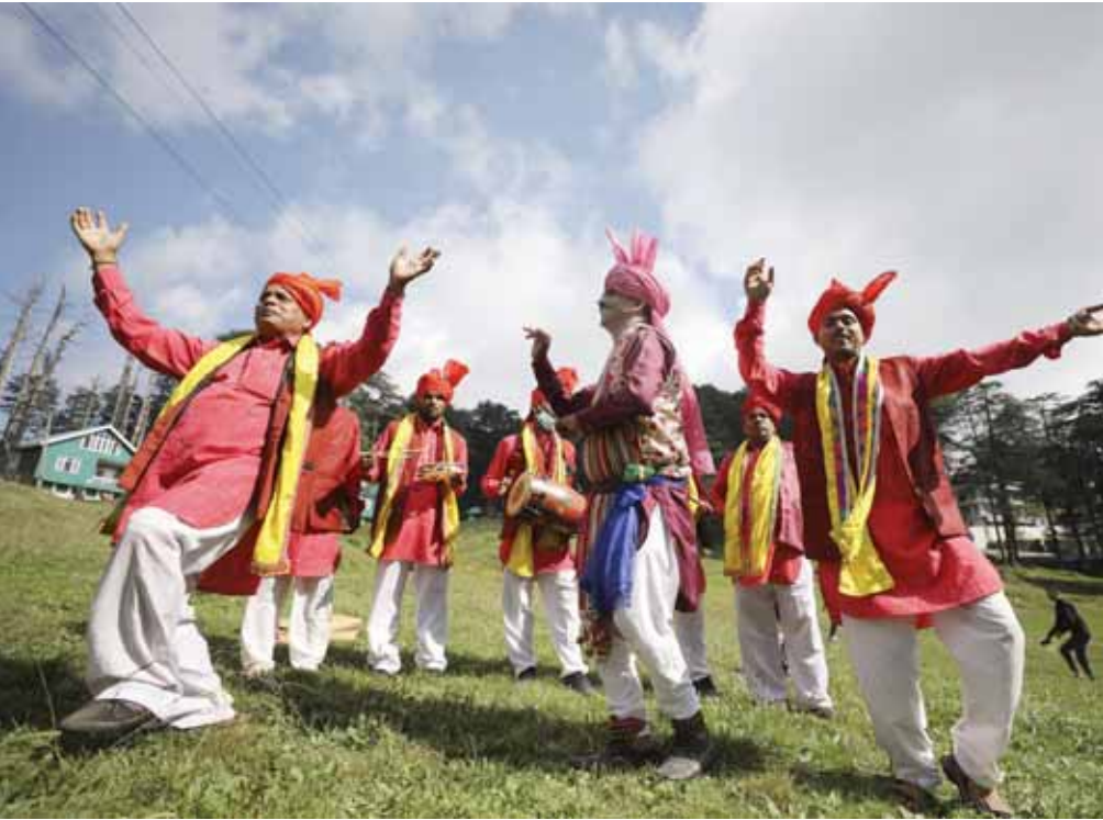
Artists perform during the second day of the monsoon festival at Patnitop on the outskirts of Jammu on Sunday

"The MSP (minimum support price) of the early variety has been increased from ₹325 per quintal to ₹ 350 per quintal. Similarly, the MSP of the ordinary variety has been increased to ₹340 per quintal from ₹315 per quintal. As far as the rejected variety is concerned, its MSP has been increased from ₹305 per quintal to ₹330 per quintal."