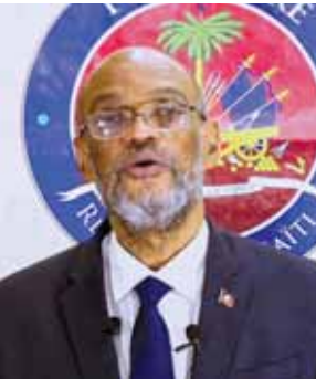
In this photo taken from video, Ariel Henry, Prime Minister of Haiti, remotely addresses the 76th session of the United Nations General Assembly in a pre-recorded message

The speeches may be scripted, but the UN General Assembly can sometimes be the only direct window into the regional challenges that command global concern. On Saturday, world leaders were speaking on behalf of some of the most unstable and unsettling current conflicts. That includes India's fight over the Kashmir region with bitter rival Pakistan, Haiti's domestic crises spilling into a migrant crisis at the US-Mexico border and questions about the Ethiopian government's role in reported starvation deaths in the Tigray region. Haiti Prime Minister Ariel Henry didn't shy away from addressing his country's turmoil following a major earthquake and the assassination of its president, Jovenel Moise, in recent months — alluding to but not directly addressing reports that may implicate Henry himself in the murder. "I want to reaffirm here, at this platform, my determination to do everything to find the collaborators, accomplices and sponsors of this odious crime. Nothing, absolutely nothing, no political maneuver, no media campaign, no distraction, could deter me from this objective: rendering justice for President Moise," Henry said in a prerecorded speech. "It is a debt to his memory, his family and the Haitian