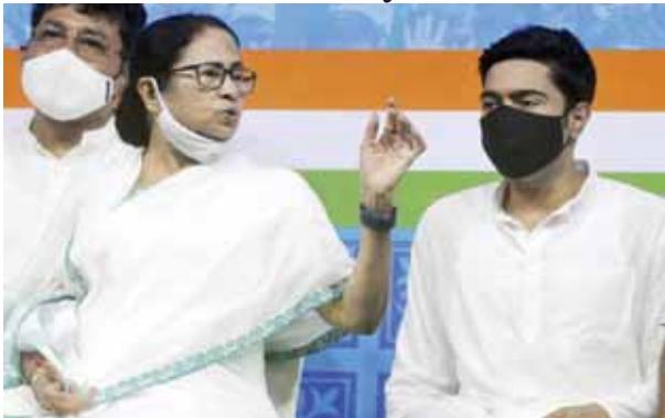
West Bengal Chief Minister and TMC party candidate from Bhabanipour constituency, Mamata Banerjee (L) with party general secretary and MP Abhishek Banerjee (R) during her election campaign for Assembly bypolls, in Kolkata on Sunday

from visiting Chicago ... they stopped me from going to China --- which however I did not mind on account of the recent diplomatic developments --- then they did not allow me to go to Cambridge ... I want to ask why ... why was I being stopped ... is there a political reason behind this..." Banerjee said asking the voters of Bhawanipore from where she is seeking a by-election to retain her Chief Ministerial chair.