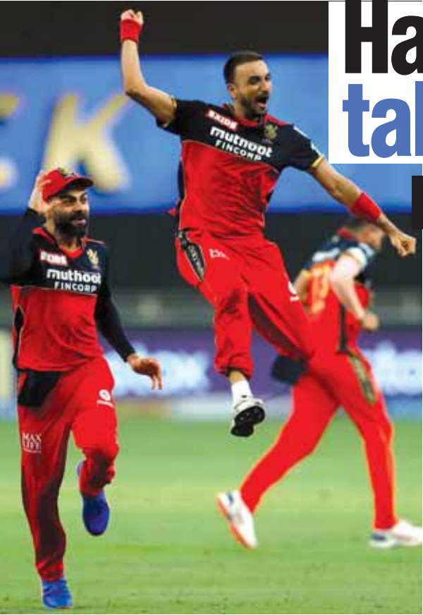
■ DUBAI

Glenn Maxwell justified his million dollar contract with an all-round performance before Harshal Patel took a hat-trick to ensure a thumping 54-run victory for Royal Challengers Bangalore over Mumbai Indians in the Indian Premier League here on Sunday. Maxwell (56 off 37 balls and 2/23) produced one of his better efforts in the IPL while Harshal (4/17 in 3.1 overs), the current Purple Cap holder removed Hardik Pandya, Kieron Pollard and Rahul Chahar off successive deliveries to defend a target of 165 without breaking much sweat. MI were all-out for 111 in 18.1 overs, losing 10 wickets for 54 runs after being 57 for no loss at one stage.