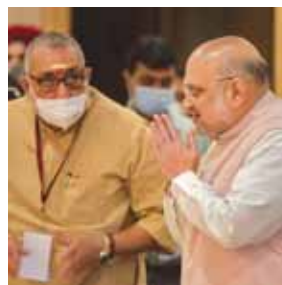
Union Home Minister Amit Shah arrives at Vigyan Bhawan in New Delhi on Sunday

The Chief Ministers who attended the meeting were Naveen Patnaik (Odisha), K Chandrashekar Rao