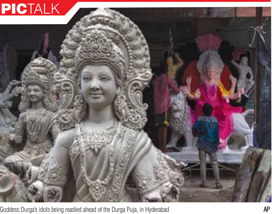
Goddess Durga's idols being readied ahead of the Durga Puja, in Hyderabad

The context was that Pakistan PM Imran Khan had made direct and scathing attacks on India, insisting that the two nuclear powers have to “behave, else the consequences would be grave”. Modi, without naming either China or Pakistan, hinted that terrorism as a State policy was not a good idea and the countries should refrain from doing so. He also mentioned the accomplishment of the Indian presidency at the UN Security Council last month. Modi also referred to the issue of the “origins of the COVID virus” and the cancellation of the World Bank’s “Ease of Doing Business Index”, both of which have been laid at China’s door for a lack of transparency by the global institutions. He also emphasised the need for cooperation, saying he represented India as the “mother of all democracies”. Earlier, at a meeting with Kamala Harris, both sides emphasised safeguarding democratic values and upholding human rights in respective countries. Modi also offered condolences to the pandemic victims. Overall, it was a well-crafted speech and well delivered though his “ chaiwala ” reference is better avoided as it has become rather clichéd. Though Modi also had a meeting with President Joe Biden, it was more to do with protocol than anything else. The personal chemistry between them was clearly missing.