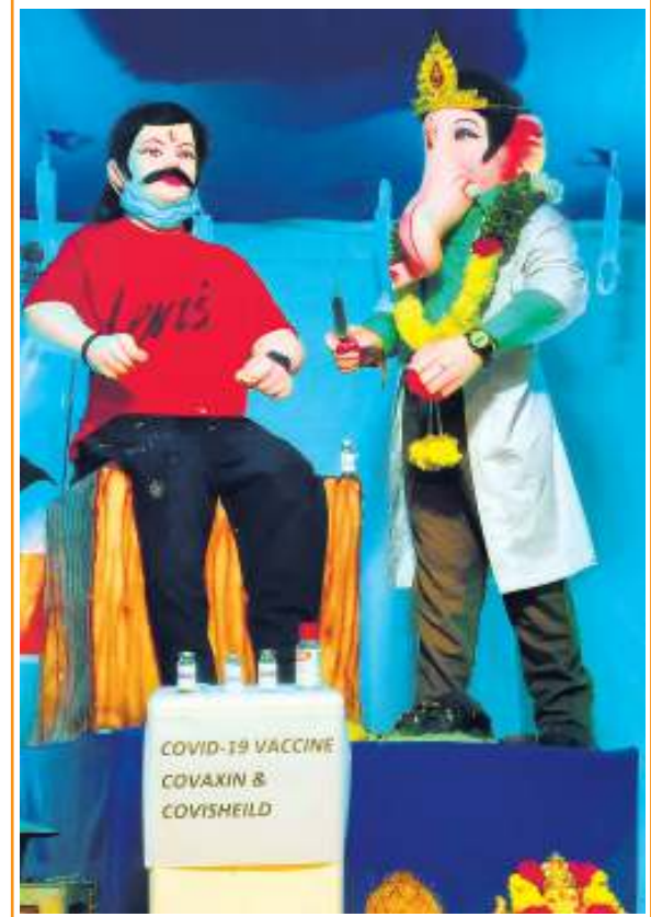
In a bid to hammer home the message that the pandemic is far from over, the organisers of a Ganapati festival in Begum Bazaar have modelled their pandal on the theme of Covid and tried to raise awareness about the importance of vaccination.