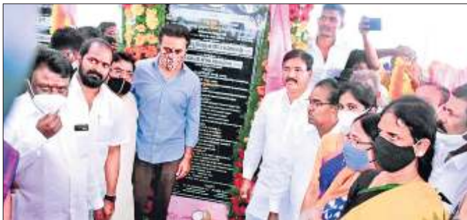
IT and Municipal Administration Minister KT Rama Rao during his tour of Gadwal on Tuesday

claiming that in every scheme of TS there was Centre's contribution. He said, "UP is developing with money from Telangana's blood and sweat. If there is Centre's contribution in every scheme, why is there is no Rythu Bandhu in Karnataka? With our blood and sweat, we are helping other BJP-ruled states. The Modi government has been deceiving Telangana ever since it came to power". KTR asked BJP workers to go and check whether any of