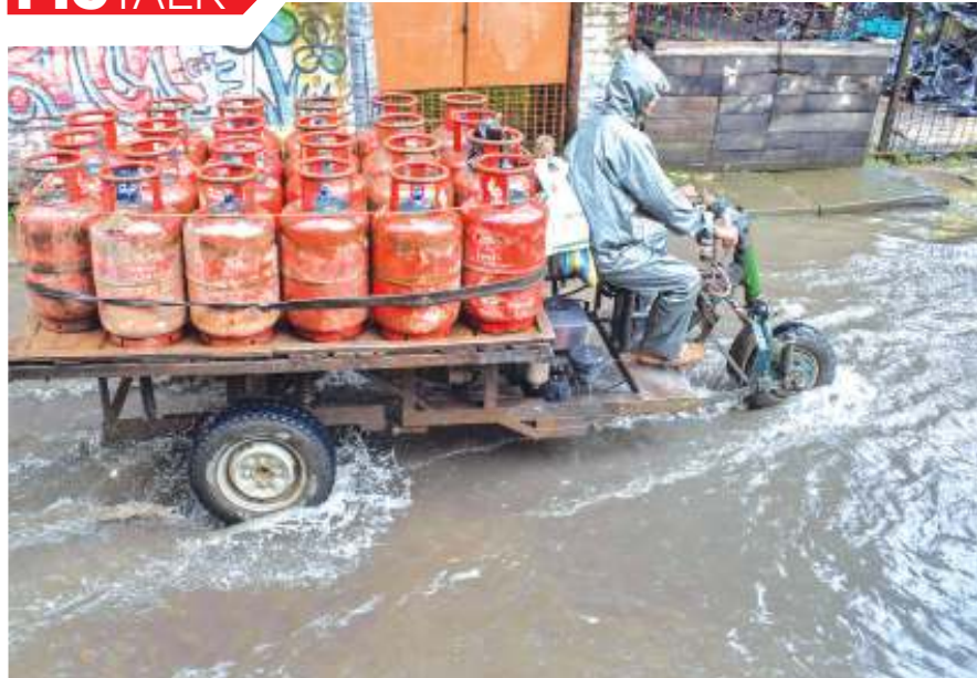
A man on a rickshaw wades through a waterlogged street during heavy rain in Nadia, West Bengal