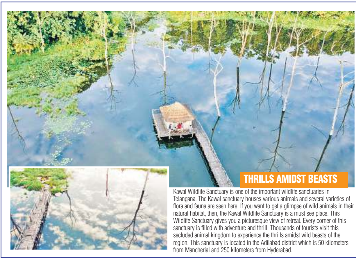
THRILLS AMIDST BEASTS