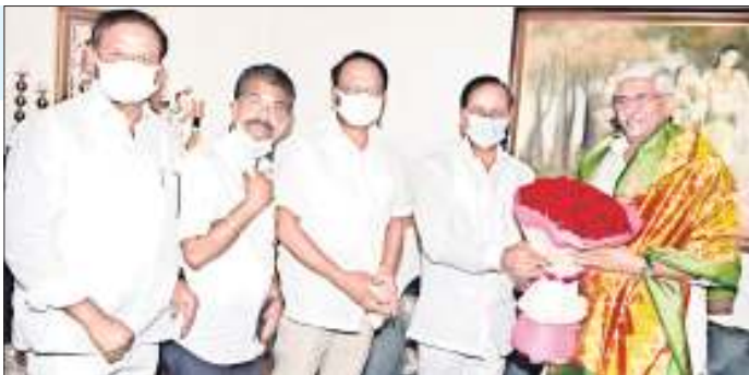
Chief Minister K Chandrasekhar Rao presents a bouquet of flowers to Union Jal Shakti Minister Gajendra Singh Shekhawat in New Delhi on Saturday.

According to those in the know, KCR reiterated the request that only projects common to both the Telugu States should be brought under the ambit of the jurisdiction of the Boards.