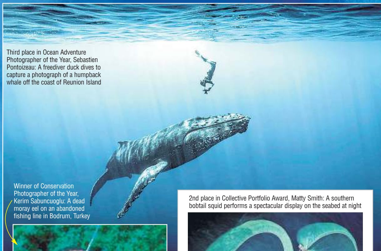
Third place in Ocean Adventure Photographer of the Year, Sebastien Pontoizeau: A freediver duck dives to capture a photograph of a humpback whale off the coast of Reunion Island