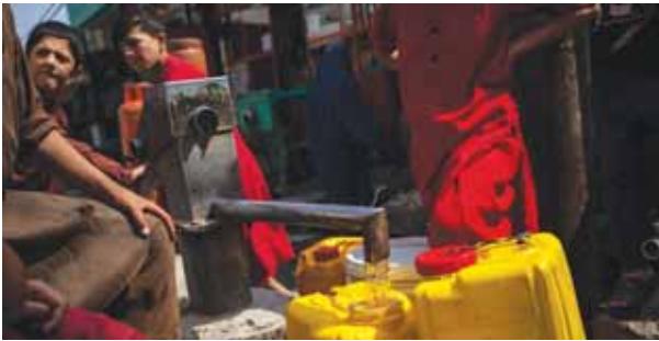
Afghan children collect water from a public water pump in Kabul on Thursday

shaped path, were 12 J-16 and two J-11s, as well as bombers and an anti-submarine aircraft. China has sent fighter jets toward Taiwan on an almost daily basis this past year. It stepped up its military harassment of the self-ruled island and has sent large displays of fighter jets after political events in which it views as interfering with its sovereignty. Taiwan and China split during a civil war in 1949, but China continues to claim Taiwan as part of its territory. Beijing opposes Taiwan's involvement in international