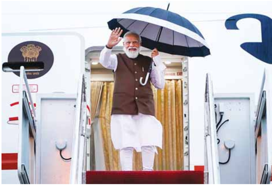
Prime Minister Narendra Modi being received by the dignitaries, on his arrival in Washington DC on Thursday