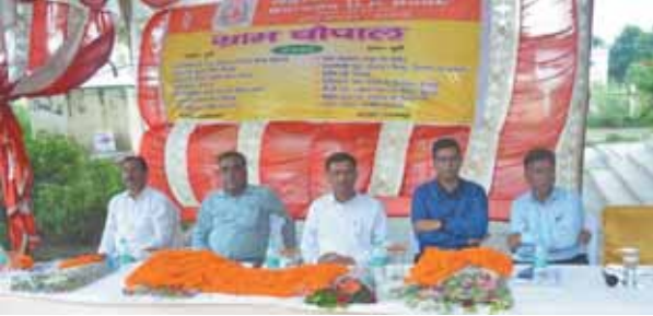
Gram Chaupal organized by Baroda UP Bank