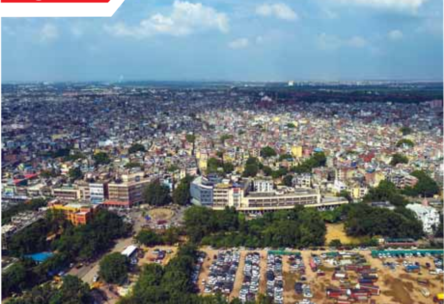
Clouds hover over the Old City area in Delhi