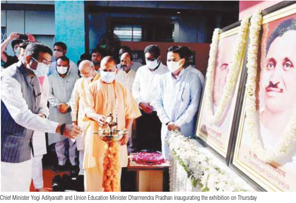
Chief Minister Yogi Adityanath and Union Education Minister Dharmendra Pradhan inaugurating the exhibition on Thursday

"The purpose of organising this exhibition today is also that the new generation should contribute in nation-building by taking inspiration from the personality and work of Prime Minister Modi ji," he said. Meanwhile, a meeting was held