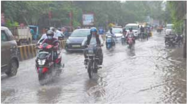
Rain lashes the city in Varanasi on Thursday.

Due to heavy water-logging as usual during the rains, many vehicles especially two-wheelers were stranded at