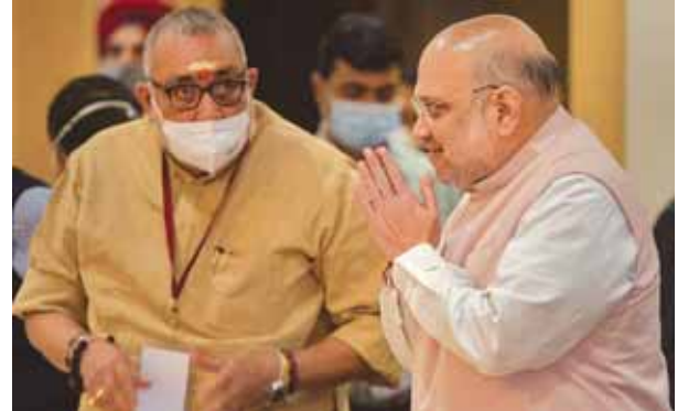
Union Home Minister Amit Shah arrives to chair a high-level meeting with Chief Ministers of ten Naxal-hit States, at Vigyan Bhawan in New Delhi on Sunday

The Chief Ministers who attended the meeting were Naveen Patnaik (Odisha), K Chandrashekar Rao (Telangana), Nitish Kumar (Bihar), Shivraj Singh Chouhan