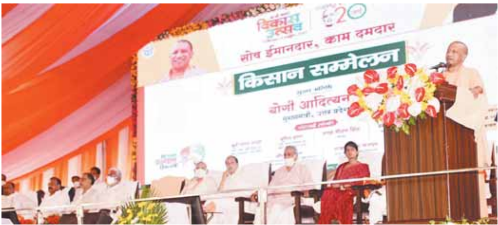
Chief Minister Yogi Adityanath addressing a gathering during Kisan Sammelan on Sunday

With the hike in SAP, the cane farmers will get Rs 350 per quintal for early variety, Rs 340 for common variety and Rs 330 for