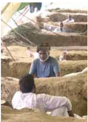
Farmers lie in pits during a protest against farm laws in Ghaziabad on Sunday

The Congress, the Aam Aadmi Party (AAP) and the Telugu Desam Party (TDP), Shiv Sena, Nationalist Congress Party, Trinamool Congress, Rashtriya Janata Dal, Samajwadi Party, Rashtriya Lok Dal, YS Jagan Mohan Reddy-led Andhra Pradesh