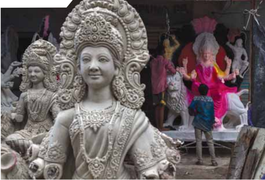
Goddess Durga's idols being readied ahead of the Durga Puja, in Hyderabad