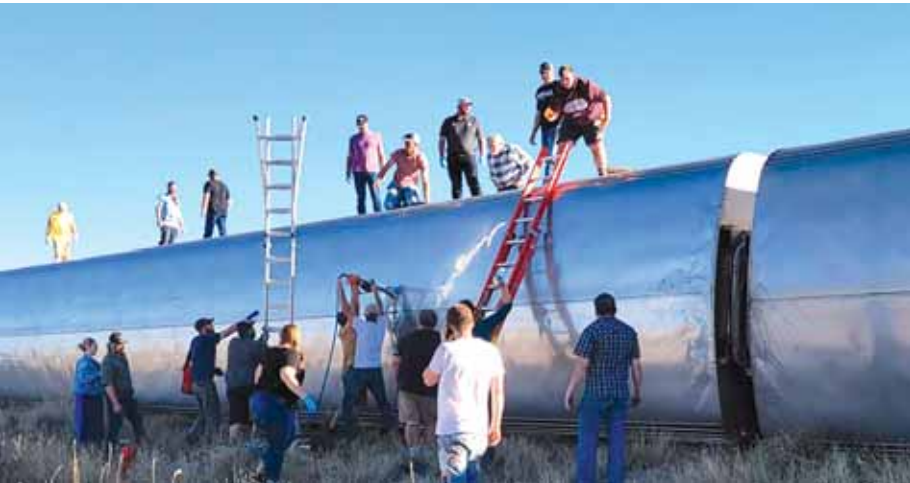
In this photo provided by Kimberly Fossen people work at the scene of an Amtrak train derailment on Saturday