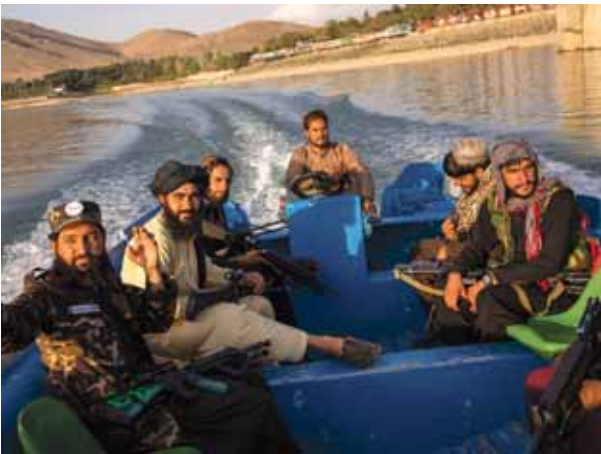
Taliban fighters enjoy a boat ride in the Qargha dam, outskirts of Kabul

The Taliban have promised an inclusive Government, a more moderate form of Islamic rule than when they last ruled the country from 1996 to 2001 including respecting women's rights, providing stability after 20 years of war, fighting ter-