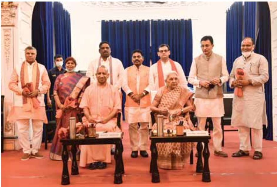
Uttar Pradesh Governor Anandiben Patel and Chief Minister Yogi Adityanath with newly sworn-in State Ministers during expansion of the Cabinet ahead of the UP Assembly elections in Lucknow on Sunday

the UP Cabinet earlier and seven more were inducted on Sunday as per the constitutional limit, out of which there are now 24 Cabinet Ministers including the Chief Minister.