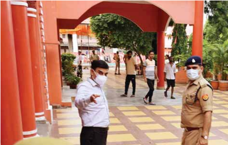
CBI officers investigating at Baghambari Gaddi Math

After collecting papers the CBI team visited Math Baghambari Gaddi in Allahpur area under the Georgetown police station where the Mahant was found dead. The CBI team examined the room of the Mahant and its door, which was pushed open by the Sewadars of the Math to find the seer allegedly hanging from the ceiling fan hook. The officials also visited the newly created Samadhi of the Mahant.