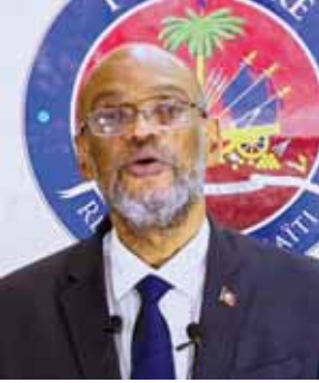
In this photo taken from video, Ariel Henry, Prime Minister of Haiti, remotely addresses the 76th session of the United Nations General Assembly in a pre-recorded message

"It is a debt to his memory, his family and the Haitian