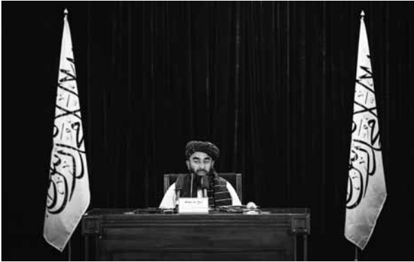
Taliban Government spokesman Zabihullah Mujahid gives a Press conference in Kabul, Afghanistan, on Tuesday

At a news conference Tuesday, Taliban Government spokesman Zabihullah Mujahid held out the possibility of adding women to the Cabinet at a later time, but gave