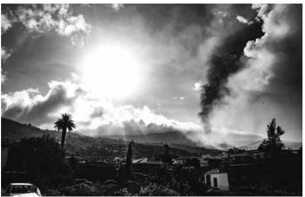
Smoke billows from a volcano near Los Llanos de Ariadne on the island of La Palma in the Canaries, Spain, on Tuesday

According to the official, as Biden delivered his first speech before the UN's General Assembly on Tuesday, Harris plans to continue her work to advance the Biden-Harris Administration's agenda to rebuild "our alliances and restore America's global leadership.