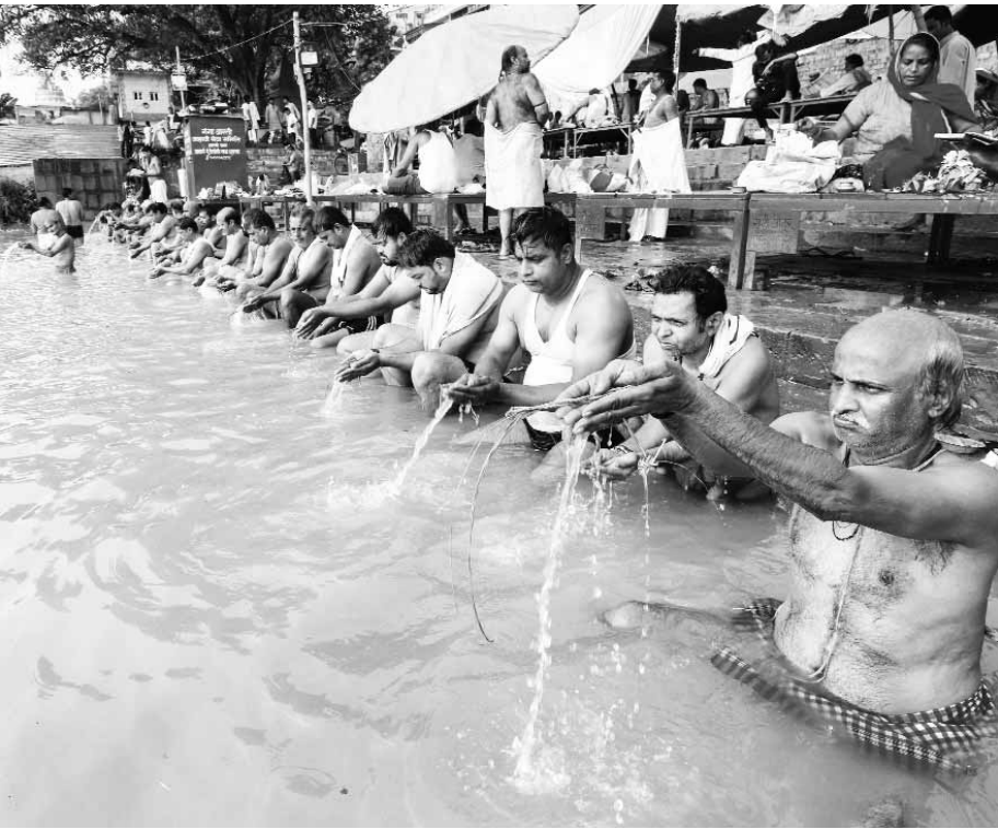
People perform 'Tarpan' ritual for the remembrance of their ancestors on the banks of the Ganga river during 'Pitri Paksha' at Assi ghat in Varanasi on Tuesday