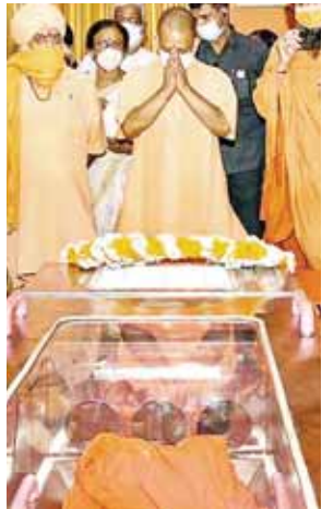
UP CM Yogi Adityanath pays tribute to Akhil Bharatiya Akhara Parishad president Mahant Narendra Giri Maharaj in Prayagraj on Tuesday

In that suicide note the Mahant has named his disciple