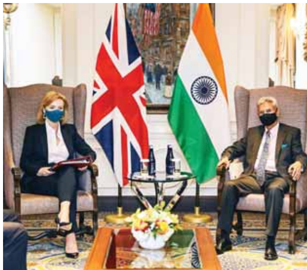
External Affairs Minister S Jaishankar meets new UK Foreign Secretary Liz Truss in New York