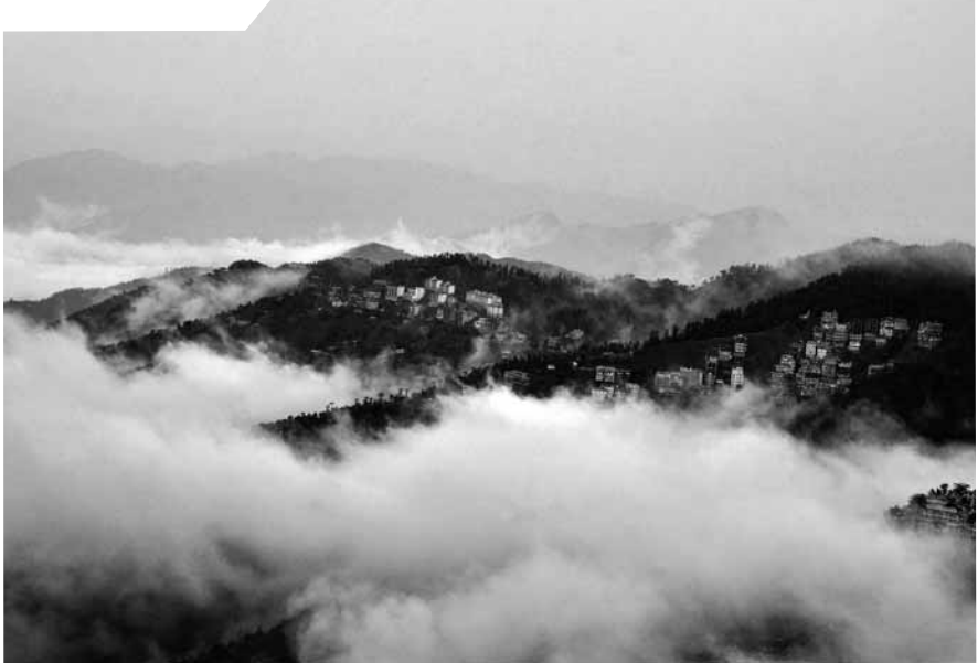
Fog engulfs the mountains after heavy rainfall in Shimla