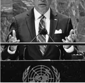
US President Joe Biden speaks during the 76th Session of the United Nations General Assembly at UN headquarters in New York on Tuesday

diplomacy with no shortage of crises facing the globe. He said he is driven by a belief that "to deliver for our own people, we must also engage deeply with the rest of the world."