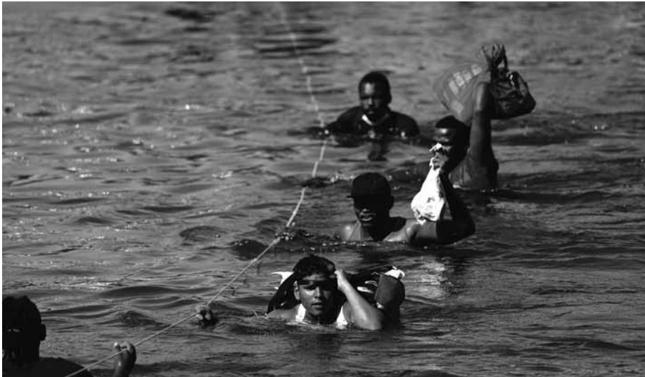
Migrants, many from Haiti, wade across the Rio Grande from Del Rio, Texas, to return to Ciudad Acuna, Mexico on Tuesday, to avoid deportation from the US. The US is flying Haitians camped in a Texas border town back to their homeland and blocking others from crossing the border from Mexico

French European Affairs Minister Clement Beaune said he would raise the trade pact and the security implications of the deal, known as AUKUS, at a meeting with his counterparts in Brussels, and that France would ensure that it is discussed at EU summits and ministerial meetings next month.