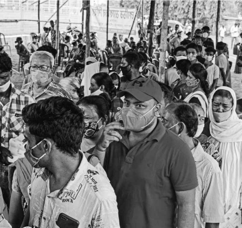
People wait to receive Covid-19 vaccine dose during a vaccination drive in Birbhum district on Tuesday

A 16-year-old girl was allegedly gang-raped by three persons, and died after consuming poison following the attack in Maharashtra's Parbhani district, police said on Tuesday. Two minor boys were among the accused apprehended for allegedly raping the girl, who consumed poison on September 14 and died while undergoing treatment at a hospital on Monday evening, an official said. According to the police, the alleged incident took place in Sonpeth area on September 12, and the girl consumed poison two days later, the official said. In her statement to the police on September 18, the girl said that she had attempted to take her own life as a result of the rape, he said. One of the accused was known to the victim and the trio had also stalked her two years ago, he said. Based on the victim's complaint, the police registered an FIR against the trio under relevant sections of the IPC and Protection of Children from Sexual Offences (POCSO) Act, the official said, adding that further probe is underway.