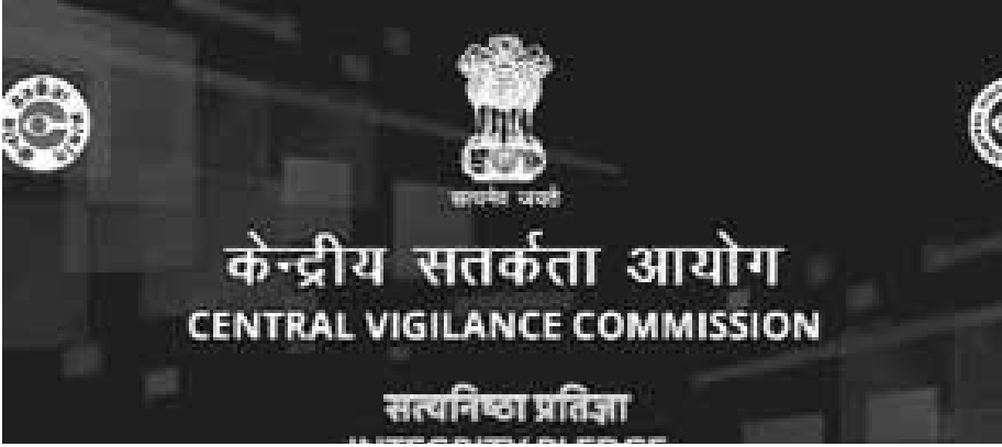
IANIS ■ NEW DELHI

The Central Vigilance Commission (CVC) has made recommendation for implementing the of Integrity Pact (IP) in all public procurements by the various Ministries and the Departments. IP helps government and companies to reduce high cost and maintain quality control. IP adoption creates public confidence and trust in decision making process. In its order issued on September 14, 2021, the CVC said that in order to enhance the transparency and probity in public procurement, it has provided the Standard Operative Procedure which also envisages the appointment of an independent external monitor.