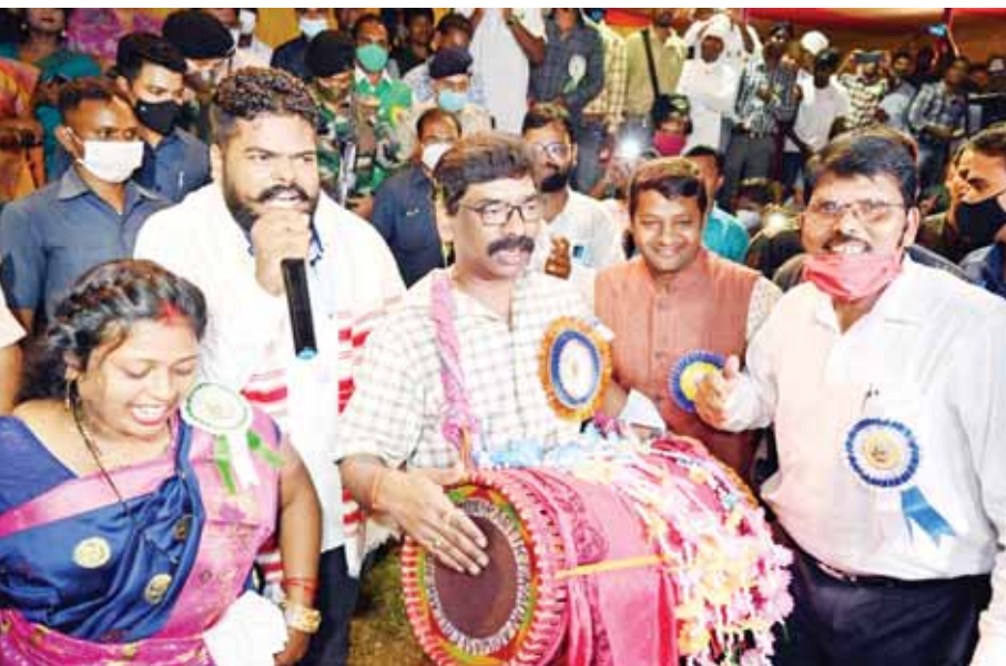
Chief Minister Hemant Soren plays with a traditional Mandar (drum) during the Karma Festival at Women's College Science block in Ranchi on Friday

Meanwhile, the active caseload of Covid-induced mucormycosis dropped to six as another patient of black fungus recovered in Dhanbad on Saturday, data compiled by the Integrated Disease Surveillance Programme (IDSP) highlighted. As per IDSP data, State has so far reported 168 cases of mucormycosis and at least 31 people have died of the fungal infection.