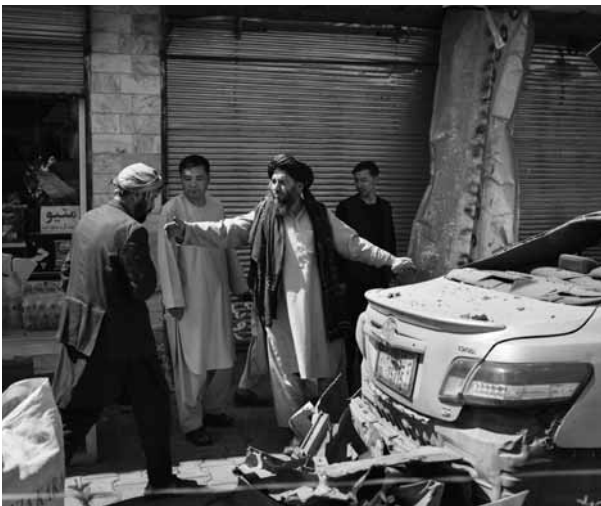
Taliban fighters and residents gather at the site of an explosion in Kabul on Saturday. A sticky bomb exploded in the capital Kabul