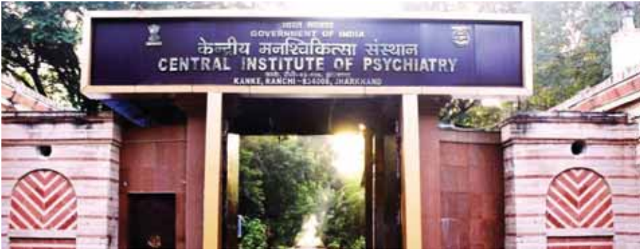
A view of Central Institute of Psychiatry in Ranchi

“A proper procedure has to be followed for involuntary hospitalisation of prisoners suffering from mental illnesses or the people police find on the streets and bring to us. This training will also cover the standard procedure for this process,” said Bhattacharjee.