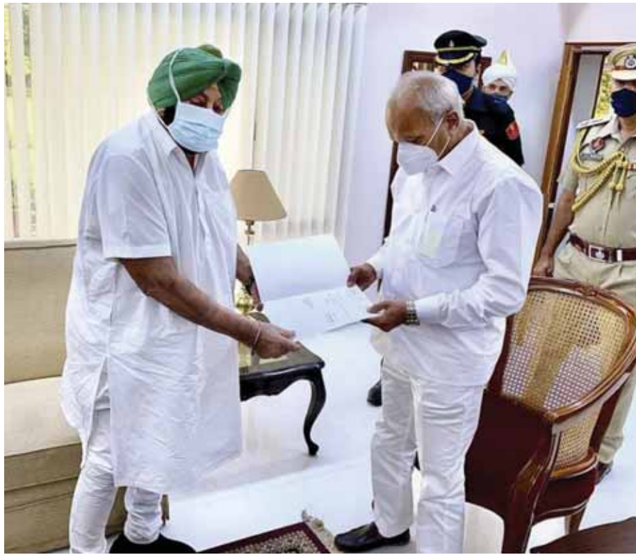
Punjab Chief Minister Capt Amarinder Singh submits his resignation to Governor Banwarilal Purohit at the Raj Bhavan in Chandigarh on Saturday

"I was humiliated three times by the Congress leader-