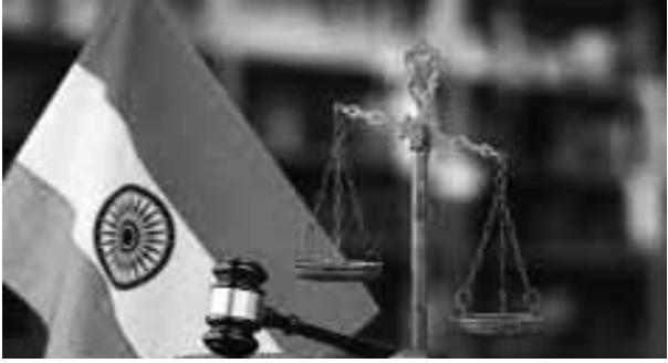
PTI ■ NEW DELHI

The Supreme Court has said that courts can exercise their power to proceed against persons not accused but appearing to have committed an offence only when there is "strong and cogent evidence" against such individuals and not in a "casual and cavalier manner". Under Section 319 of Code of Criminal Procedure (CrPC), when during the course of inquiry or trial of offence, it appears from the evidence that any person, who has not been made an accused, has committed any offence; the court can proceed against such individual for the offence which he appears to have committed. A bench of justices K M Joseph and P S Narasimha while dealing with a criminal case said, "This is yet another case where summons issued purporting to invoke power under Section 319 of the CrPC has brought the newly summoned person to this court."