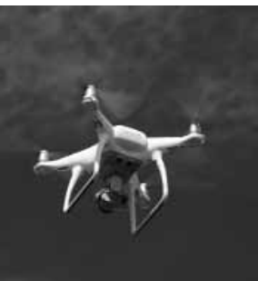
IANIS ■ NEW DELHI

Dunzo Med Air consortium will conduct drone trials for the 'Medicine from Sky' initiative of the Telangana Government from Monday. Accordingly, drone delivery tech firm, 'Skye Air' that focuses on an end-to-end ecosystem for UAV based logistics will be conducting this as a part of the 'Dunzo Med Air' consortium led by the hyper local giant, 'Dunzo Digital'. The trials will begin on September 20 in Vikarabad, Telagana and shall continue till September 25 during which several healthcare logistics related cases will be demonstrated. On its part, Skye Air said it will conduct around 50 flights all delivering vaccines. These BVLOS 'Beyond Visual Line of Sight' trials will deliver vaccines up to 12 km within an expected time frame of 18 minutes. Each drone will carry vaccines in temperature-controlled boxes.