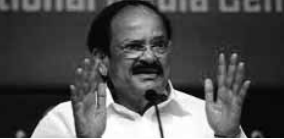
■ NEW DELHI

In a first of its kind observation by any presiding officer of the legislatures in the country and in the context of rising disruptions, Rajya Sabha Chairman M Venkaiah Naidu on Saturday unequivocally held that disruptions of proceedings amount to contempt of the House and disruptors can't claim it as their privilege to do so. Delivering the second Ram Jethmalani Memorial Lecture on "Is disruption of parliamentary proceedings an MP's privilege and/or a facet of parliamentary democracy?" Naidu spoke at length on the intentions of various rules and other provisions requiring high standards of behaviour of MPs in the House and the scheme of privileges and argued that disruptions negate the objective of