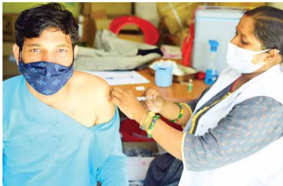
A medic inoculates a man with Covid 19 vaccine in Ranchi on Saturday