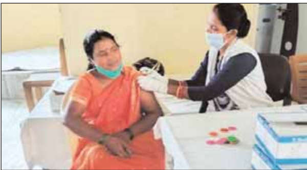
A beneficiary receives Covid-19 vaccine at a vaccination centre in Ranchi on Sunday

As per provisional data compiled by the National Health Mission (NHM), the state on Sunday administered the first dose of vaccine against Covid-19 to as many as 94,462 residents, while the second jab was administered to at least 46,163 beneficiaries. More than 1 lakh beneficiaries vaccinated on the day fell in the age bracket of 18 years to 44 years.