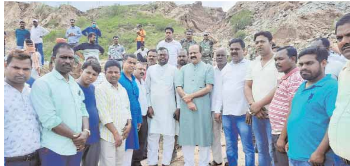
A delegation of Bharatiya Janata Party (BJP) meets family members of seven girls who drowned in a pond during Karma Puja rituals at Bukru village in Latehar district on Saturday

demand a compensation of ₹10 lakh for deceased family members. The Chatra MP targeting the State Government said, "Despite the occurrence of such a big incident in the area, neither any minister nor any officer of the state government had bothered to visit the victim's family members, it shows the insensitivity of the government."