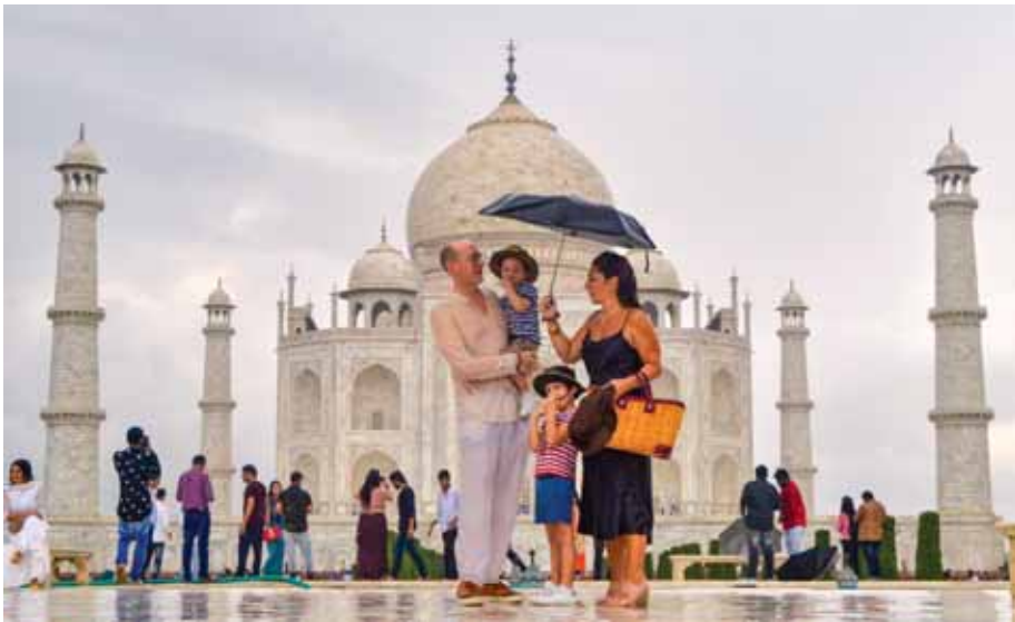
Tourists walk on the premises of Taj Mahal during the rain in Agra