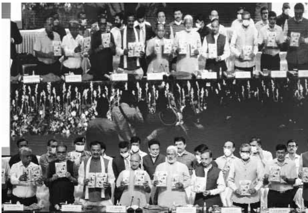
Uttar Pradesh Chief Minister Yogi Adityanath releases a book on completing 4.5 years of his Government at Lok Bhawan in Lucknow on Sunday

“In the 2022 Assembly elections, BJP will cross 350 seats (out of 403 seats), and