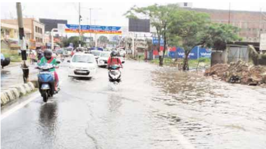
Commuters wade through a waterlogged road after heavy rains in Ranchi on Saturday night