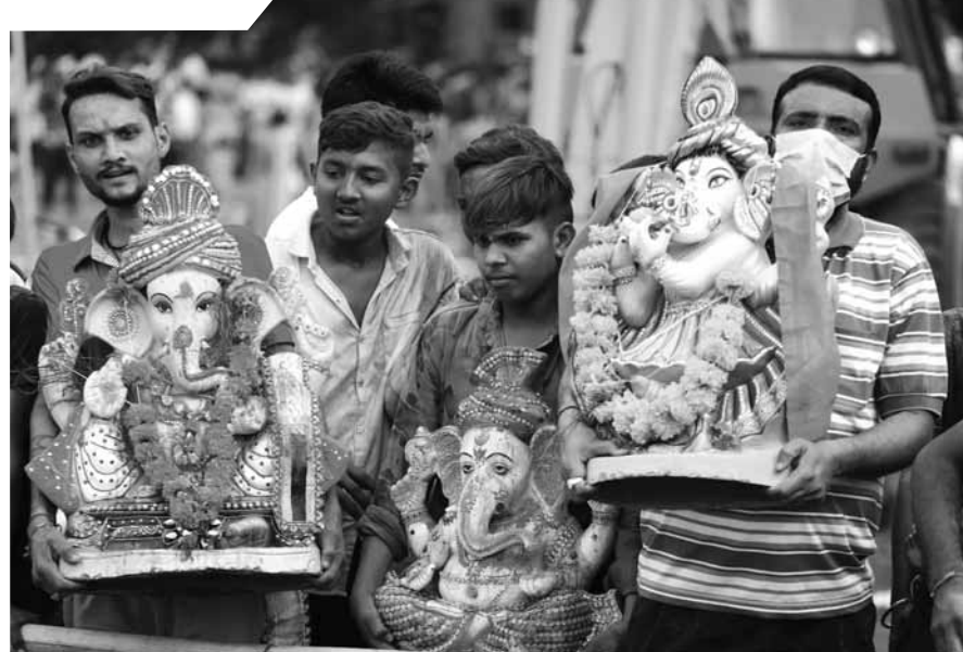
Devotees carry idols of Lord Ganesha to immerse them to mark Ganesh Chaturthi, in Ahmedabad