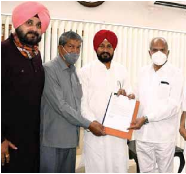
Punjab Chief Minister-designate Charanjit Singh Channi submits a letter to Punjab Governor Banwarilal Purohit after being named as the next CM, at the Raj Bhavan in Chandigarh on Sunday

Channi, 58, a three-time MLA from Rupnagar's