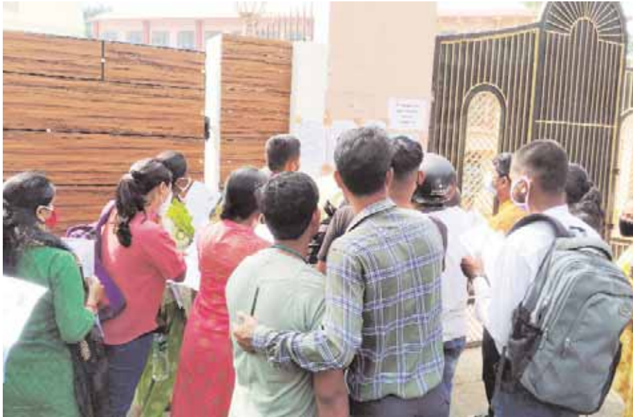
Aspirants look for their seats before entering an examination centre to appear for Jharkhand Public Service Commission (JPSC) examination in Ranchi on Sunday

Earlier, the government had decided to conduct the prelims tests for JPSC on May 2, but the exam date had to be