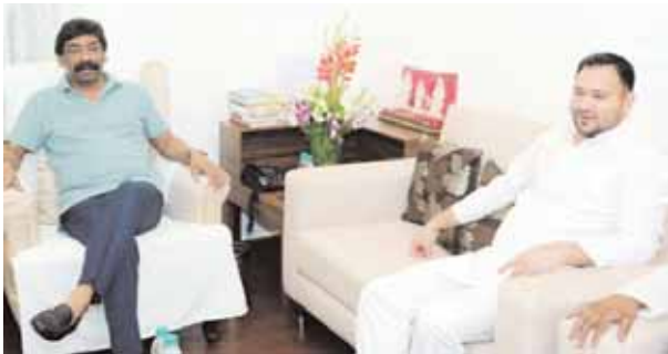
RJD senior leader Tejashwi Yadav meets Chief Minister Hemant Soren at his official residence in Ranchi on Sunday

Yadav said that the party might have lost the status of the kingmaker. But one should not be disappointed if the graph of the party has fallen. He said jointly they can revive the party