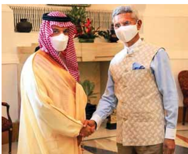
External Affairs Minister S Jaishankar welcomes Foreign Minister of Saudi Arabia Prince Faisal bin Farhan Al Saud during his visit to India