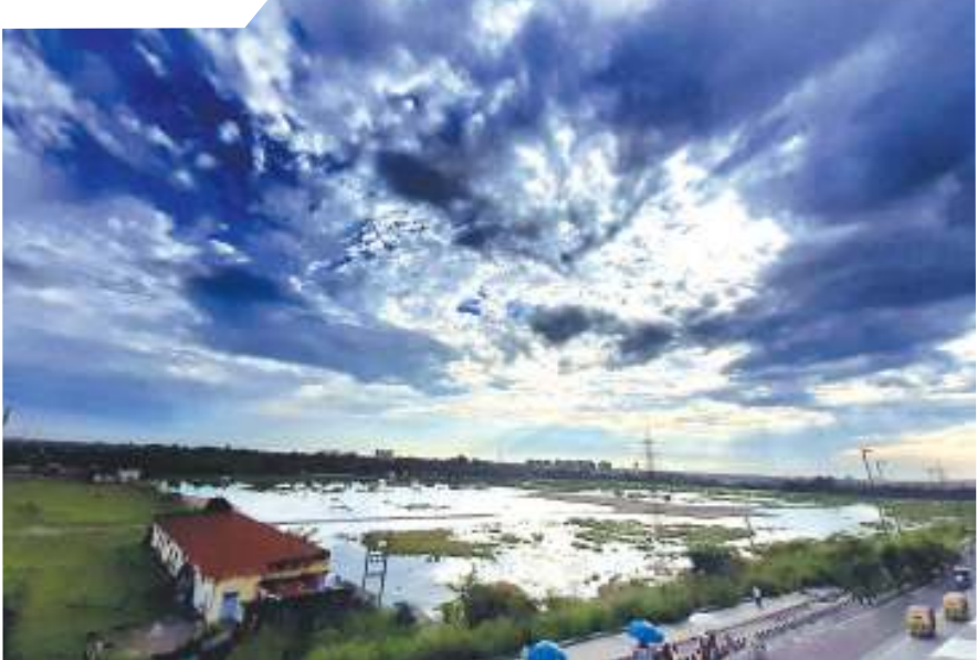
Dense clouds form over the fields after a heavy rain spell, in New Delhi