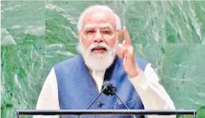
Prime Minister Narendra Modi addresses the 76th United Nations General Assembly on Saturday.