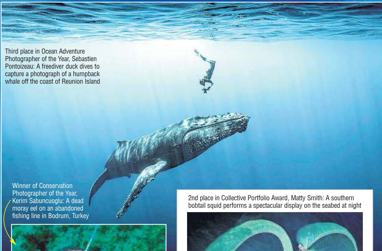
Third place in Ocean Adventure Photographer of the Year, Sebastien Pontoizeau: A freediver duck dives to capture a photograph of a humpback whale off the coast of Reunion Island