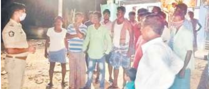
Police officials caution fishermen about the impending danger off Vizag coast on Saturday.