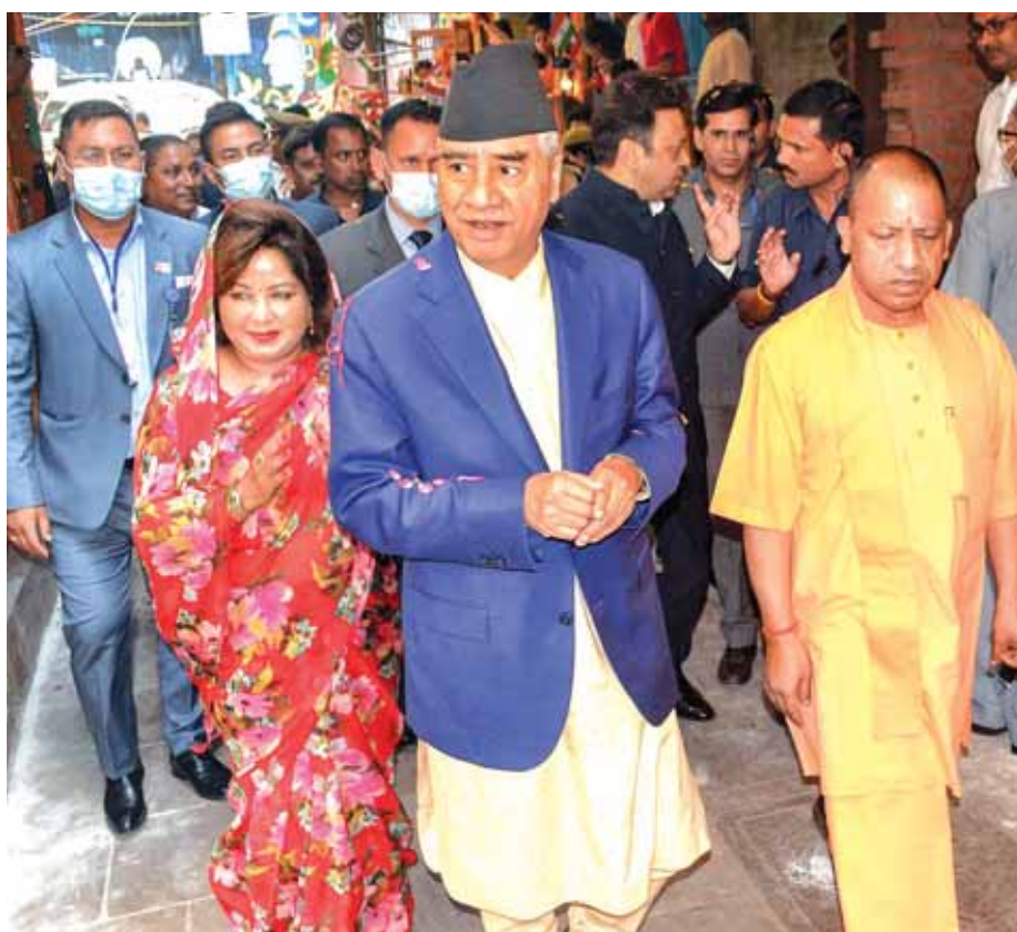
Nepal PM Sher Bahadur Deuba and his wife Arzu Rana Deuba with UP CM Yogi Adityanath, in Varanasi on Sunday