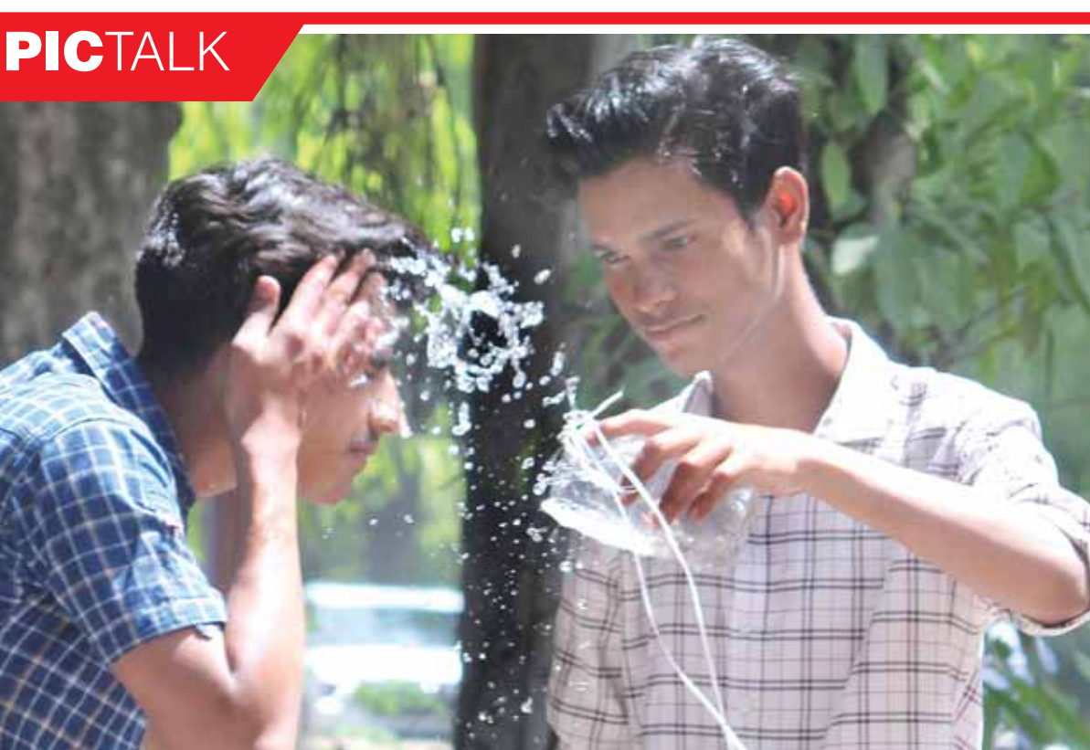
People protect themselves from scorching heat on a hot day

"During further investigation, another raid was conducted at Gurugram, Haryana and one accused, namely Sumit was arrested, who used to make calls to victims through a fraudulently obtained WhatsApp number," said the DCP.