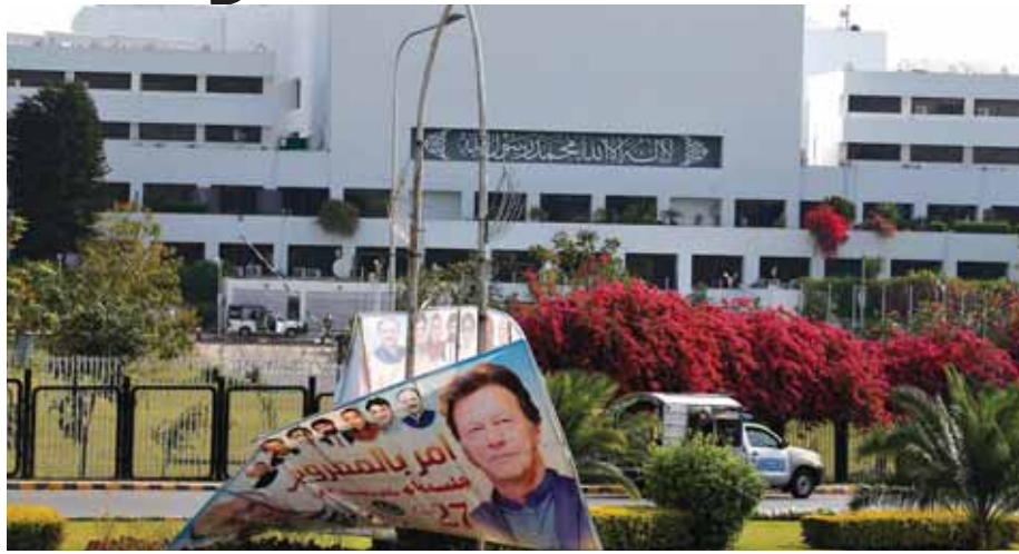
Pakistani paramilitary troops patrol near a billboard with the picture of Pakistan's Prime Minister Imran Khan displayed outside the National Assembly, in Islamabad, Pakistan on Sunday

Khan was widely expected to lose the no-confidence motion moved by an alliance of Opposition politicians in the National Assembly — includ-