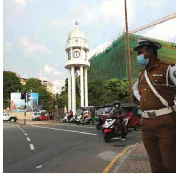
A Sri Lankan police officer stands guard during the curfew in Colombo, Sri Lanka, on Sunday

Defying curfew orders, lawmakers from Sri Lanka's