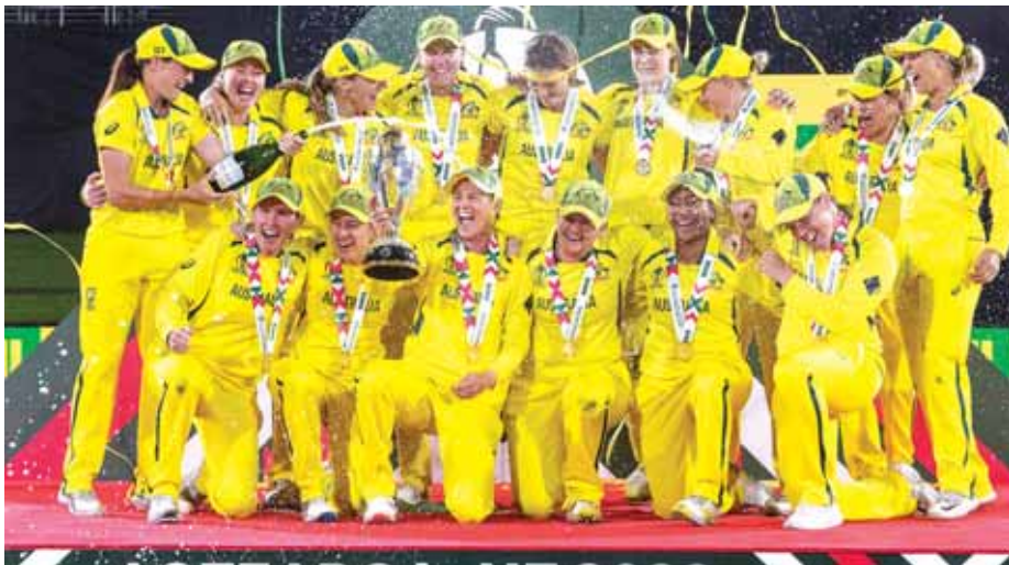
Australian players celebrate defeating Eng in the final of the ICC Women’s Cricket WC match in Christchurch, NZ

overs. Natalie Sciver, who scored an unbeaten 148 off 121 balls for her second successive hundred against Australia in the competition, eventually ran out of partners. Australian pacer Megan Schutt (2/42) bowled a brilliant new ball spell removing last match centurion Danielle Wyatt (4) and Tammy Beaumont (27) with her lethal in-swingers before leg-spinner Alana King (3/64) turned the ball on a batting beauty to end with three crucial wickets including that of England skipper Heather Knight (26). Healy, who was dropped on 41, toyed with the English attack in her mesmerising knock, which is now the highest-ever