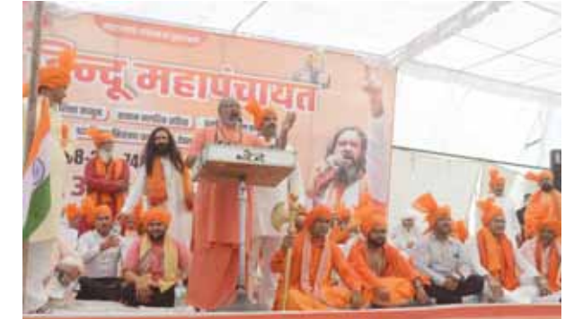
People participate in the Hindu Mahapanchayat at Burari Ground in New Delhi on Sunday

"Only in 2029 or in 2034 or in 2039 a Muslim will become the prime minister. Once a Muslim will become the PM, 50 per cent Hindus will convert, 40 per cent will be killed and the remaining 10 per cent will either live in