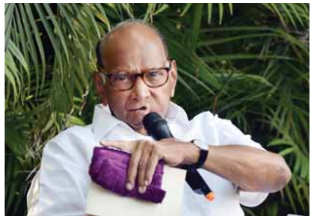
NCP chief Sharad Pawar addresses the media during a press conference at his residence in New Delhi on Wednesday