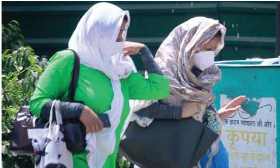
Women use stoles to protect themselves from the hot summer sun

According to the IMD, a "heatwave" is declared in plains, when the maximum temperature is over 40 degrees Celsius and at least 4.5 notches above normal. A "severe" heatwave is declared if departure from normal temperature is more than 6.4 notches, according to IMD.