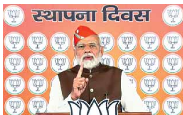
Prime Minister Narendra Modi virtually addresses BJP workers on the occasion of the party's foundation day

Addressing the BJP workers virtually here on the party's 42nd foundation day — it was founded on April 6, 1980 — the Prime Minister said his