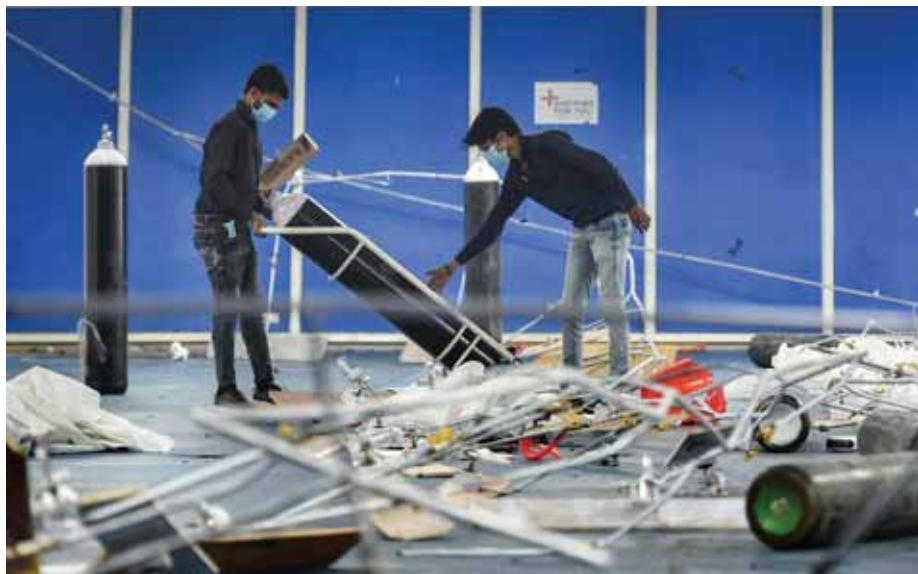
Workers dismantle Covid-19 care equipment at the CWG Village Covid Care Centre in New Delhi on Wednesday

A senior BMC medical official said here on Wednesday