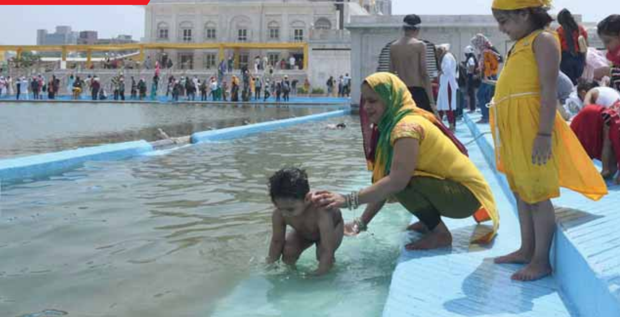
Sikh devotees take a dip in the holy sarovar at Gurudwara Bangla Sahib on the occasion of Baisakhi in New Delhi on Thursday