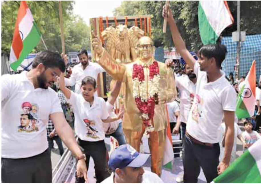
A tableau of Babasaheb BR Ambedkar on his 131st birth anniversary, at Parliament Street, in New Delhi on Thursday.

Wednesday issued an advisory asking all schools across Noida and Greater Noida to immediately inform it about any child suffering from cough, cold, fever, diarrhoea or showing any symptom of Covid for timely treatment. "If any child studying in your school has cough, cold, fever, diarrhoea or any symptom of Covid, then you are requested to immediately inform the Chief Medical Officer's office using help line no-1800492211 or email cmogbnr@gmail.com or ncmogbnr@gmail.com, so that proper treatment can be provided in time," the advisory stated. Since the outbreak of the pandemic in March 2020, a total of 98,787 people in Gautam Buddha Nagar district of Uttar Pradesh have tested positive for Covid-19, while 490 of them have died due to the corona infection, according to official data.