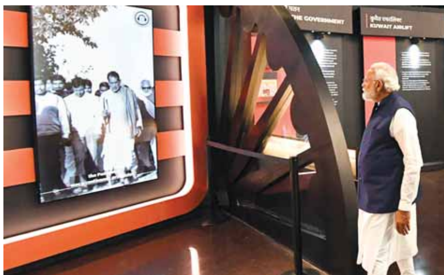
Prime Minister Narendra Modi at the inauguration of Pradhanmantri Sangrahalaya in New Delhi on Thursday

an obligation to keep strengthening democracy with our efforts," he added. Highlighting the inclusive and accommodative elements of Indian culture, Modi said "our democracy inspires us to accept modernity and new thoughts."