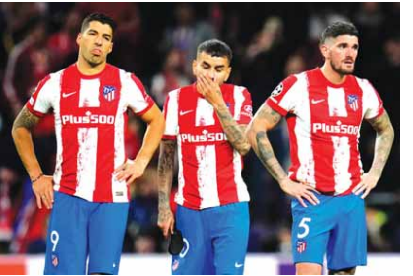
■ MADRID

Manchester City held off a late surge by Atletico Madrid on Wednesday as a bad-tempered stalemate at the Wanda Metropolitano saw Pep Guardiola's side safely through to the Champions League semi-finals. Kevin De Bruyne's first-leg strike last week at the Etihad Stadium proved enough for City to claim a 1-0 victory on aggregate in Madrid, although the Belgian had to go off with an injury which, if serious, would be a hammer blow to their hopes of winning the treble. Kyle Walker also hobbled off in the second-half. City will now face Real Madrid, with Liverpool up against Villarreal in the other semi to complete an all Spanish-English line-up in the last four. A prickly contest boiled over in the final minutes when Atletico's Felipe was sent off for a wild swipe at Phil Foden, the City midfielder already with his head in a bandage from an earlier Felipe challenge. The exchange sparked a mass brawl in the corner, which only checked Atletico's momentum as the hosts finally put an otherwise dominant City under pressure in the last 10 minutes. Diego Simeone was widely criticised for Atletico's negative tactics in the first leg and there was only a minor shift here, with the plan still to keep the game tight ahead of a final push.