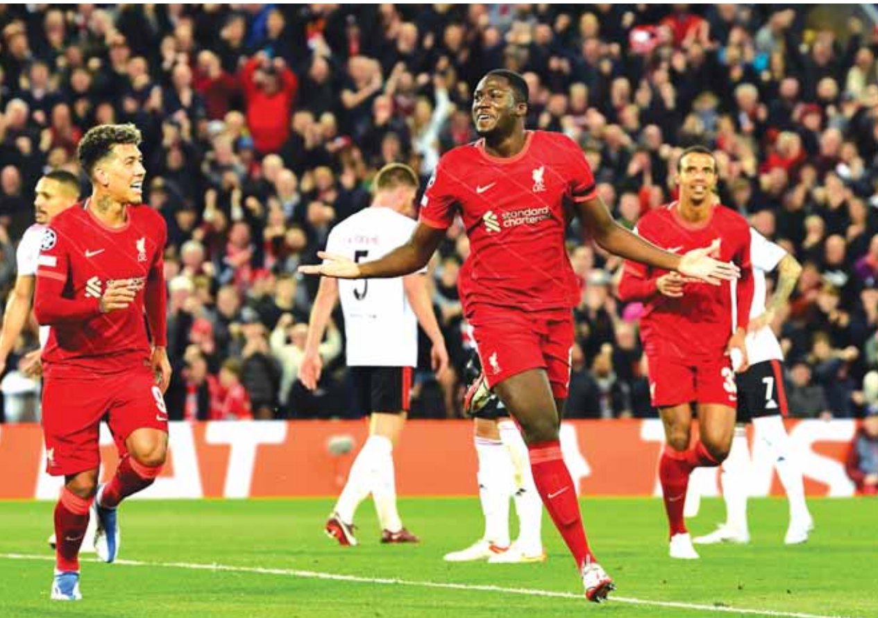
LIVERPOOL

Liverpool booked a Champions League semi-final showdown against Villarreal as the quadruple chasers survived a late collapse in Wednesday's 3-3 draw against Benfica. Jürgen Klopp's side already had one foot in the last four after winning 3-1 in the quarter-final first leg in Lisbon. They were on cruise control for long spells in the second leg at Anfield, but had to hold their nerve before advancing 6-4 on aggregate after an uncharacteristic meltdown in the closing stages. Ibrahima Konaté put Liverpool ahead before Goncalo