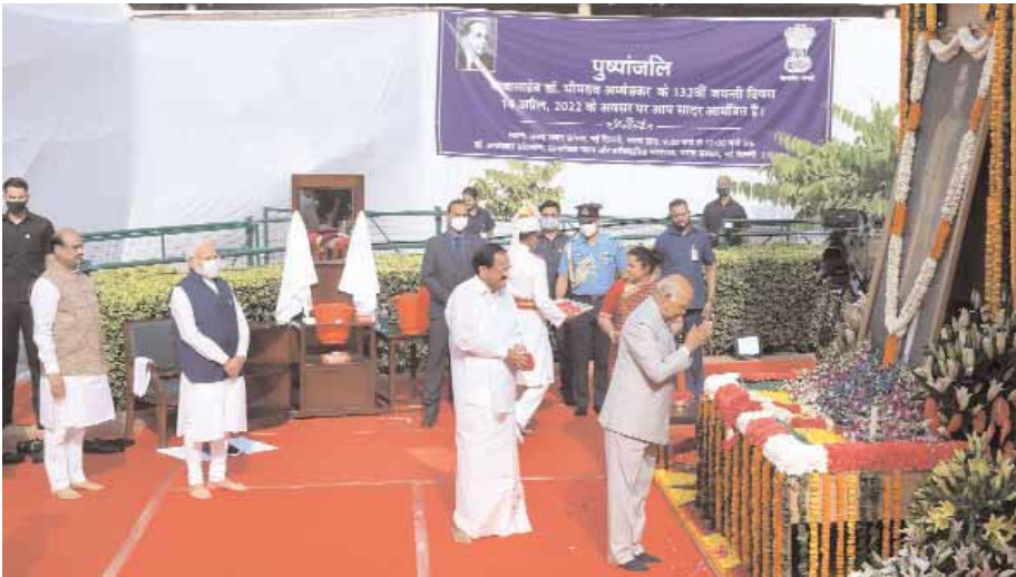
President Ram Nath Kovind, Vice-President M Venkaiah Naidu, Prime Minister Narendra Modi, Lok Sabha Speaker Om Birla, and other dignitaries pay tribute to Babasaheb Ambedkar on his 131st birth anniversary, at Parliament House in New Delhi on Thursday