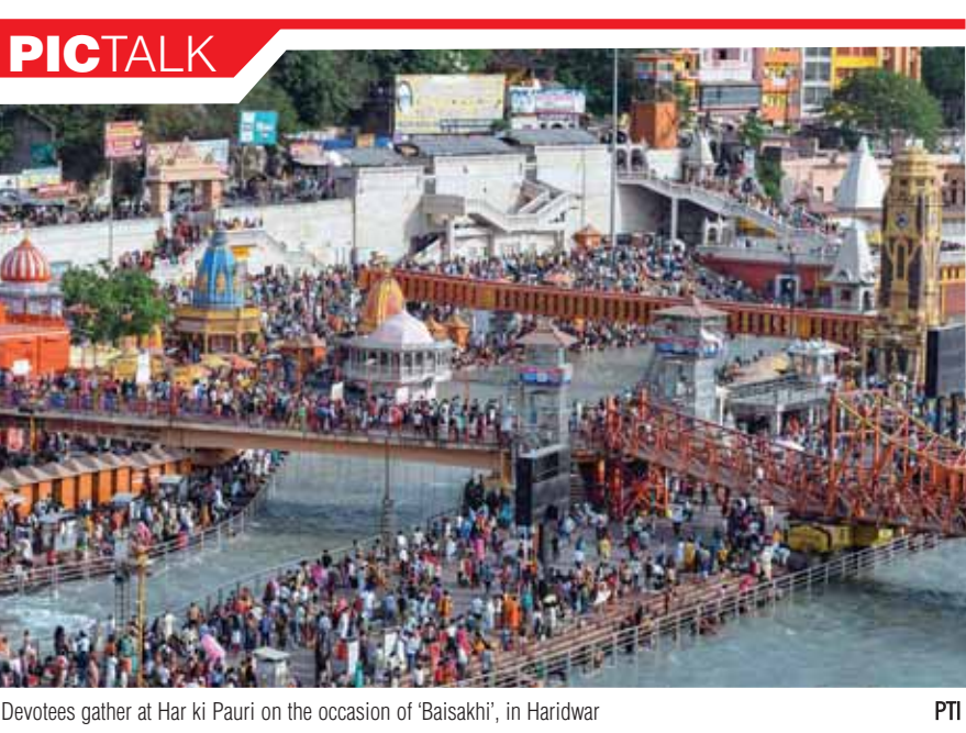
Devotees gather at Har ki Pauri on the occasion of 'Baisakhi', in Haridwar