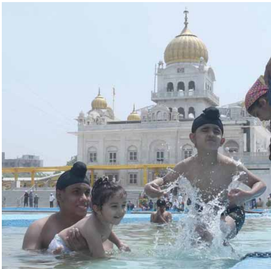
Sikh devotees take a dip in the holy sarovar at Gurudwara Bangla Sahib on the occasion of Baisakhi festival in New Delhi on Thursday