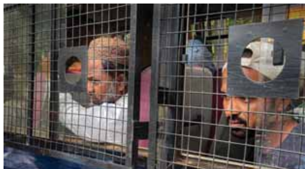
Security personnel detain people, after incidents of stone throwing in some areas of Old Hubballi late on Saturday evening, in Hubballi district on Sunday