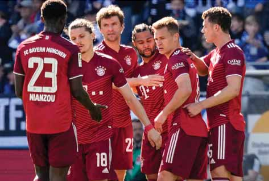
AP ■ MUNICH

Bayern Munich can secure a 10th straight Bundesliga title next weekend after they bounced back from their Champions League exit in midweek with a 3-0 win at Arminia Bielefeld on Sunday.