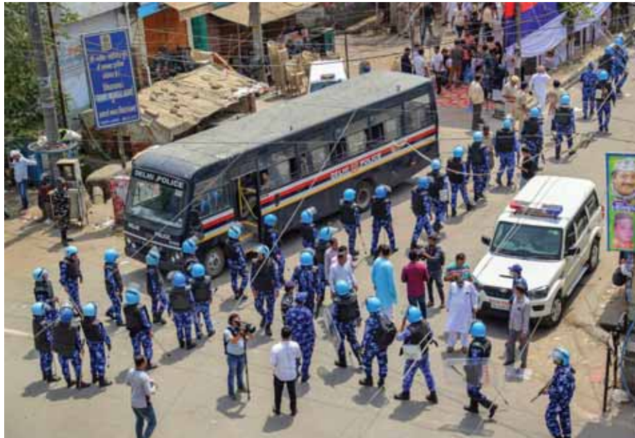
Rapid Action Force personnel keep vigil after clashes broke out between two communities during a Hanuman Janmotsav procession on Saturday, at Jahangirpuri in New Delhi on Sunday

On Sunday, senior police officials held a meeting with members of Aman (peace) committees and asked them to appeal to the people to main-