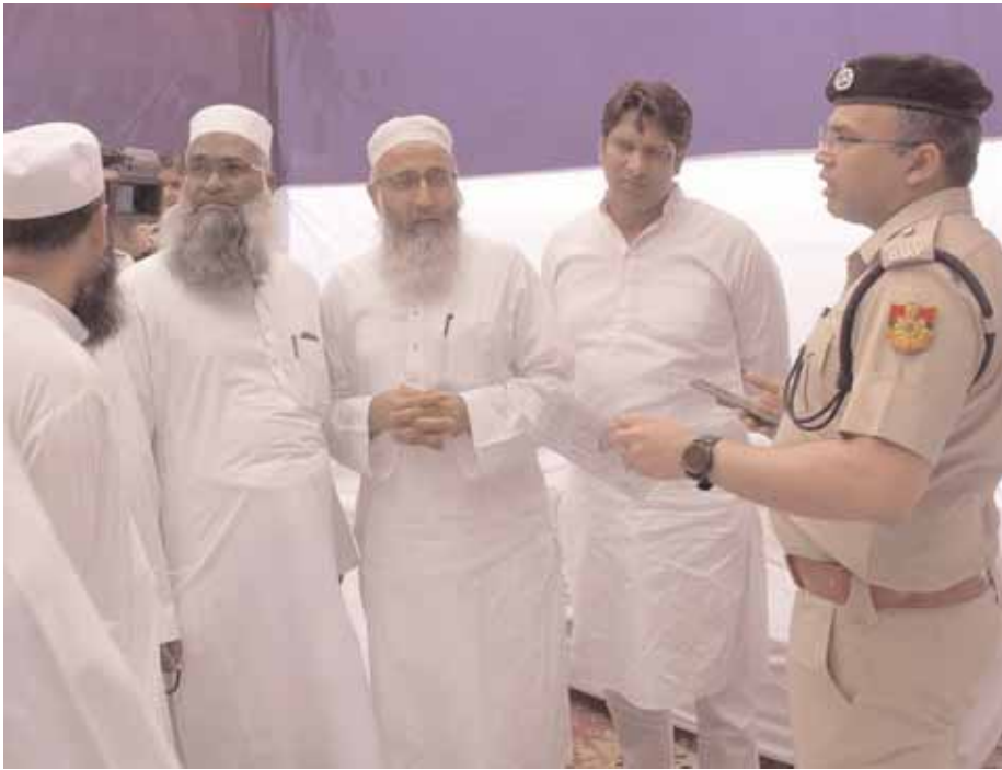
DCP North West at Kushal Chowk in PS Jahangirpuri area with the members of Aman committee of PS Jahangirpuri, PS Mahendra Park and PS Adarsh Nagar during a meeting, after clashes broke out between two communities during a Hanuman Jayanti procession on Saturday, at Jahangirpuri in New Delhi on Sunday

The members of the Aman committees were also urged to counter any rumour, misinformation and asked to be vigilant towards the activities of any mischievous or anti-social elements, said the DCP, adding that they were also requested to keep in touch with the police and immediately report anything suspicious. Situation in Jahangirpuri area is fully under control. Adequate police force has been deployed in the area. Area domination, foot patrolling and deep deploy-