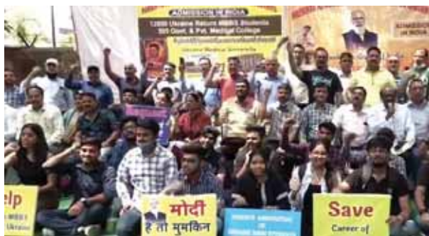
Students who returned from Ukraine gather along with their parents at Delhi's Jantar Mantar demanding admission to Indian institutions