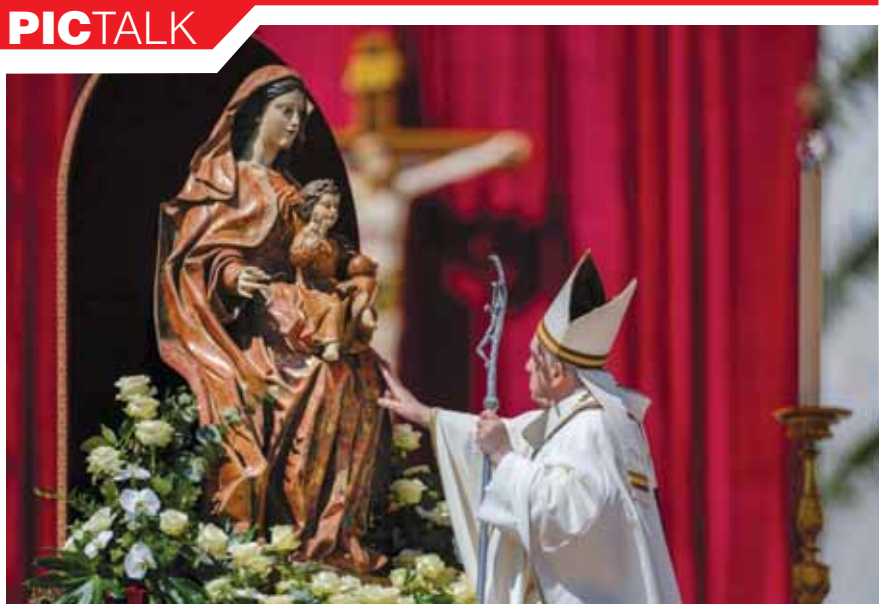
Pope Francis touches a statue of Virgin Mary at the end of the Catholic Easter Sunday mass

They are also not unorganised workers as specified in the Unorganised Workers Social Welfare Security Act, 2008. Most European countries are extending social security benefits to their gig workers. The European Union plans to declare them as regular employees. The crux of the matter is that they are ‘workers’ and should be declared so, the aggregators’ arguments notwithstanding. A large section of the gig workers are graduates, even postgraduates. Gig work for them is de-skilling. Imagine, that goes against the grain of the rational principle of economic progress and people’s empowerment. The gig economy is a grey area though it brings in revenues worth billions. The employee-employer relations are grey. The employment itself is grey because a third party, the vendor, is involved. The workers are not part of any workforce. They get no holidays, no sick leave, no provident fund, no pension. Since they are not workers, they have no avenues of protest. They have been around for nearly a decade, but the laws of the land have not been updated to give them any status. A legislation is required to protect these workers, but not at the cost of the gig economy itself. A balance is needed between giving the workers minimum pay and benefits and ensuring that the businesses are not disrupted. That helps none.