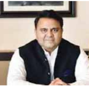
PTI ■ ISLAMABAD