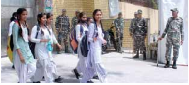
Security personnel keep vigil as students come out of a school in Jahangirpuri in New Delhi on Tuesday

However, the road in front of the mosque in C block, where the procession was allegedly attacked, remained closed and the entire area has been cordoned off with barricades by the police. Police have also pitched tents near the barricades and the area has been divided into five sectors to efficiently secure it in case of any emergency. The Crime Branch has also intensified the investi-