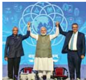
Prime Minister Narendra Modi with Director-General of the World Health Organization Tedros Ghebreyesus and Mauritius Prime Minister Pravind Kumar Jugnauth at the foundation stone laying ceremony of WHO Global Centre for Traditional Medicine in Jamnagar on Tuesday

New Delhi: Russia's war against Ukraine as well as cooperation in the Indo-Pacific will feature in the discussions European Commission President Ursula von der Leyen will have with Indian leaders during her visit to New Delhi next week, the EU said on Tuesday.