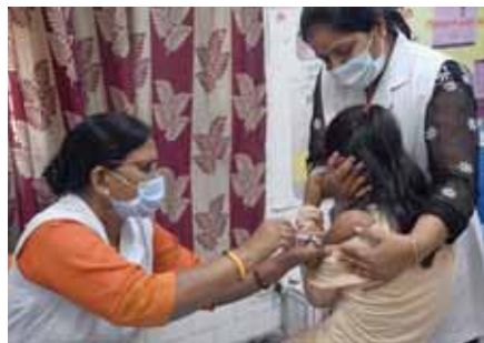
A health worker administers Covid-19 vaccine to a girl at a dispensary in New Delhi on Tuesday

Sources said the DDMA meeting is likely to discuss the mandatory use of face masks and hybrid modes of offline and online teaching for schoolchildren as well. Health Department officials believe the mask rule should be tightened in crowded public places, especially in indoor settings in order to contain the infections.