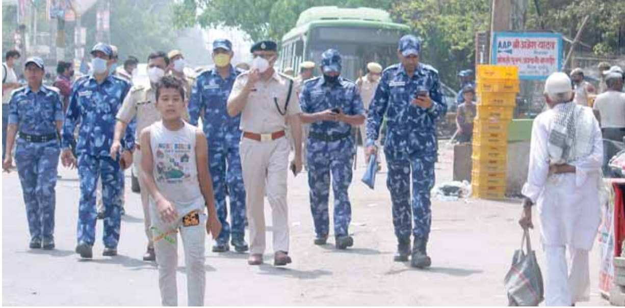
Security personnel patrol in the violence-hit Jahangirpuri area in New Delhi on Tuesday

Based on its interaction with the people of the affected area in northwest Delhi, the team said Hindus and Muslims have been living there "together for decades" and claimed that those who participated in the violence on Saturday were outsiders. bThe report noted that the violence broke out when a Hanuman Jayanti procession led by Bajrang Dal activists, who were armed with pistols and swords, reached the road in front of a mosque. "Why wasn't it stopped then? Why were they allowed to raise slogans outside the mosque at a time when the Roza had ended and a crowd of Muslims was expected?" the report asked, holding the Delhi Police responsible for the clashes between two communities. The fact-finding team comprised the CPI(M), the CPI, CPI-ML and Forward