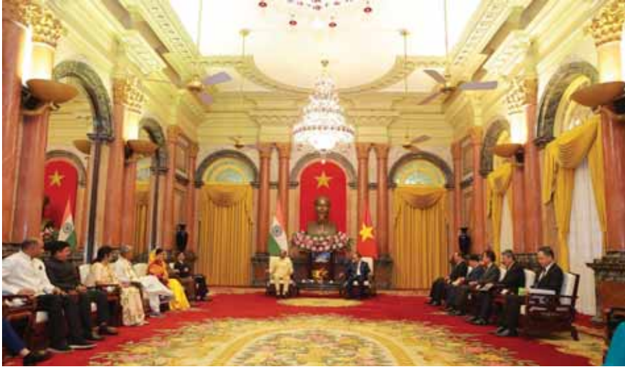
Visiting Indian Parliamentary delegation led by Lok Sabha Speaker Om Birla with President of Vietnam Nguyen Xuan Phuc at the Presidential Palace on Tuesday

During the exercise, 13 ships and 10 aircraft from ICG, one C-131 aircraft from the Indian Air Force, two ships from SACEP member states viz. Sri Lanka and Bangladesh and one Offshore Supply vessel (OSV) from Oil and Natural Gas Commission(ONGC), assets from Shipping Corporation of India and tugs from Mormugao Port Trust demonstrated containment cum marine spill recovery by side sweeping arms, deployment of booms and skimmers and streaming of single ship operated containment cum recovery system. The participants also practised firefighting drill, rescue operation, and demonstration of surface and air oil spill dispersant systems.