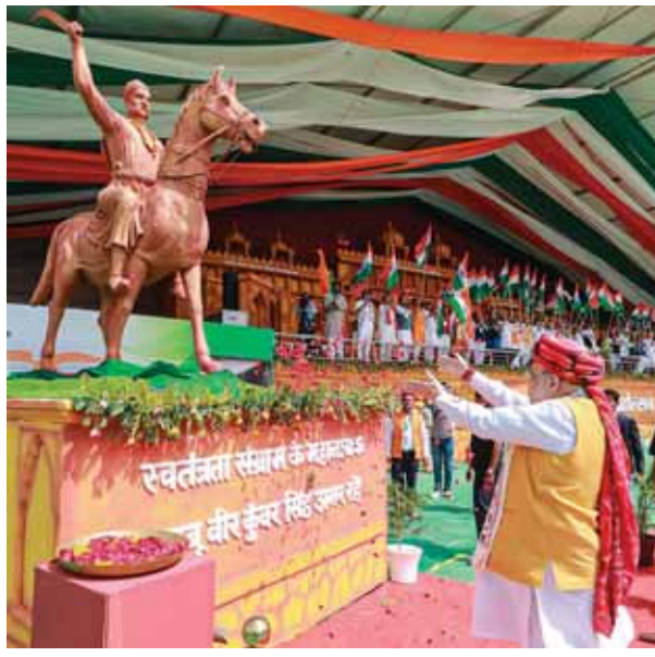
Union Home Minister Amit Shah pays tribute to Veer Kunwar Singh during Veer Kunwar Singh Vijayotsav at Jagdishpur, in Bhojpur district on Saturday (photo). Shah was a proud witness to 77,700 people simultaneously waving the Indian national flag at Jagdishpur in Bihar, where the BJP sought to make history by breaking Pakistan's record set 18 years ago. Veer Kunwar Singh, the then king of Jagdishpur who is regarded as one of the heroes of the Revolt of 1857. The event was organised as part of 'Azadi Ka Amrit Mahotsav' (See Page 2)