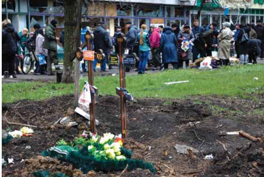
Local residents gather at a makeshift street market next to fresh graves in the foreground in an area controlled by Russian-backed separatist forces in Mariupol, Ukraine on Friday

"Many of the journalists and news anchors of these channels made fabricated and hyperbolic statements intending to incite the audiences," the