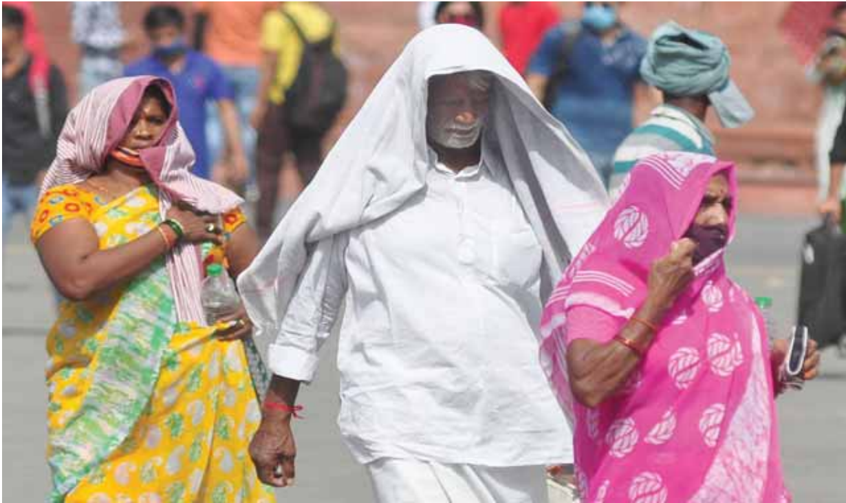
THE HEAT IS ON: People shield themselves from the hot summer sun in New Delhi on Thursday