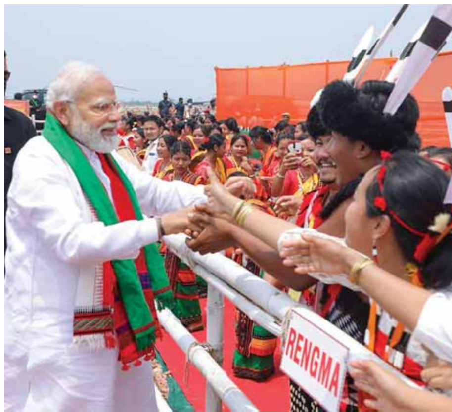
Prime Minister Narendra Modi being greeted by people as he arrives to address the 'unity, peace and development rally' at Loringthepe in Karbi Anglong district on Thursday (Photo). Addressing a rally at Dibrugarh in Assam after inaugurating seven cancer care centres and laying the foundation stone for seven others across the State, Modi said the Government is committed to strengthen the health infrastructure to provide the best and the cheapest treatment to the ailing people, particularly those suffering from cancer (See P5)