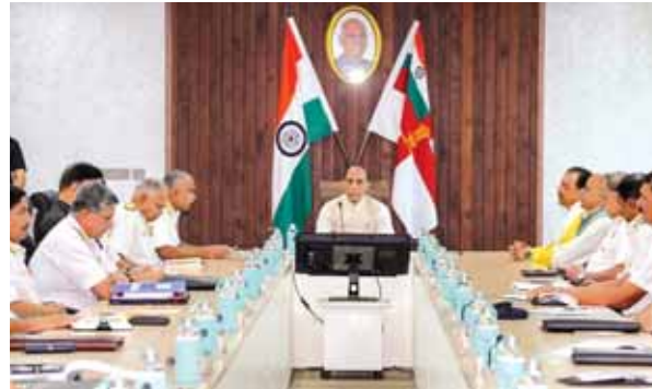
Union Defence Minister Rajnath Singh addresses the Naval Commanders Conference 2022 in New Delhi on Thursday

Addressing the Navy Commanders' conference here, Rajnath said coming to the prevailing security environment in the world, the ongoing Russia and Ukraine conflict has once again highlighted that being self-reliant without dependen-