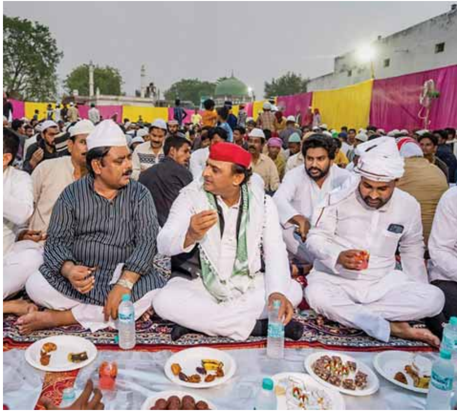
Samajwadi Party president Akhilesh Yadav during an iftar party for party workers in Lucknow on Thursday

ished. While chasing a chimera, I lost almost everything that I had built over the years. Job. Friends. Reputation. Public goodwill. But I never lost hope. My idealism had let me down". In another tweet he wrote, "But I had faith in myself. That I would undo the mistakes I had made. That life would give me another chance. A part of me is exhausted with the memory of those 8 months and wants to erase that legacy. Much of it is already gone. Time will mop off the rest I believe". "Just thought of sharing that life is beautiful. It is always worth giving ourselves another chance. Setbacks make us stronger. And there is an amazing world beyond the shadows of the past. I turn 39 next month. And I'm really excited to start all over again".