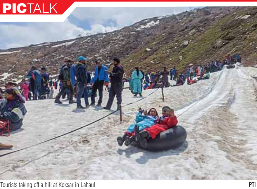
Tourists taking off a hill at Koksar in Lahaul

the West. To date, Ukraine has received military supplies worth $3 billion. President Joe Biden wants to see a "weakened" Russia. At what cost and when? What if Ukraine does not exist in its current form by then? There is no question of armed intervention by the West, in the form of a Nato strike, as that has the potential to spark a world war. But there is the question of the West asking Russia for a ceasefire as a prelude to talks. The West is not interesting in talking to Putin at all. Recall that they tried the dialogue route successfully in Serbia in the 1990s. Getting Putin to the talking table is the only option. And that means Ukraine getting ready to talk on all issues, whether it is about Luhansk and Donetsk regions or Russia's fears over Nato. Putin is so far adamant about war. What about the West? Would it prefer to depend only on its sanctions and a regular supply of arms to Ukraine to try to undercut the Russian military someday?