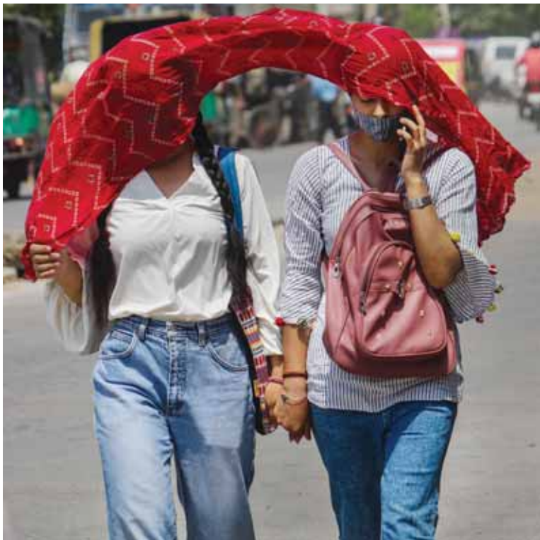
Girls shield their faces from the heat with scarves in Gurugram on Thursday

"Rise by about 2 degrees Celsius in maximum temperatures very likely over most parts of northwest, north, central and east India during next