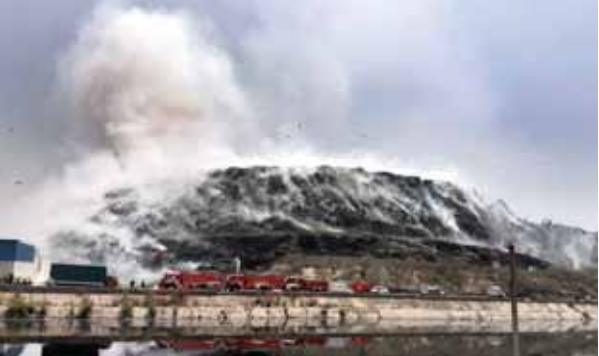
Fire tenders at the site of the blaze that broke out at Bhalswa landfill, in New Delhi on Thursday

"There is an entire residential colony in close proximity of this landfill, including a school, but no measures are being taken to tackle problem and entire area is now engulfed in smoke as a result of blazing fire which has been burning for past three days now. But not a single BJP leader or councilor has visited area," he said.