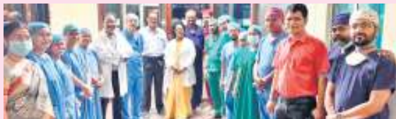
Team of doctors at Gandhi Hospital who performed the knee surgeries