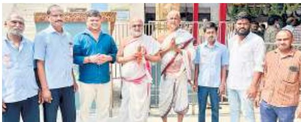
Chilkur Balaji temple chief priest and others