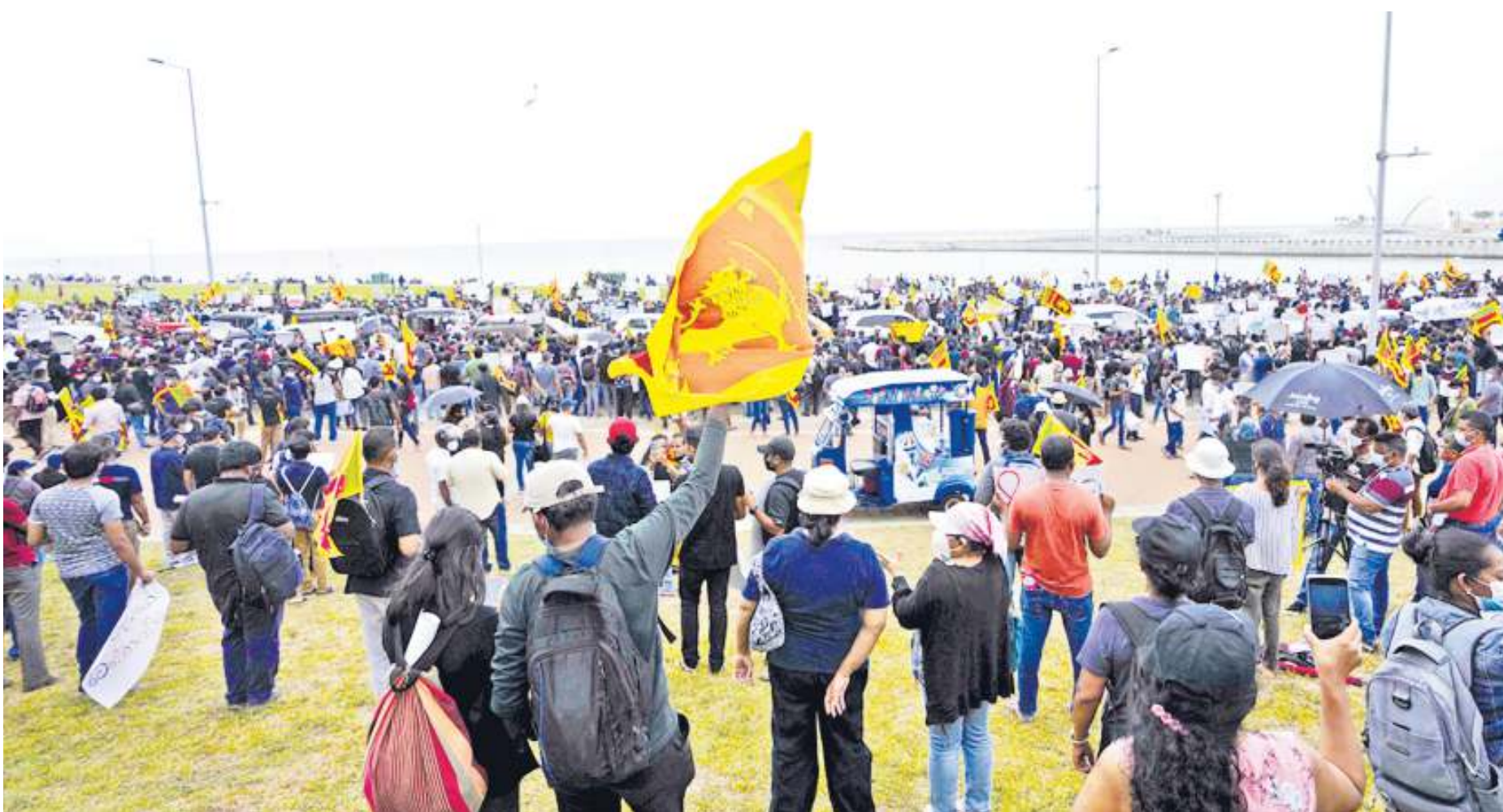
Sri Lankans protest demanding President Gotabaya Rajapaksa and his Government to resign, near presidential secretariat in Colombo on April 9

The roots of Rajapaksa lie in the politics of pre-independent Sri Lanka, when it was a British colony. The current Rajapaksa are third generation of the family in the politics of the island. Even before its independence in 1948, the Rajapaksa clan had started its foray into politics and administration of the country. Today, even the fourth-generation family politicians such as Namal and Shashindra have consolidated their position in the ruling clan. People are voting them to power successively despite having setbacks in the past. Frankly speaking, the Rajapaksa clan, mainly hailing