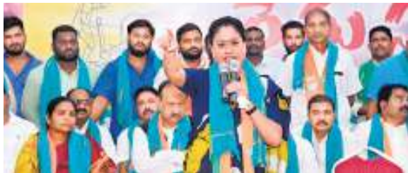
Vijay Shanti speaking at Kisan Morcha convention at Yedapalli in Nizamabad district on Saturday

Chief Minister K Chandrashekhar Rao has been apprehensive of BJP storming the TRS citadel in Telangana. That is why the KCR has been accusing the BJP leveraging the farmers' issue, alleges BJP national executive member Vijayashanti. Taking part in Kisan Morcha held at Yedapalli in Nizamabad district on Saturday, she recalled how KCR had written to the Centre refusing to give parboiled rice to the Centre for procurement. She sought to know why controversy over procurement of Yasangi paddy has been kicked up now when there was no problem on the issue since 2014. KCR raked up the issue since he felt that he is on a shaky wicket, she alleged. That is why he is politicising on farmers' laws and is hatching a conspiracy in this regard in