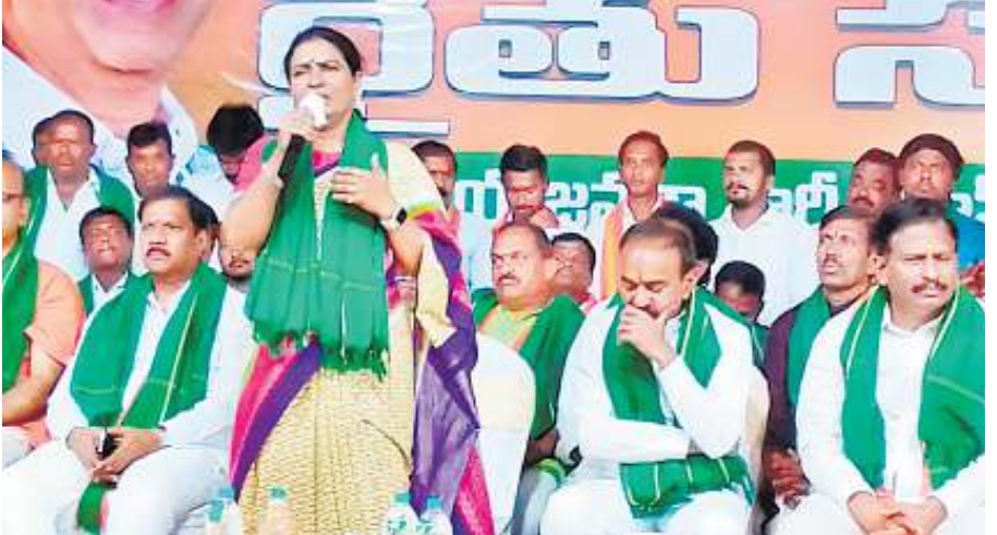
BJP national vice-president D K Aruna speaking at Kisan Morcha convention in Mahabubnagar on Saturday