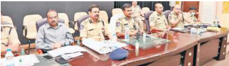
Hyderabad CP CV Anand addressing an official meeting in city on Saturday

Addressing the meeting, CV Anand said, "CCTVs and drones have to be used. Day and night area domination activities have to be conducted. Additional platoons of police