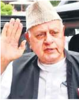
IMAGE POSTED BY AR RAHMAN TRIGGERS DEBATE

Meanwhile, the NC president and vice president Omar Abdullah extended warm greetings to people on the occasion of Ram Navami.