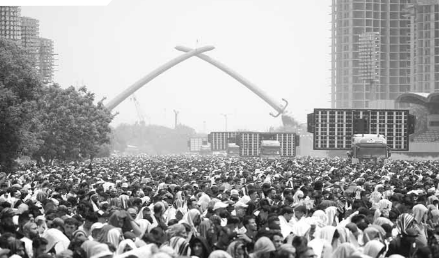
Followers of Shiite cleric Muqtada al-Sadr attend open-air Friday prayers at Grand Festivities Square, in Baghdad, Iraq