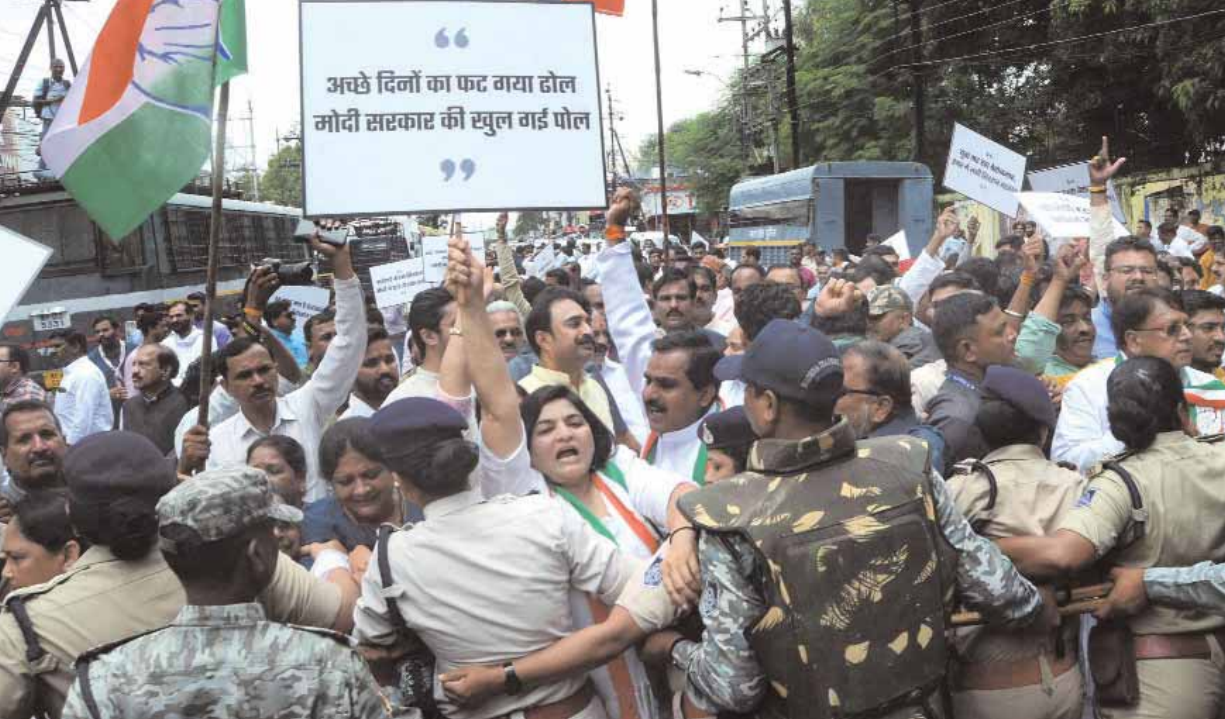
Congress party activists stage a protest during their nationwide agitation against price rise, unemployment and imposition of Goods and Services Tax on food items, at Raj Bhawan in Bhopal on Friday.