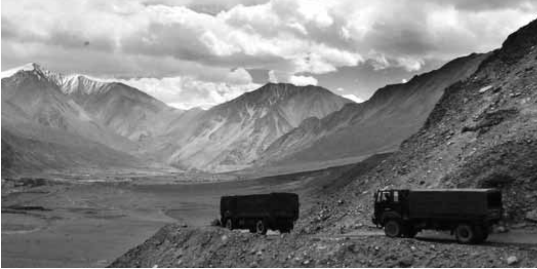
The Indian team comprising Army and IAF officers expressed concern over recent flying activities by Chinese air force near the LAC on its side in late June and early July, sources said here on Friday, adding the parleys took place on Tuesday

As per existing agreements between India and China, operation of fighter aircraft and armed heli-