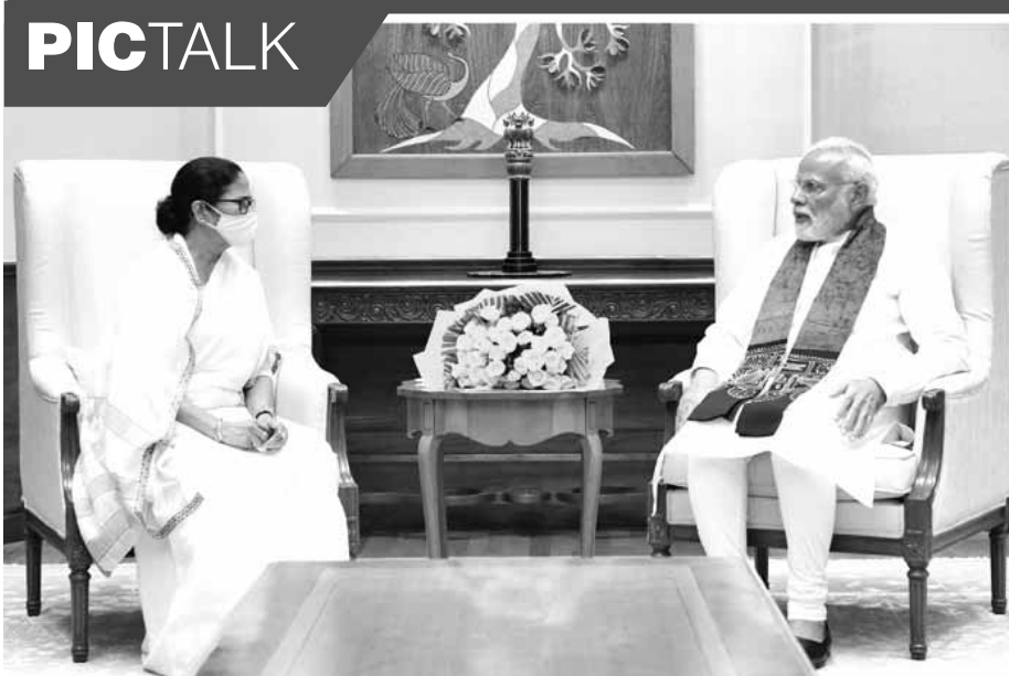
Prime Minister Narendra Modi with West Bengal CM Mamata Banerjee during a meeting in New Delhi on Friday

The chief minister said that Uttar Pradesh had benefited immensely from 'UDAN' scheme launched by Prime Minister Narendra Modi. "The rapid expansion in air connectivity is a testament to Prime Minister Modi's commitment where he said that even those who wear slippers should be able to travel in flights," he said.