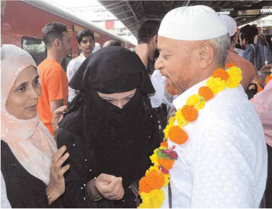
Muslim devotees being welcomed by their family members and relatives after their return from the annual pilgrimage from Mecca shrine, at railway station in Bhopal on Friday.

However, the swearing-in ceremony became a subject of controversy after there were allegations that instead of the women, their husbands had presented themselves at the time of the oath-taking. The elected sarpanch and other women were to be administered the oath of office and secrecy, for which a program was organized in the village Panchayat.