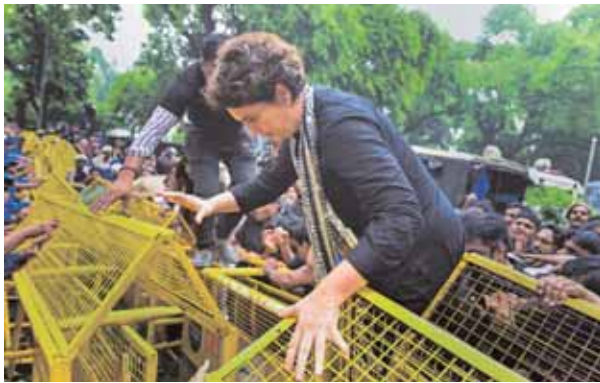
Congress leader Priyanka Gandhi during a protest in New Delhi on Friday

Asked about the questioning by the Enforcement Directorate of Congress president Sonia and him in the National Herald case, Rahul said, "Question all you want, there is absolutely nothing there, everybody knows it. We are not going to be intimidated by such tactics."