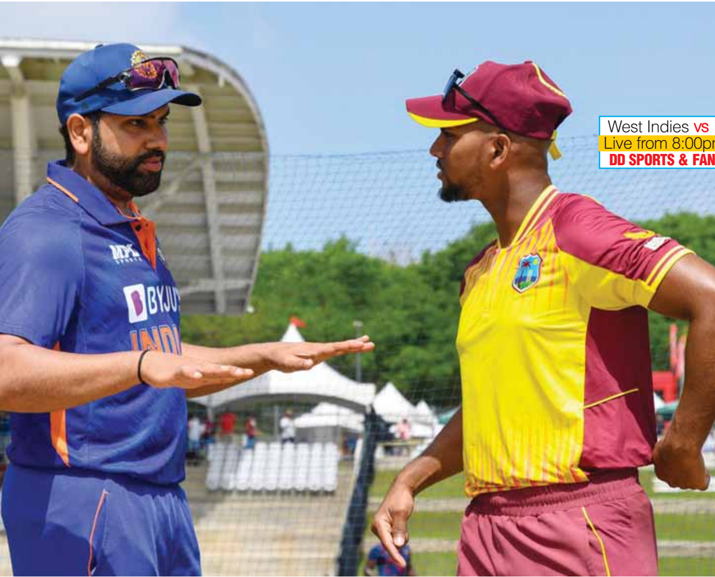
West Indies vs India Live from 8:00pm IST DD SPORTS & FANCODE

If Iyer gets a go in the last two games, he has no option but to put his best foot forward as the Asia Cup team, in all probability, will also be the likely team for the T20 World Cup.