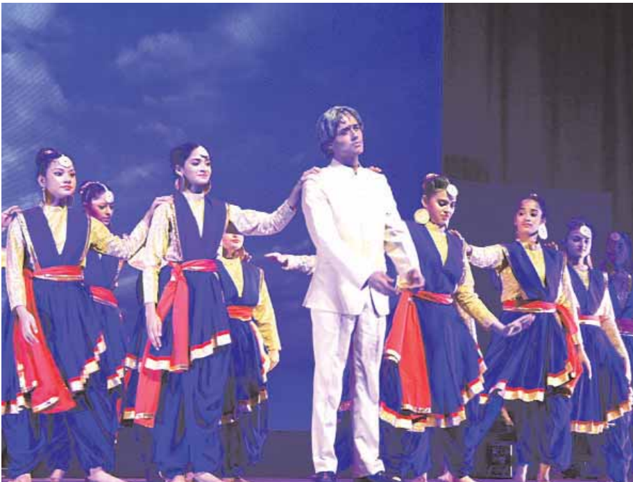
Artists perform during a musical play "Parvaaz Ka Aagaz" based on the life of former President Dr. APJ Abdul Kalam, presented by Dainik Bhaskar and Sanskar Valley School at Ravindra Bhawan in Bhopal on Friday.