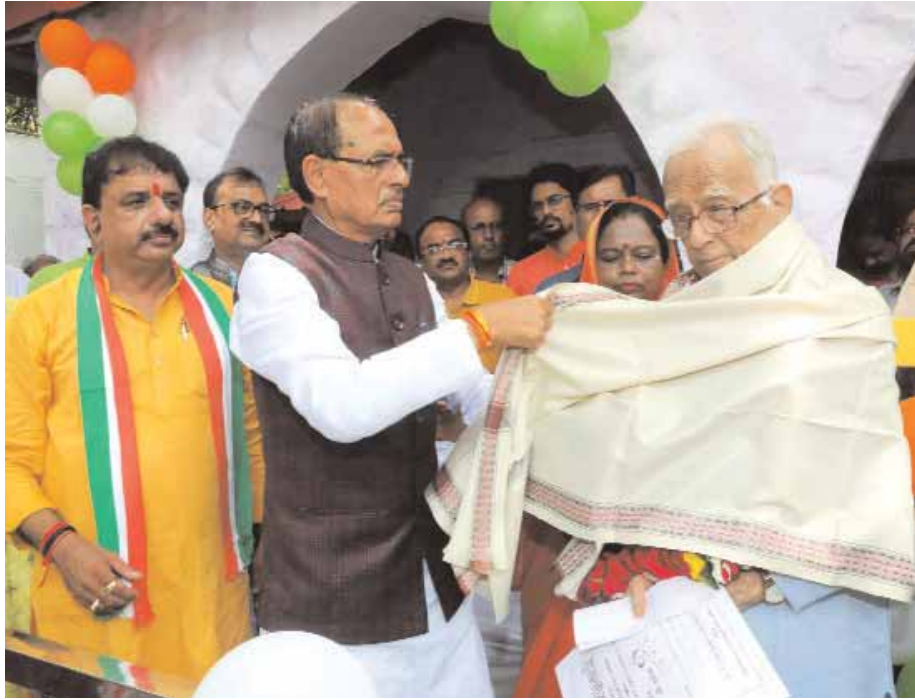
Madhya Pradesh Chief Minister Shivraj Singh Chouhan felicitates family members of the freedom fighters who participated in the merger movement of Bhopal after hoisting a Tricolour at Post Office, Jumerati, in Bhopal on Saturday.