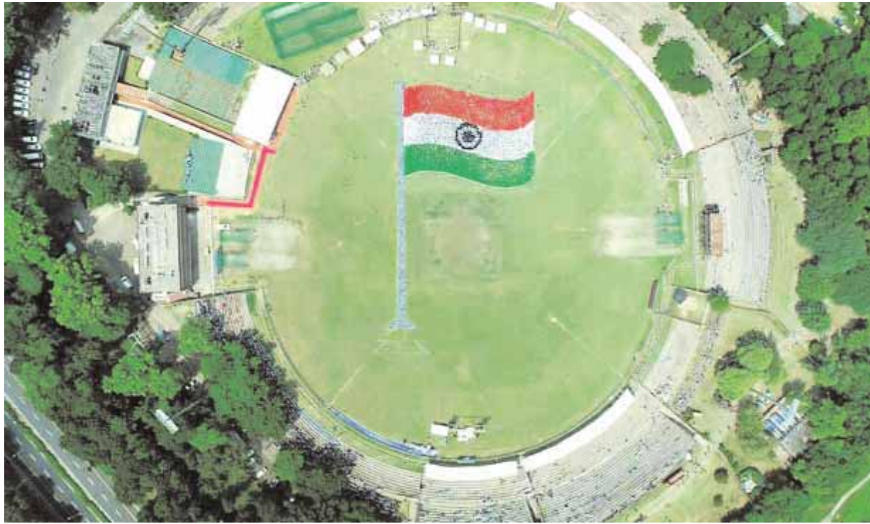
Students form a human chain to resemble a hoisted Indian national flag as they celebrate 'Azadi Ka Amrit Mahotsav' celebrations to commemorate 75 years of Indian Independence, in Chandigarh on Saturday. They created a Guinness World Record for their formation of 'World's Largest Human Image of a Waving National Flag'