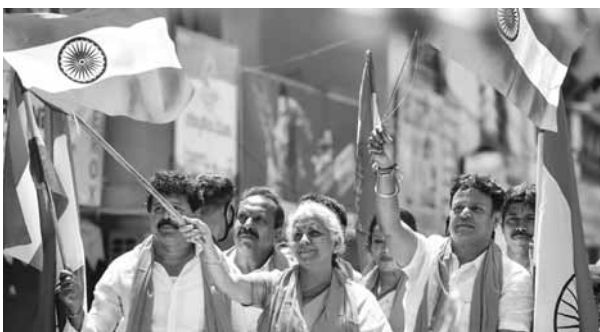
Union Finance Minister Nirmala Sitharaman participates in a 'Tiranga Yatra' as part of 'Azadi ke Amrit Mahotsav' celebrations for 75 years of Independence, in Bengaluru, on Saturday