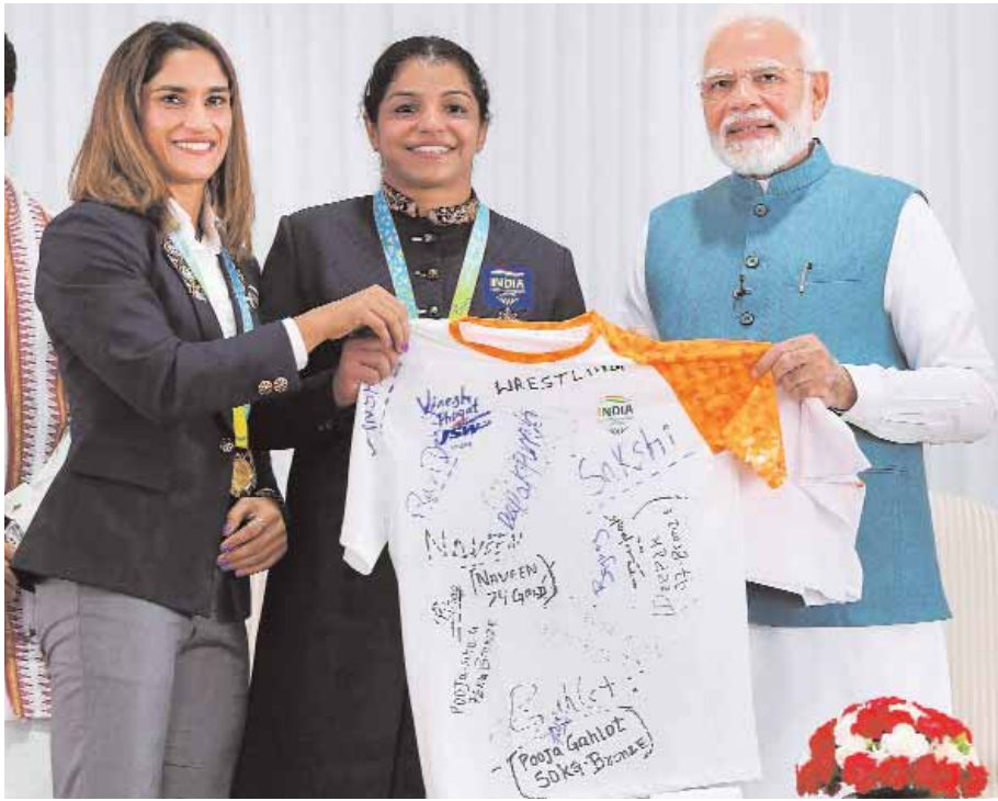
Prime Minister Narendra Modi with wrestlers Sakshi Malik and Vinesh Phogat during the felicitation ceremony of the Indian contingent for the Commonwealth Games 2022, in New Delhi on Saturday

The Prime Minister said the athletes inspire the youth of the country to do better not only in sports but also in other sectors. "You weave the country in unity of thought and goal that was also one of the great strengths of our freedom struggle."