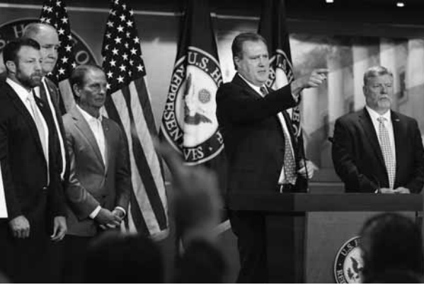
AP ■ WASHINGTON

Republicans in Congress who are relying on Donald Trump to excite voters in the fall elections are not only defending the former president against the FBI search of his Mar-a-Lago home but politically capitalising on it with grave and potentially dangerous rhetoric against the nation's justice system.