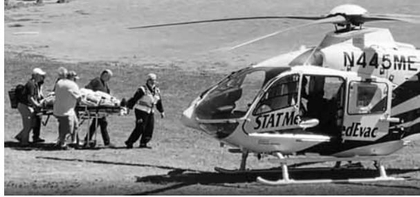
TEHRAN