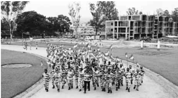
ITBP hoists national flag at high altitude borders as part of 'Har Ghar Tiranga' campaign