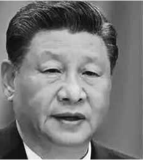
PTI ■ WASHINGTON

China's actions to "intimidate and coerce" Taiwan following US House Speaker Nancy Pelosi's visit to Taipei are fundamentally at odds with the goal of peace and stability, the White House has said, asserting that the US would take "calm and resolute" steps to support the self-ruled island. China's ruling Communist party has long claimed sovereignty over Taiwan. Beijing insists its "one-China principle" would bar most incumbent foreign government officials from setting foot on the island. The People's Liberation Army announced war games in