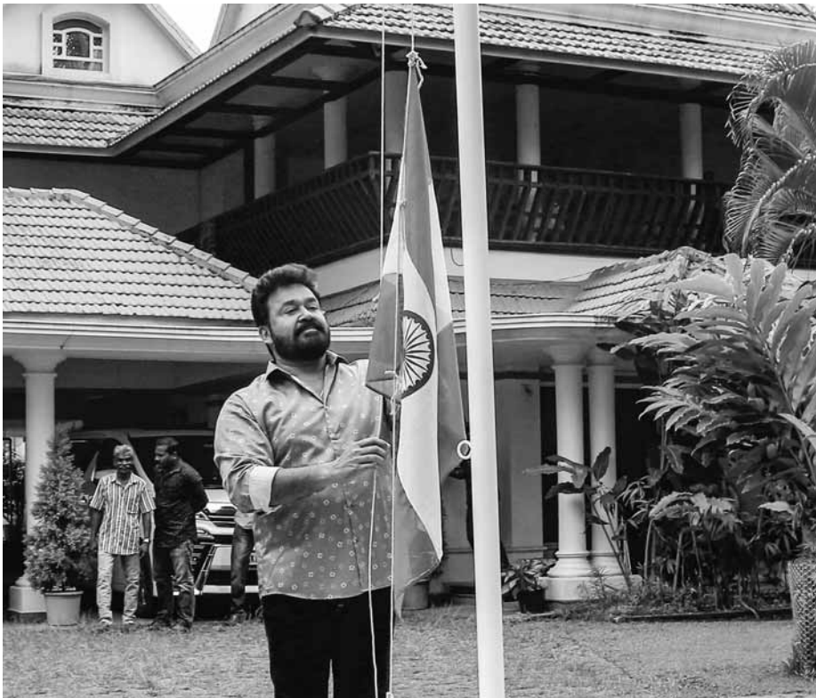
Film actor Mohanlal hoists the national flag at his residence on the occasion of 'Har Ghar Tiranga' campaign, in Kochi on Saturday