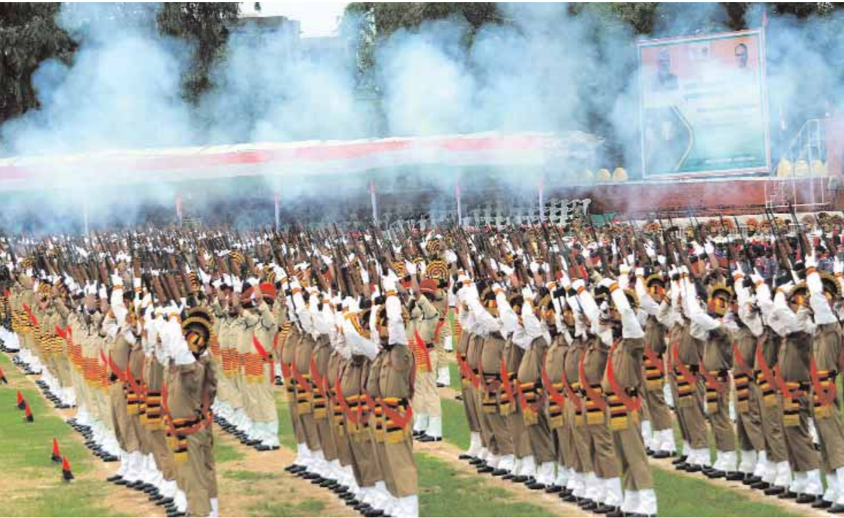
MP police contingents during full dress rehearsal ahead of the Independence day at Motilal Nehru Police Stadium in Bhopal on Saturday.

Sensing danger and to safeguard loss of lives and property the administration has evacuated 18 villages around the dam. These include 12 villages of Dhar district and 6 villages of Khargone. About 40 thousand people have been affected by this. Narmada, Shipra, Betwa, Tapti have reached the danger mark. According to the Meteorological Department, a new low pressure area is forming in the Bay of Bengal from August 13. Due to this, there may be heavy rain in the state and apart from this, from Sunday good rainfall would be witnessed in Bhopal, Raisen, Rajgarh, Vidisha, Sehore, Shivpuri, Datia, Umaria, Anuppur, Katni, Dindori, Balaghat, Rewa, Satna, Sidhi, Singaurli, Chhatarpur, Sagar, Tikamgarh, Panna, Damoh and Niwari.