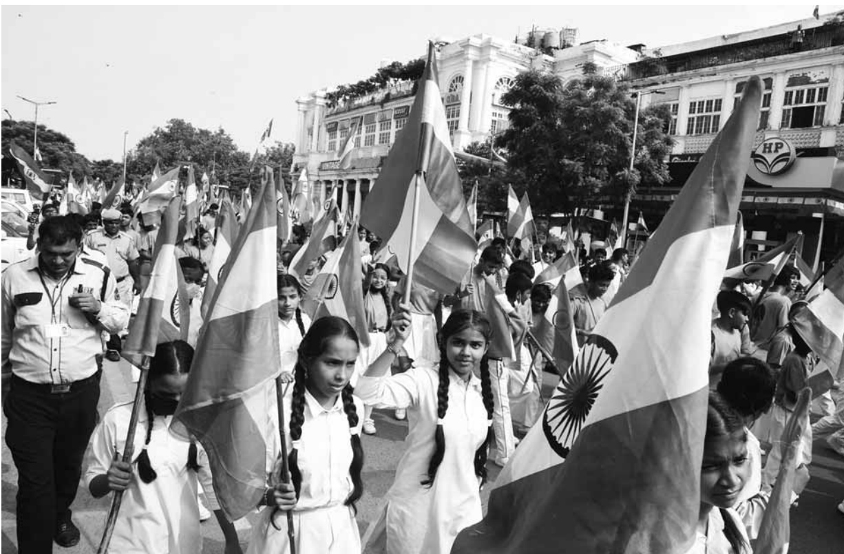
Schoolchildren participate in a Har Ghar Tiranga campaign under Azadi Ka Amrit Mahotsav in New Delhi on Sunday

"We have already sanctioned Rs 99 crore to Chennai (Port Trust) for the fishing harbour", he said.