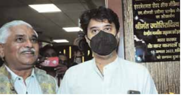
GWALIOR