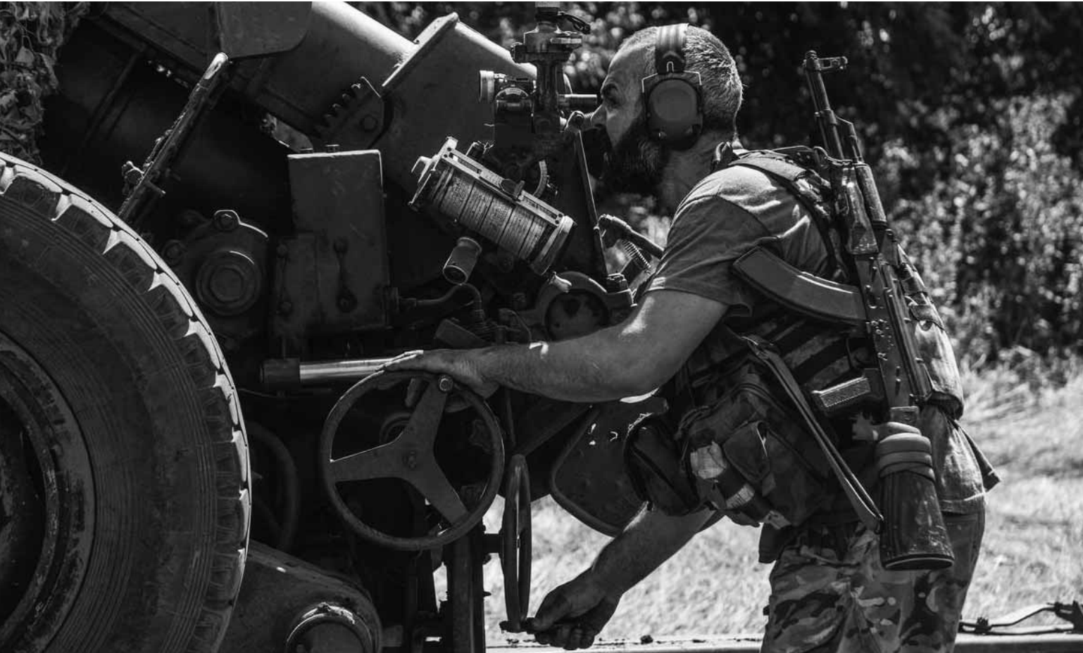
AP ■ KYIV

Russian forces on Sunday fired rockets on the Mykolaiv region in southern Ukraine, killing at least one person, and a Russian diplomat called on Ukraine to offer security assurances so that international inspectors could visit a nuclear power station that has come under fire.