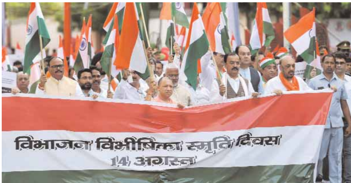
Uttar Pradesh Chief Minister Yogi Adityanath participates in a silent procession on Partition Day, on the eve of Independence Day in Lucknow on Sunday

Last year, Modi declared that August 14 would be remembered as 'Partition Horrors Remembrance Day' every year to remind the nation of the sufferings and sacrifices