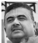
BJP leader W Bengal —Suwendu Adhikari

I’m not standing in Islamabad. We don’t need to take any permission for the Tiranga yatra. there’s no need to be scared.