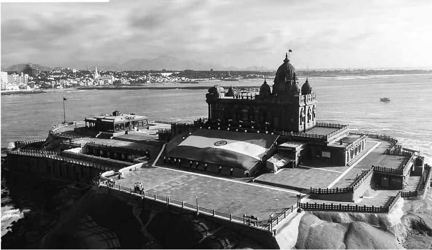
A 75-ft National Flag being unfurled at the southern tip of India, ahead of Independence Day, in Kanyakumari