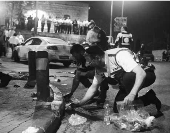
AP ■ JERUSALEM

A gunman opened fire at a bus near Jerusalem's Old City early Sunday, wounding eight Israelis in a suspected Palestinian attack that came a week after violence flared up between Israel and militants in Gaza, police and medics said. Two of the victims were in serious condition, including a pregnant woman with abdominal injuries and a man with gunshot wounds to the head and neck, according to Israeli hospitals treating them. The shooting happened as the bus waited in a parking lot near the Western Wall, the holiest site where Jews can pray. Israeli police said forces were dispatched to the scene to investigate. Israeli security forces also pushed into the nearby Palestinian neighbourhood of Silvan pursuing the suspected attacker. Later on Sunday, police said the suspected attacker turned himself in. Police did not immediately disclose details about the suspected attacker's identity. The attack in Jerusalem followed a tense week between