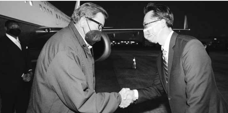
AP ■ TAIPEI

A delegation of American lawmakers is visiting Taiwan just 12 days after a visit by US House Speaker Nancy Pelosi that angered China. The five-member delegation, led by Democratic Sen. Ed Markey of Massachusetts, will meet senior leaders to discuss US-Taiwan relations, regional security, trade, investment and other issues, the American Institute in Taiwan said. The institute represents the U.S. Government, which does not have official ties with Taiwan. China, which claims self-ruled Taiwan as its territory, responded to Pelosi's Aug. 2 visit by sending missiles, war-