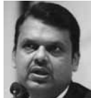
Maharashtra Deputy CM —Devendra Fadnis

You keep yourself busy in kite-flying, we will allocate the portfolios and it will be done soon.