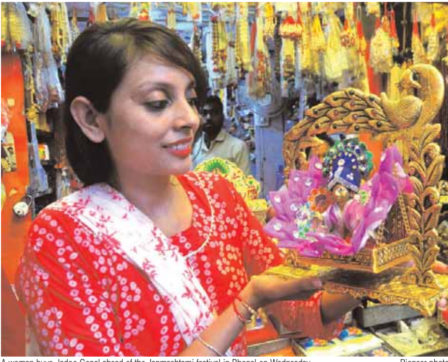
A woman buys ladoo Gopal ahead of the Janmashtami festival in Bhopal on Wednesday.