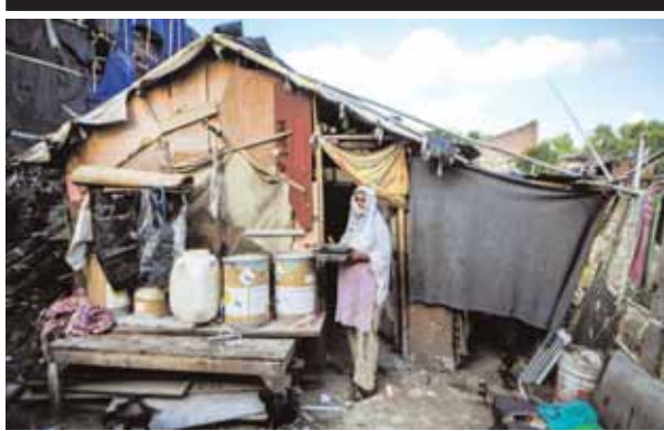
37-year-old woman poses for photographs at the Rohingya refugee settlement area in Kalindi Kunj in New Delhi on Wednesday

○ UNHCR's Report acknowledged that more than 18,000 Rohingyas have taken shelter in India, seeking refugee status