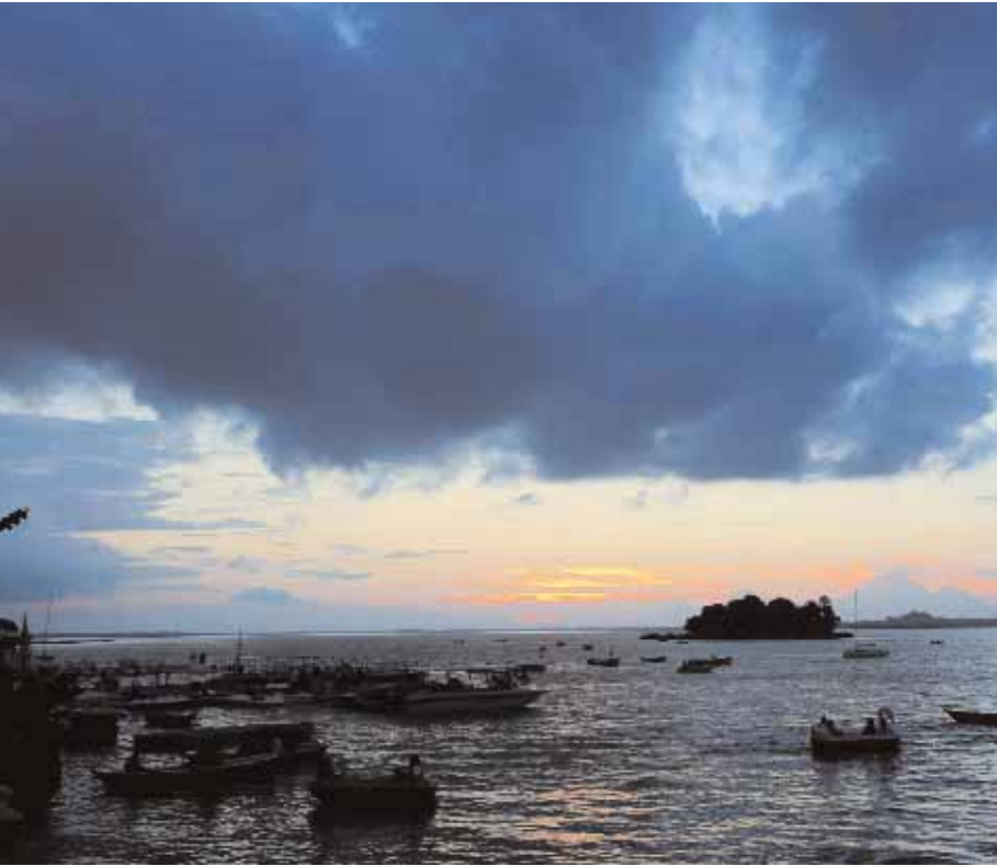
Monsoon clouds hover over the Upper Lake in Bhopal on Wednesday.