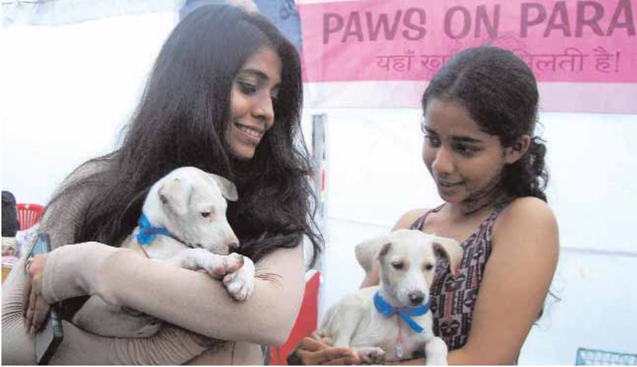
Young women hold pet dogs during a Pet Adoption Camp organised by an NGO Paws on Parade at new market in Bhopal on Wednesday.