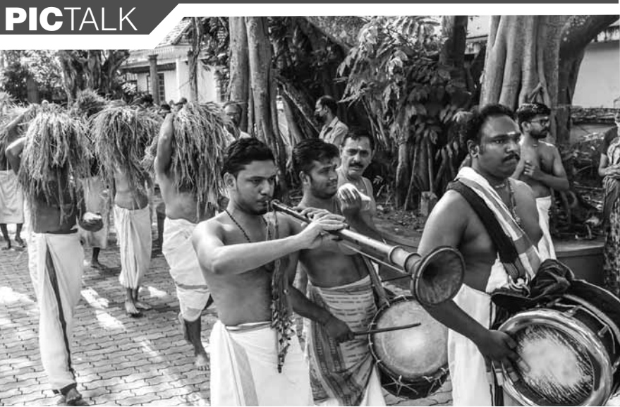
Priests participate in a traditional procession on the occasion of Chingam 1 or Malayalam New Year, in Kochi