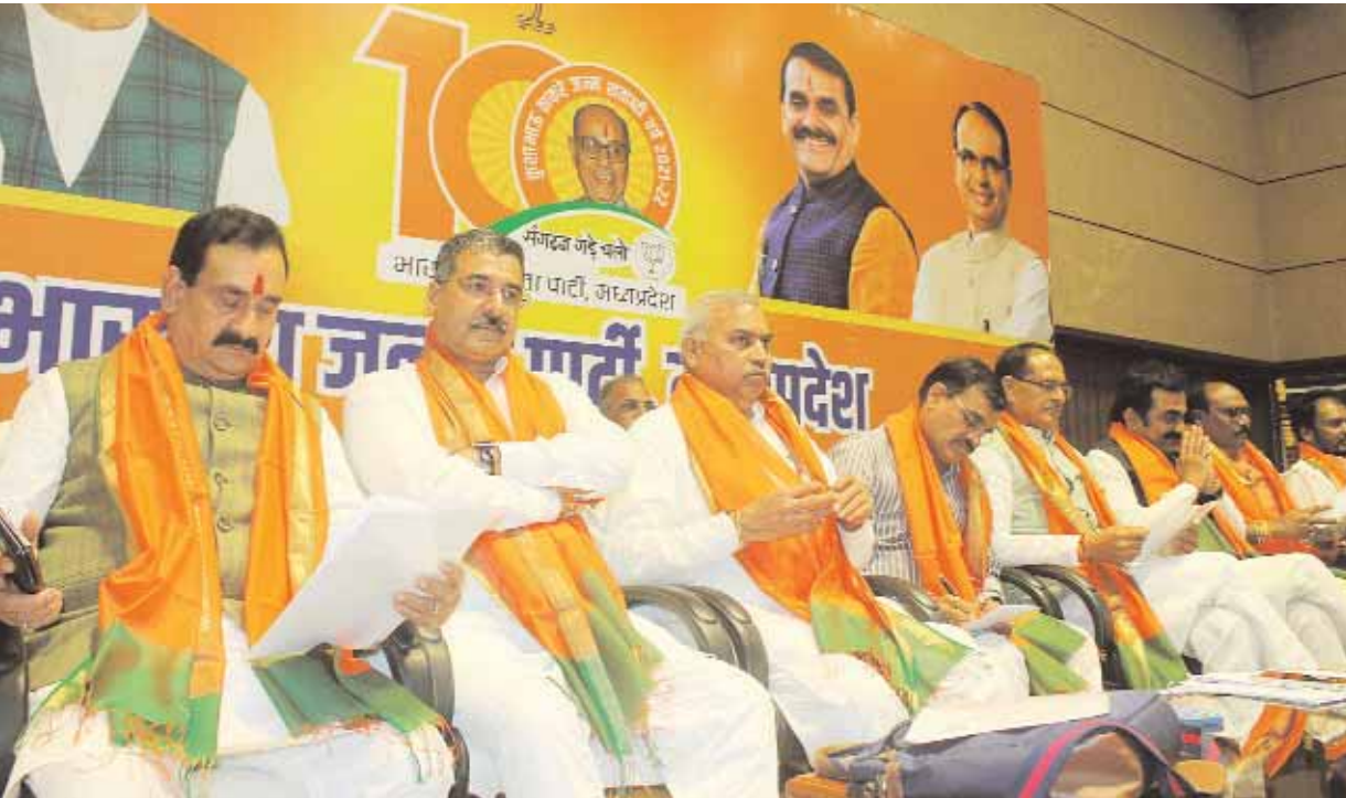
Madhya Pradesh Chief Minister Shivraj Singh Chouhan along with BJP State President VD Sharma and other leaders during a party meeting at BJP State headquarters in Bhopal on Wednesday.

ed to East Rajasthan and adjoining East Madhya Pradesh area, because there is a lot of moisture in the atmosphere. Narmada, Chambal, Betwa, Tapti, Shipra are swollen. The gates of many dams have to be opened. The Meteorological department has issued a flood alert in Guna, Rajgarh, Agar Malwa, Ratlam, Neemuch and Mandasaur districts. In Narmadapuram, the Narmada is flowing just one and a half feet below the danger mark of 968 meters. Due to the strong current in Narmada, water is being released by opening 13 gates of Bargi dam in Jabalpur and 5 of Tawa dam in Narmadapuram. In Vidisha more than 1400 people were rescued, 19 villages affected by Betwa in Vidisha.