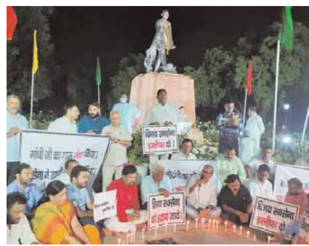
AAP MLAs stage overnight protest demanding resignation of Delhi Lieutenant Governor. (R) BJP MLAs sit on protest over not being heard in Delhi Assembly, at night on Monday