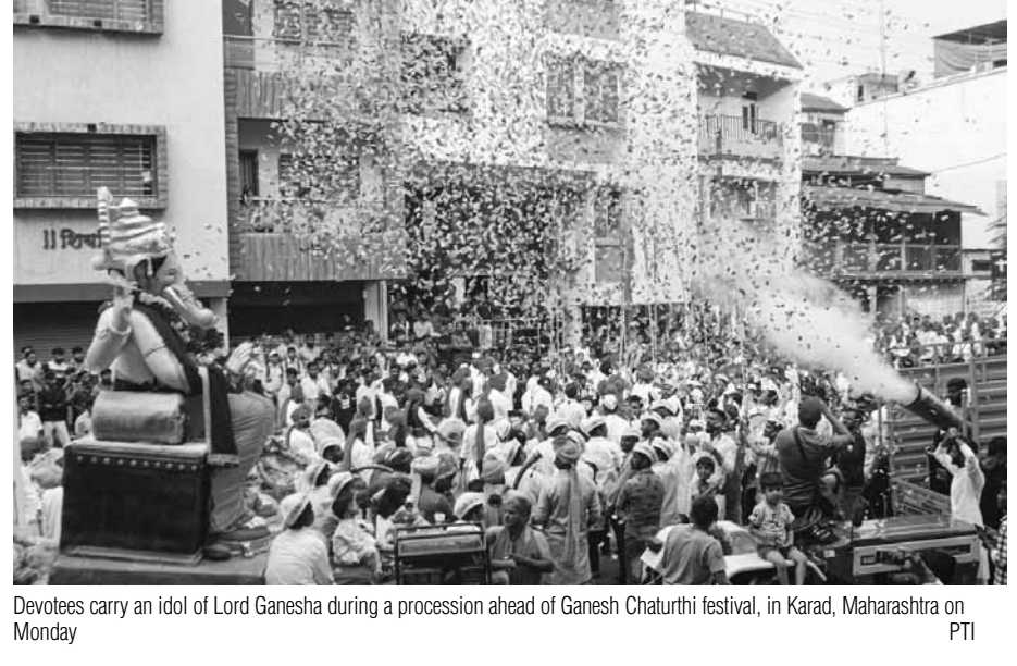
Devotees carry an idol of Lord Ganesha during a procession ahead of Ganesh Chaturthi festival, in Karad, Maharashtra on Monday

chief said there were several faces in the opposition for the post of prime minister but the BJP had only one. He also criticised the Union government for the rising prices of commodities and unemployment. "It is unfortunate that the dreams of the youth are being shattered through schemes like Agneepath military recruitment scheme," Yadav alleged. Without naming the Bahujan Samaj Party, Akhilesh Yadav said, "The Samajwadi Party will go to the people and apprise them about the real character of certain political parties who contest election only for the division of votes for the benefit of the BJP."