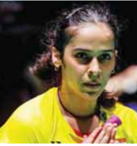
Federation said. The Race to Paris rankings on April 30, 2024, will be used to determine the initial list of Olympic qualifiers. Most international sport in

AP ■ KUALA LUMPUR Qualifying for the Paris 2024 Olympics will start in May next year in China, badminton officials said on Monday as they unveiled a beefed-up calendar for the sport's re-emergence after Covid. The 2023 season will start at the Malaysia Open in Kuala Lumpur in January. The year-long "Race to Paris" Olympic qualification will begin on May 1 with the Sudirman Cup in Suzhou, China, from May 14-21 the first eligible ranking tournament, the Badminton World