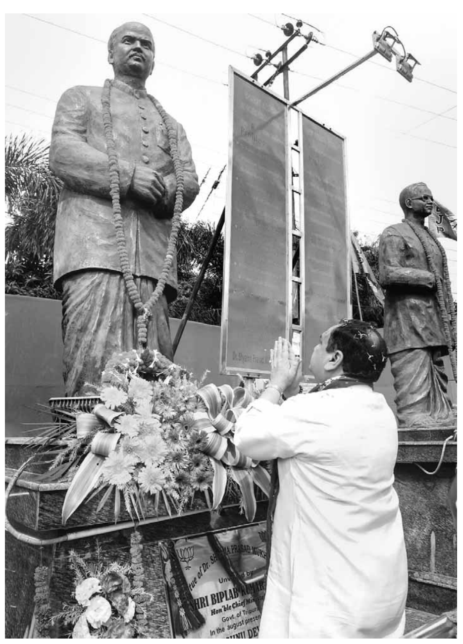
BJP national president JP Nadda pays homage to Dr Shyam Prasad Mukherjee, in Agartala on Monday.

New Delhi: The Supreme Court on Monday sought a response from the Centre and States on a plea seeking stricter punishment to control hoarding, adulteration and black marketing of items.