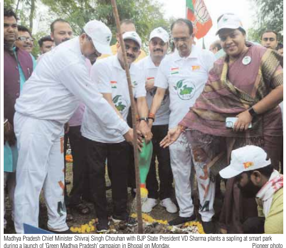
Madhya Pradesh Chief Minister Shivraj Singh Chouhan with BJP State President VD Sharma plants a sapling at smart park during a launch of 'Green Madhya Pradesh' campaign in Bhopal on Monday.