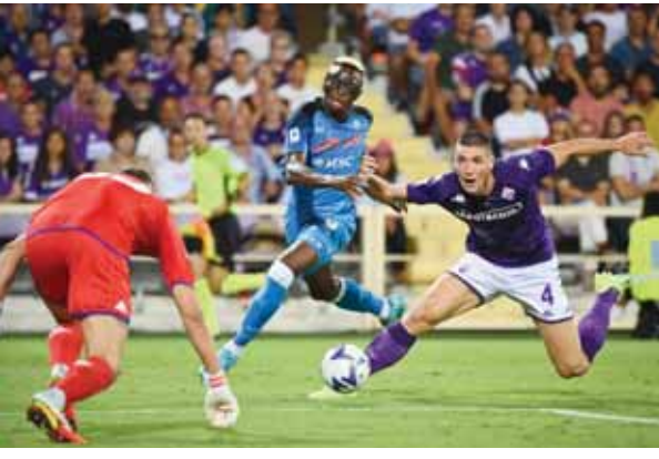
before the break as Napoli grew into the game. The away side should have been ahead not long after the restart. Amir Rrahmani headed Piotr Zielinski's cross narrowly over in the 48th minute. Then, just after the hour mark,

side to the win. The stalemate puts Napoli on seven points from their opening three matches, level with several teams, including champions AC Milan and Atalanta. Fiorentina, who are also unbeaten, sit ninth on five points. An intense contest in Florence began with the hosts on the front foot and they went closest to taking the lead midway through the first half when after Alex Meret spilled Riccardo Sottil's shot, Giacomo Bonaventura flashed a low drive just wide. Victor Osimhen had a tap-in ruled out for offside just