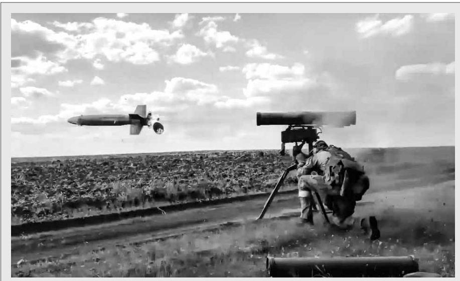
In this handout photo taken from video released by Russian Defense Ministry Press Service on Monday, a Russian soldier fires from a Kornet at an undisclosed location in Ukraine.