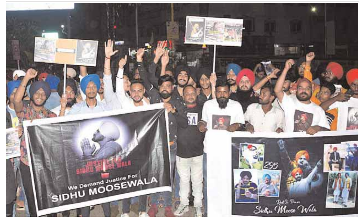
Members of the Sikh Community demonstrate demanding justice for noted singer Sidhu Moosewala in Bhopal on Monday.

INS Sumedha is the second Indian Naval Ship to visit Malaysia in the year 2022. It is part of a joint naval exercise 'Samudra Laxman'. The ship's visit to Port Klang is aimed at strengthening bilateral ties, enhancing maritime cooperation and interoperability between the Indian Navy and the Royal Malaysian Navy (RMN).