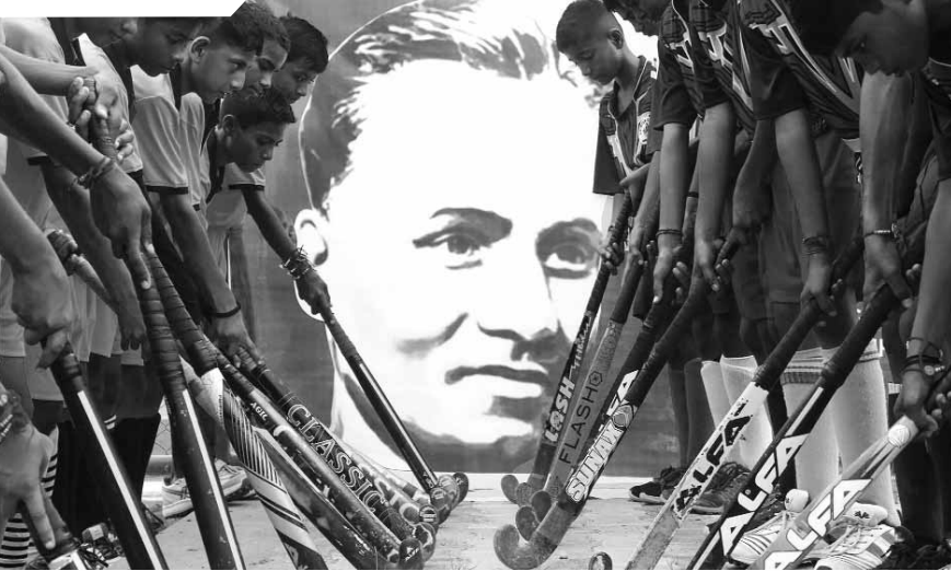
Hockey players pay tribute to Major Dhyan Chand on his 117th birth anniversary celebrated as national sports day