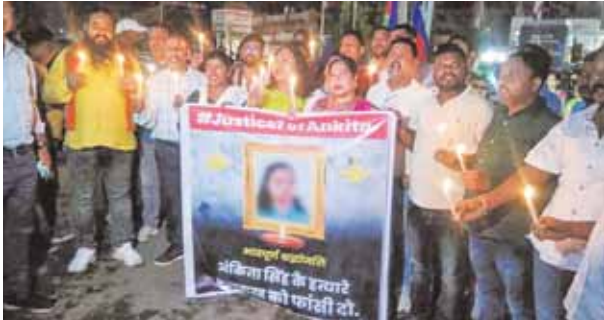
A candlelight march protest against the murder of a class-12 student, who was set on fire by a man in Jharkhand's Dumka district, in Ranchi, on Monday