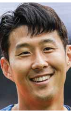
"I understood Sonny is a really sensible player. He's really sensible and a top man, a real-

AP ■ LONDON Tottenham Hotspur manager boss Antonio Conte has said he would be happy for Son Heung-min to marry his daughter as he defended the struggling South Korea forward. Son has failed to hit the heights he established last term as his goalless start to the season continued during Spurs' 2-0 win away to Nottingham Forest on Sunday. His form so far this term has been far removed from the run of 10 goals in the final nine games of last season that helped Son win the Premier League Golden Boot award. Nevertheless, Conte said: