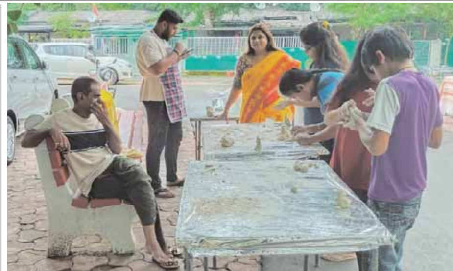
An idol making workshop, ahead of ganeshotsav, was organised by the Nalini Education and Social Welfare society, at Tulsi Nagar on Sunday.

These substations are also known colloquially as "maintenance free" substations due to presence of equipments contacts in gas insulated chambers.