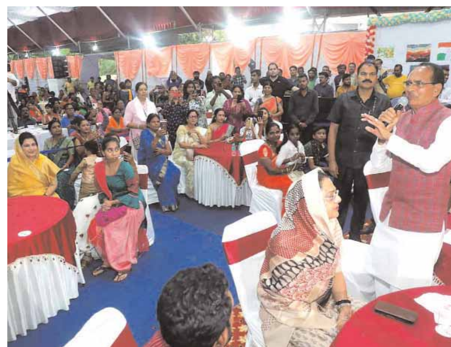
Madhya Pradesh Chief Minister Shivraj Singh Chouhan addresses during an interactive programme with the street vendors organised at his residence in Bhopal on Monday.

It was informed that 52 students of government schools of the state have been given admission by the Vellore Institute of Technology under the 'Sahyog Yojana for Rural Students' under STARS. 17 students from government schools participated in the prestigious Word Power Championship held in Mumbai and 688 students were selected in the Techbee programme of HCL Company. All these selected students will become employees of HCL Company after training