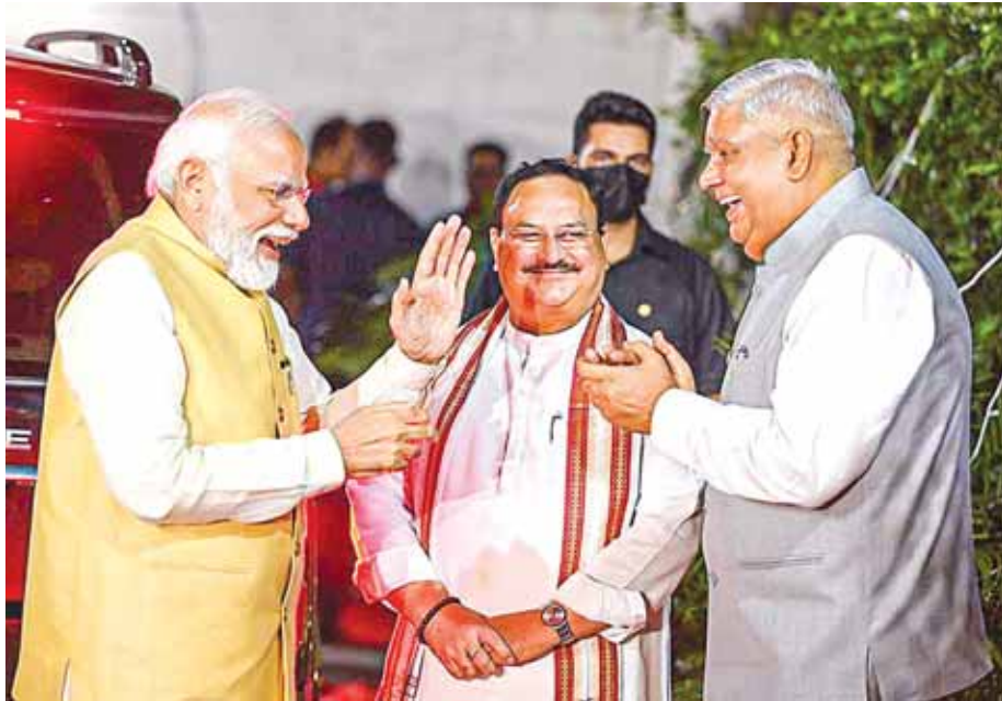
Prime Minister Narendra Modi and Vice-President designate Jagdeep Dhankar react during a meeting in New Delhi on Saturday. BJP national president JP Nadda is also seen

"Out of the 780 electors comprising elected and nominated members of the Rajya