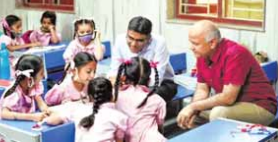
Delhi Government has started ‘Happiness Curriculum’ to teach students how to keep the stress and loneliness at bay

Various Governments across the world are gradually waking up to this silent killer. If the UK appointed a designated loneliness minister in 2018 to reach out to its older people, Japan last year took similar step after it felt that loneliness is afflicting across different age groups, including children, young people, women and older people. Rising cases of suicide was immediate trigger.