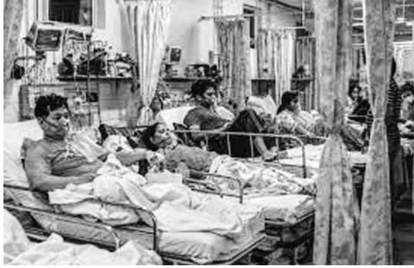
the community. India saw a single-day rise of 19,406 Covid-19 infections, taking the total tally of Covid-19 cases to 4,41,26,994. As per the latest data, the active cases declined to 1,34,793 today. The death toll climbed to 5,26,649 with 49 new fatalities.

Covid-appropriate behaviour in crowded places like markets, inter-state bus stands, schools, colleges, railway stations, etc," he said. "States should aim to increase the pace of vaccination for all eligible population and accelerate the administration of free precaution doses for 18-plus eligible population at all Government Covid Vaccination Centres (CVCs) under the 'COVID Vaccination Amrit Mahotsav' till September 30," he stated. States were advised to diligently follow the five-fold strategy of test-track-treat vaccination and adherence to Covid-appropriate behaviour within