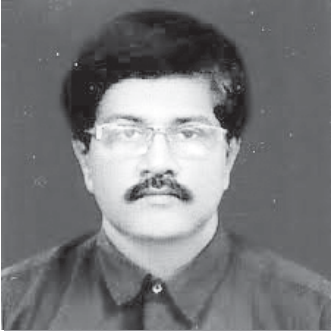
LALIT MOHAN MISHRA

Hoping to come to power in 2019 general election, the BJP had set an electoral mission of 120+ Assembly seats. But the BJP failed in the mission miserably and got only 23 Assembly seats and 32.49% vote share. However, the party's performance in the Lok Sabha election was good with 8 Lok Sabha seats and 38.4% vote share. The better performance of the BJP in