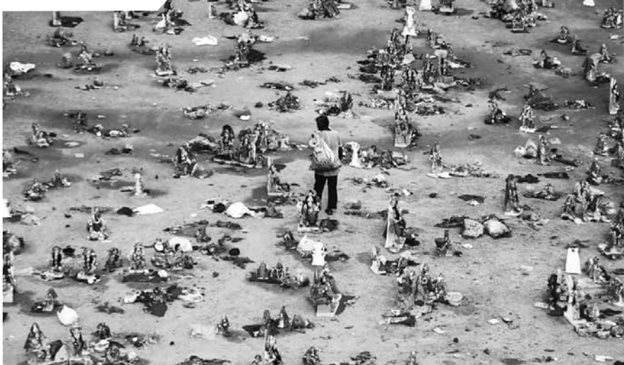
A ragpicker collects recyclable items from the offerings and idols of Goddess Dashama, left by devotees in Ahmedabad