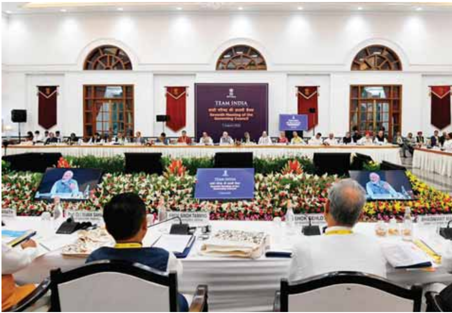
Prime Minister Narendra Modi and other Ministers and Chief Ministers of States/UTs at the 7th Governing Council meeting of Niti Aayog at Rashtrapati Bhavan Cultural Centre, in New Delhi on Sunday.

The meeting was attended by 23 Chief Ministers, three Lieutenant-Governors and two Administrators.