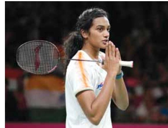
PTI ■ BIRMINGHAM

Double Olympic medallist P V Sindhu stayed on course for an elusive Gold medal while Lakshya Sen regained his rhythm just in time to enter his maiden final at the Commonwealth Games here on Sunday. Sindhu rode on her superior technical superiority to outwit Singapore's Yeo Jia Min 21-19, 21-17 in a 49-minute contest to reach her second successive final. The Indian had also beaten her in the team event. In the following match, world number 10 Sen lost his way after a dominating start against 87-ranked Jia Heng Teh of Singapore. Sen however recovered to complete a 21-10, 18-21, 21-16 win in the men's singles semifinals. Satwik Sairaj Rankireddy and Chirag Shetty ensured a third Gold medal match for India on Monday when they downed Malaysia's Chen Peng Soon and Tian Kian Men 21-6, 21-15 to reach the men's doubles final. The world number 7 duo was too