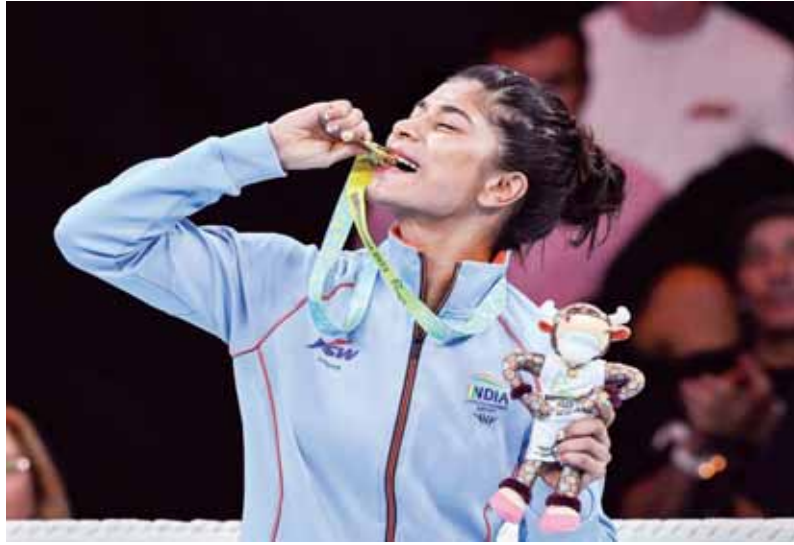
Boxer Nikhat Zareen with the gold medal after winning the final of 48kg-50kg (Light Flyweight) boxing match, at the Commonwealth Games 2022 in Birmingham, UK on Sunday.

The India pugilists will return with seven medals from Birmingham, two less than the previous edition.