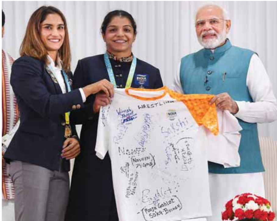
Prime Minister Narendra Modi with wrestlers Sakshi Malik and Vinesh Phogat during the felicitation ceremony of the Indian contingent for the Commonwealth Games 2022, in New Delhi on Saturday

The Prime Minister said the athletes inspire the youth of the country to do better not only in sports but also in other sectors. "You weave the country in unity of thought and goal that was also one of the great strengths of our freedom struggle."