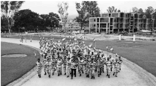
ITBP hoists national flag at high altitude borders as part of 'Har Ghar Tiranga' campaign