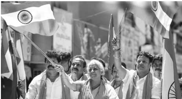
Union Finance Minister Nirmala Sitharaman participates in a 'Tiranga Yatra' as part of 'Azadi ke Amrit Mahotsav' celebrations for 75 years of Independence, in Bengaluru, on Saturday