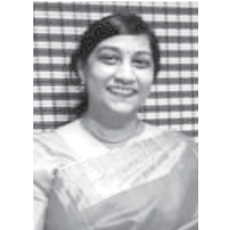
DR SWAYAM PRABHA SATPATHY

The experimental narrative structures in his novels are to explore the post-modern new humanism, which culminates in his novel "The Road". There are the three inexplicable narrative elements that stand apart as glaring example of his style, discernible in much-talked about novel, "The Road". These distinguishing features are the characters, the description of horror and novel's spatial setting. McCarthy employs post modern narrative technique to send a chill down our spine. In amplifying the imperative need of keeping the lurking danger at bay beneath the sustainable safety and