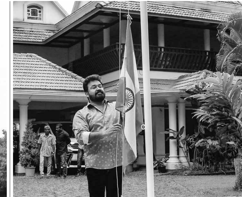
Film actor Mohanlal hoists the national flag at his residence on the occasion of 'Har Ghar Tiranga' campaign, in Kochi on Saturday