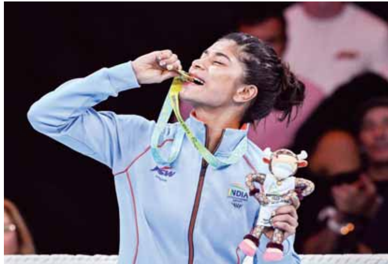
Boxer Nikhat Zareen with the gold medal after winning the final of 48kg-50kg (Light Flyweight) boxing match, at the Commonwealth Games 2022 in Birmingham, UK on Sunday.

The India pugilists will return with seven medals from Birmingham, two less than the previous edition.