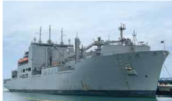
US Navy Ship (USNS) Charles Drew at L&T's Shipyard at Kattupalli for undertaking repairs and allied services, in Chennai.

Providing a huge boost to "Make in India" and "Aatmanirbharta in Defence" and adding a new dimension to the burgeoning Indo-US strategic partnership, US Navy Ship Charles Drew arrived at