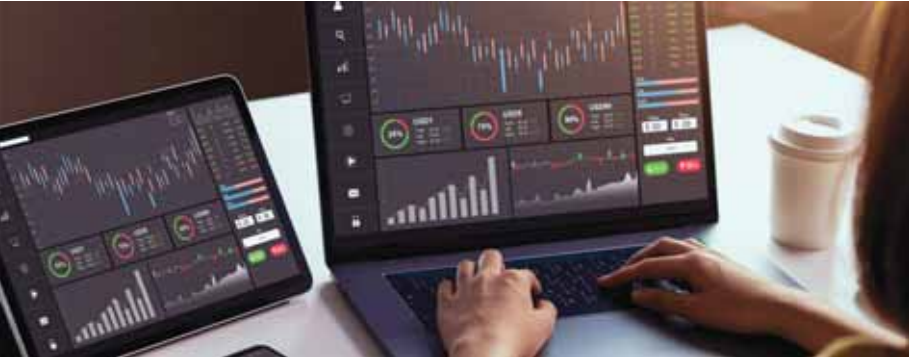
PTI ■ NEW DELHI

Eight of the 10 most valued firms together added Rs 98,234.82 crore in market valuation last week, with IT majors Infosys and TCS emerging as the biggest gainers amid a positive momentum in equities. Last week, the BSE benchmark Sensex advanced 817.68 points or 1.42 per cent. From the top-10 pack, HDFC twins were the only laggards. The market valuation of Infosys jumped Rs 28,170.02 crore to reach Rs 6,80,182.93 crore.