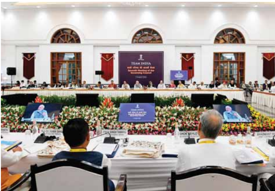
Prime Minister Narendra Modi and other Ministers and Chief Ministers of States/UTs at the 7th Governing Council meeting of Niti Aayog at Rashtrapati Bhavan Cultural Centre, in New Delhi on Sunday.

The meeting was attended by 23 Chief Ministers, three Lieutenant-Governors and two Administrators.