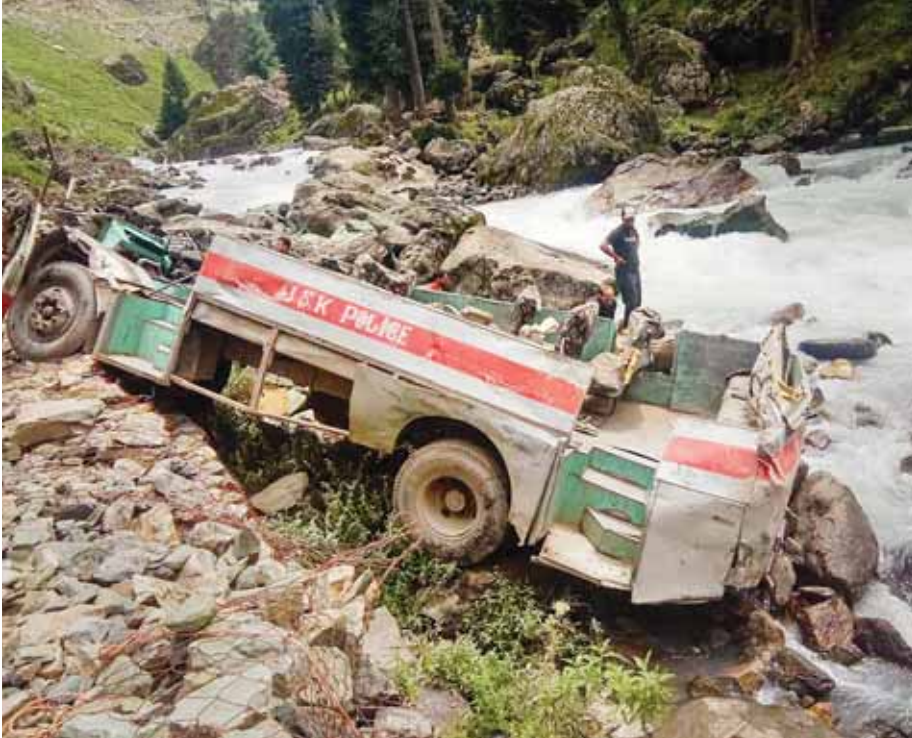
Rescue work underway after a bus carrying 39 personnel skidded off a road down to riverbed, near Chandanwari, in Anantnag district of J&K on Tuesday

Initially, nine critically injured jawans were airlifted to the command hospital in Srinagar while others received treatment in the GMC, Anantnag. Later, all others were shifted to the command