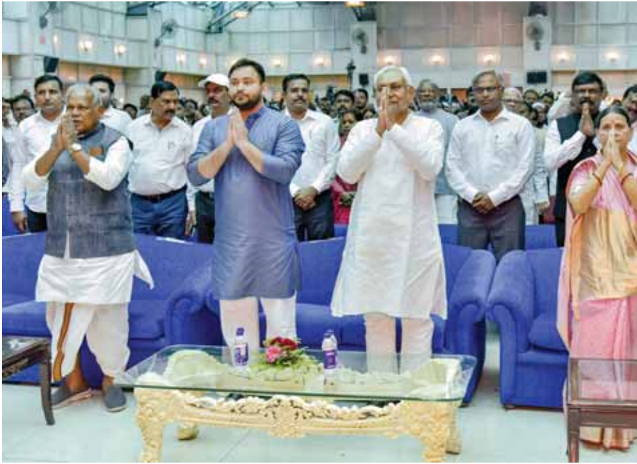
Bihar Chief Minister Nitish Kumar with Deputy Chief Minister Tejashwi Yadav, HAM-S Chief Jitan Ram Manjhi and RJD leader Rabri Devi during the swearing-in ceremony of Bihar Cabinet Ministers at Raj Bhavan in Patna on Tuesday

Kushwaha, a former Union Minister in the Modi Government, had merged his RLSP party last year in March, chose to express his “disappointment” on not being given a responsibility in the new setup by flying to Maharashtra with his family. Kushwaha