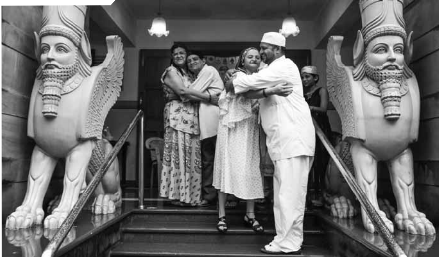
People from Parsi community greet one another on 'Navroz', the Parsi New Year, in Mumbai