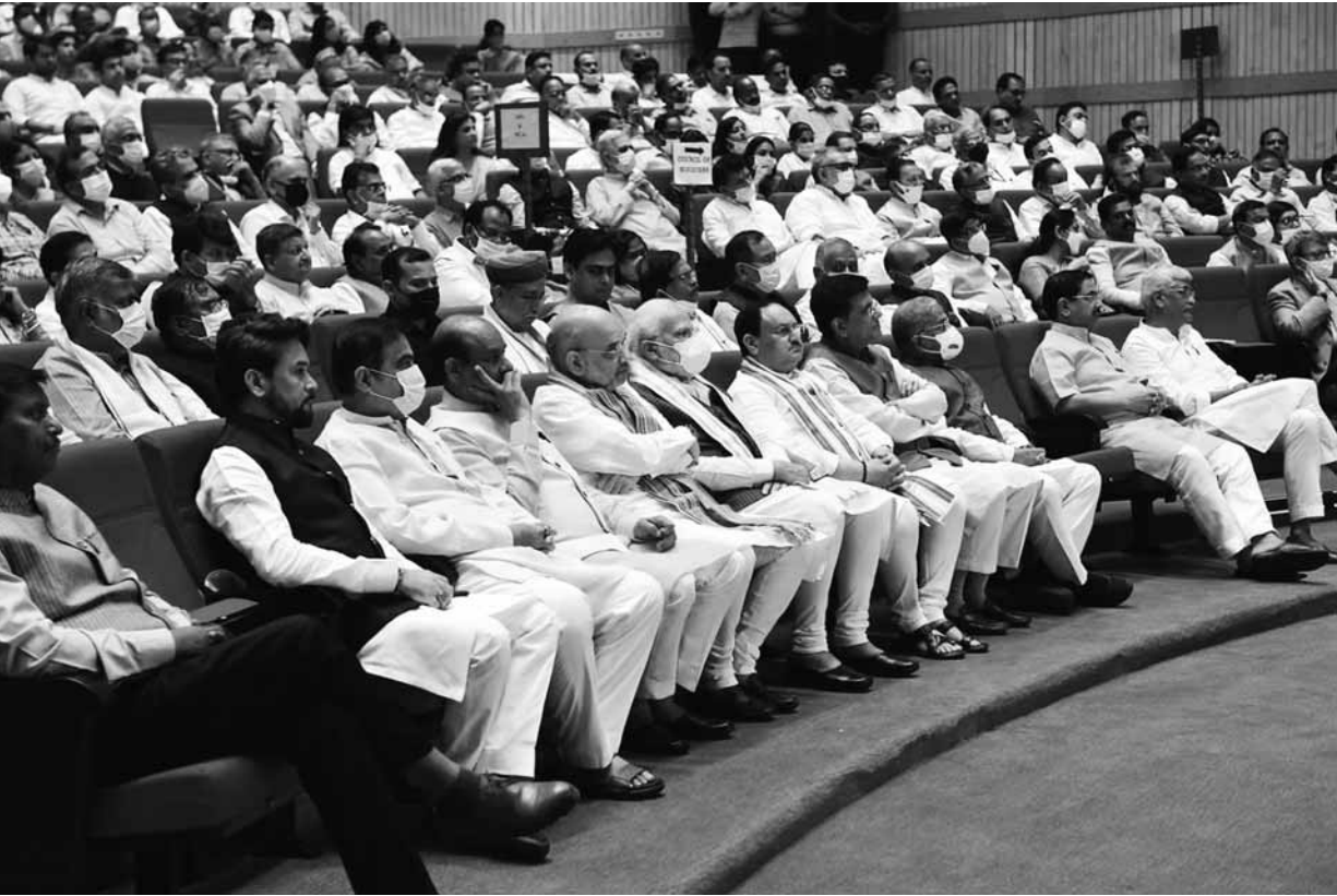
Prime Minister Narendra Modi, BJP national president JP Nadda and Union Ministers attend the screening of Doordarshan's serial 'Swaraj: Bharat Ke Swatantrata Sangram ki Samagra Gatha', at the Balayogi Auditorium, Parliament Library Building in New Delhi on Wednesday