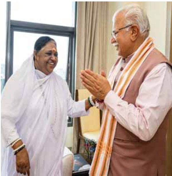
Government will take care of the hospital here. She also thanked the Chief Minister for his help. Later, Khattar also

excellent public transport services will be developed for Amrita Hospital, including Greater Faridabad. He said that setting up this hospital is a big step in the direction of humanity and the state government will always be ready for whatever help is needed by the hospital management. The Chief Minister said that the services of the city bus service have already been extended to the hospital. Apart from this, FMDA is also in the process of setting up a separate bus depot in Greater Faridabad. Meanwhile, Mata Amritanandamayi said that it is her dream that no person should be deprived of good health services. With this idea, she planned to establish this second hospital in Faridabad in Haryana after Kochi in Kerala. She said that she herself lives in Kerala and hopes the State