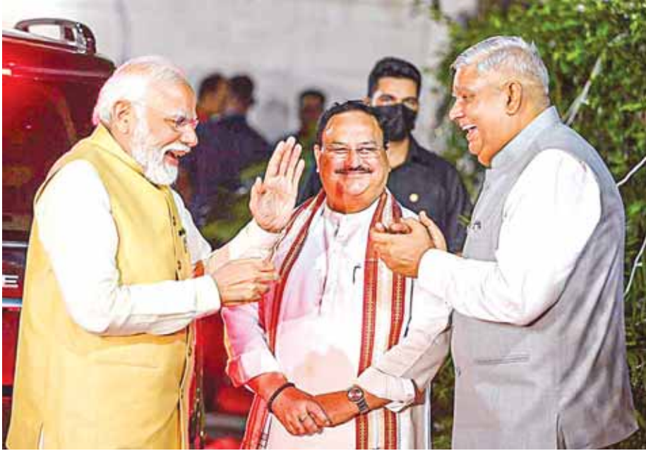
Prime Minister Narendra Modi and Vice-President designate Jagdeep Dhankar react during a meeting in New Delhi on Saturday. BJP national president JP Nadda is also seen

"Out of the 780 electors comprising elected and nominated members of the Rajya