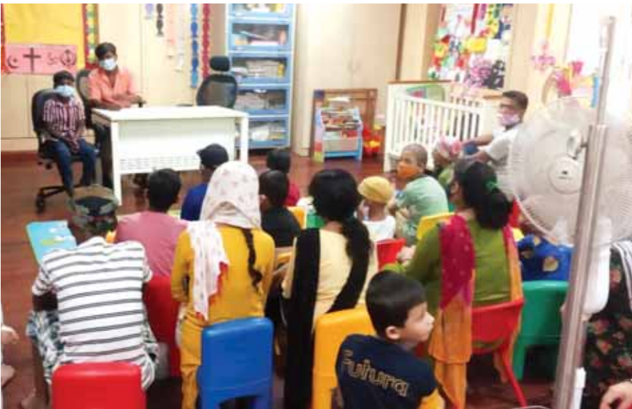
A doctor-patient interaction is held on the last Friday of each month to boost the courage of the families at the Noida Hospital

Cancer indeed is a great leveller. Although gaps do exist between high and low-income countries and between affluent and poor families, most of those are superficial or cosmetic. The biological probability of responding to treatment remains uniform