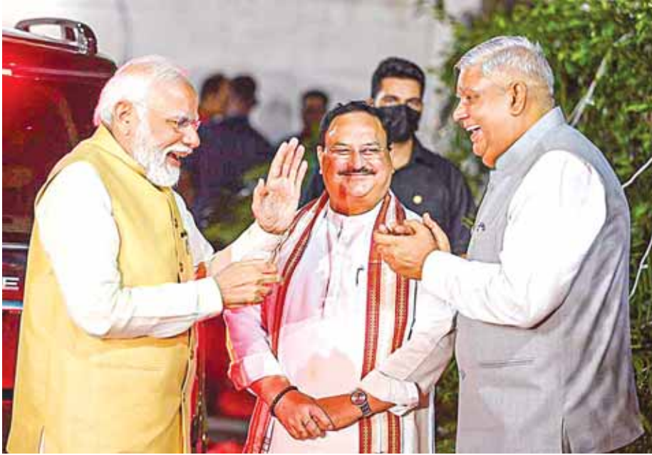
Prime Minister Narendra Modi and Vice-President designate Jagdeep Dhankar react during a meeting in New Delhi on Saturday. BJP national president JP Nadda is also seen

"Out of the 780 electors comprising elected and nominated members of the Rajya