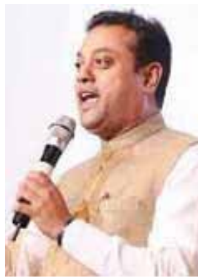
Why Deputy Chief Minister Sisodia, who also heads the Excise Department, was silent so far — Sambit Patra

The BJP spokesperson alleged numerous irregularities in the implementation of the Excise Policy 2021-22 by the Delhi government. Sisodia first exempted Rs 144 crore license fee of licensees during the coronavirus pandemic without Cabinet approval, which was taken only in July 2022, Patra claimed.