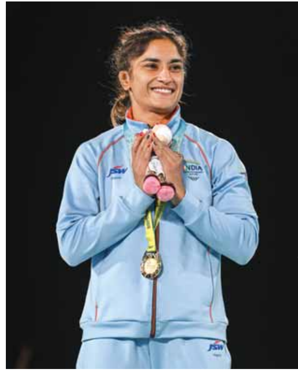
Gold medalist Vinesh Phogat during the Women's Freestyle 53kg Nordic event medal ceremony at the Commonwealth Games, in Birmingham on Saturday

Goswami too clinched a medal of the same colour in the women's 10,000m race walk event on a productive day for