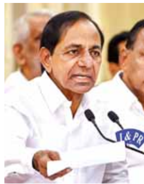
Telangana CM KC Rao addresses a press conference in Hyderabad on Saturday

KCR's announcement came even as reports about Bihar Chief Minister and president of