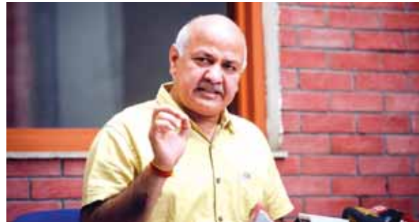
Delhi Deputy Chief Minister Manish Sisodia addresses a press conference in New Delhi on Saturday

Sisodia seeks CBI probe into ex-LG's role in Excise Policy