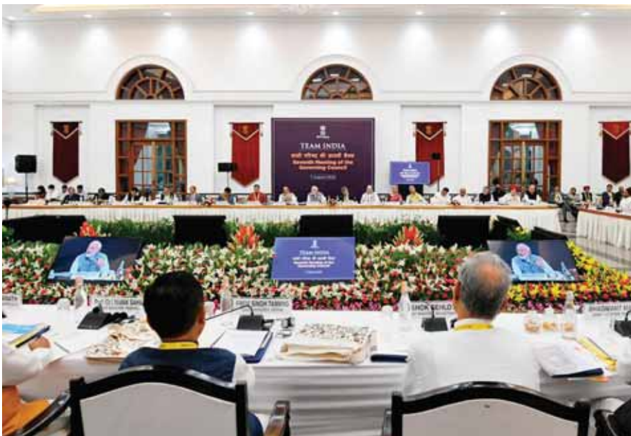
Prime Minister Narendra Modi and other Ministers and Chief Ministers of States/UTs at the 7th Governing Council meeting of the Niti Aayog at the Rashtrapati Bhavan Cultural Centre, in New Delhi on Sunday.