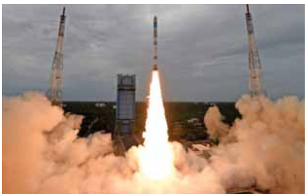
ISRO's new offering Small Satellite Launch Vehicle (SSLV) during its launch from the Satish Dhawan Space Centre, in Sriharikota on Sunday.

The space agency said a committee would analyse and make recommendations into Sunday's episode and make