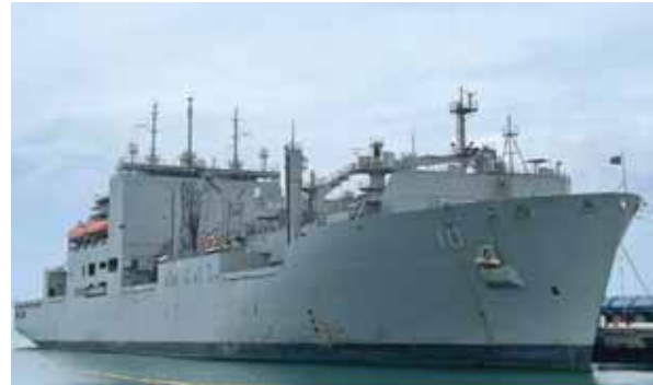
US Navy Ship (USNS) Charles Drew at L&T's Shipyard at Kattupalli for undertaking repairs and allied services, in Chennai.

Providing a huge boost to "Make in India" and "Aatmanirbharta in Defence" and adding a new dimension to the burgeoning Indo-US strategic partnership, US Navy Ship Charles Drew arrived at Larsen