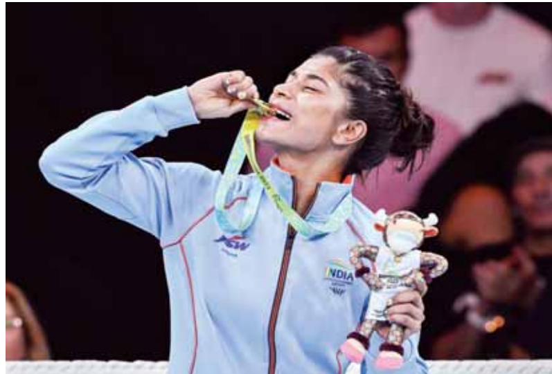
Boxer Nikhat Zareen with the gold medal after winning the final of 48kg-50kg (Light Flyweight) boxing match, at the Commonwealth Games 2022 in Birmingham, UK on Sunday.