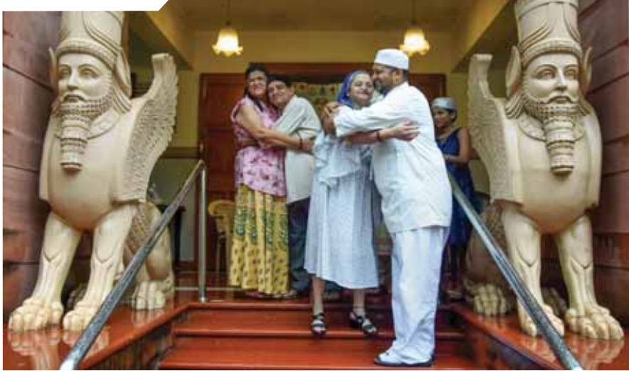
People from Parsi community greet one another on 'Navroz', the Parsi New Year, in Mumbai