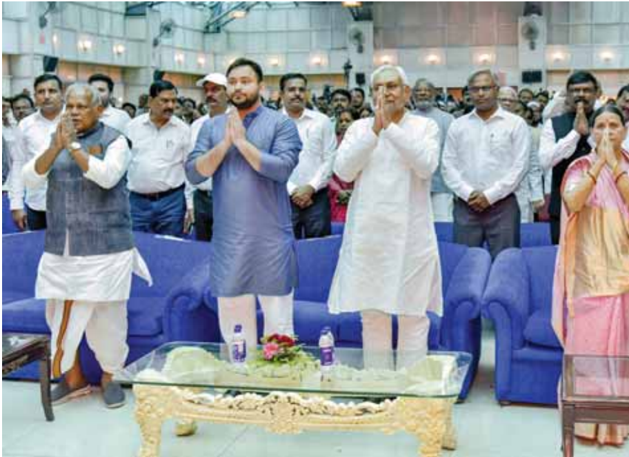
Bihar Chief Minister Nitish Kumar with Deputy Chief Minister Tejashwi Yadav, HAM-S Chief Jitan Ram Manjhi and RJD leader Rabri Devi during the swearing-in ceremony of Bihar Cabinet Ministers at Raj Bhavan in Patna on Tuesday

Kushwaha, a former Union Minister in the Modi Government who had merged his RLSP party last year in March, chose to express his “disappointment” on not being given a responsibility in the new setup by flying to