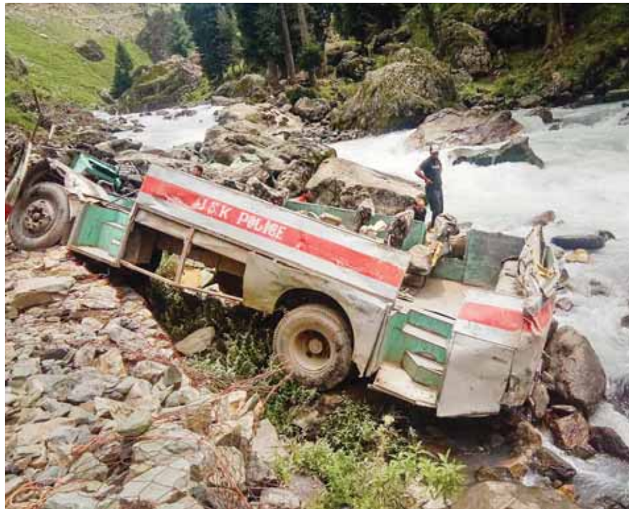
Rescue work underway after a bus carrying 39 personnel skidded off a road down to riverbed, near Chandanwari, in Anantnag district of J&amp;K on Tuesday