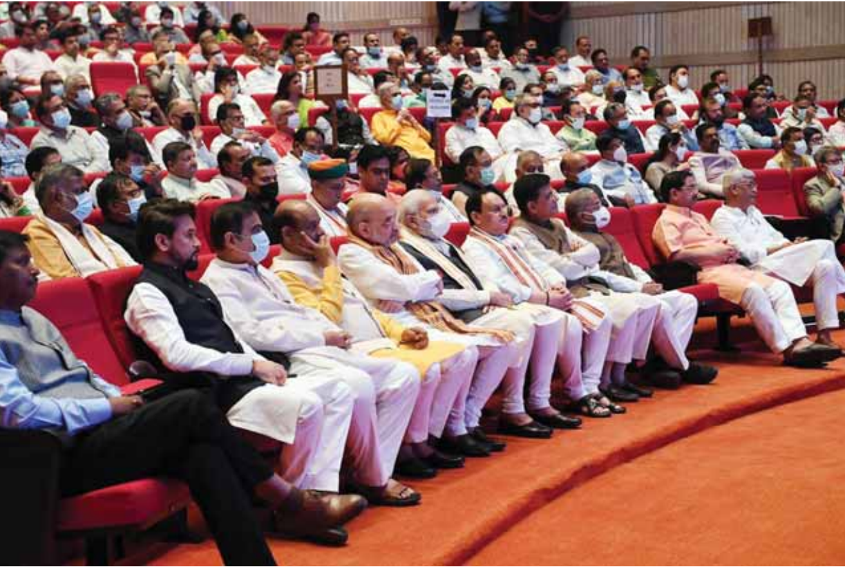
Prime Minister Narendra Modi, BJP national president JP Nadda and Union Ministers attend the screening of Doordarshan's serial 'Swaraj: Bharat Ke Swatantrata Sangram ki Samagra Gatha', at the Balayogi Auditorium, Parliament Library Building in New Delhi on Wednesday