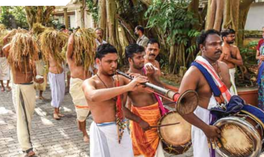
Priests participate in a traditional procession on the occasion of Chingam 1 or Malayalam New Year, in Kochi