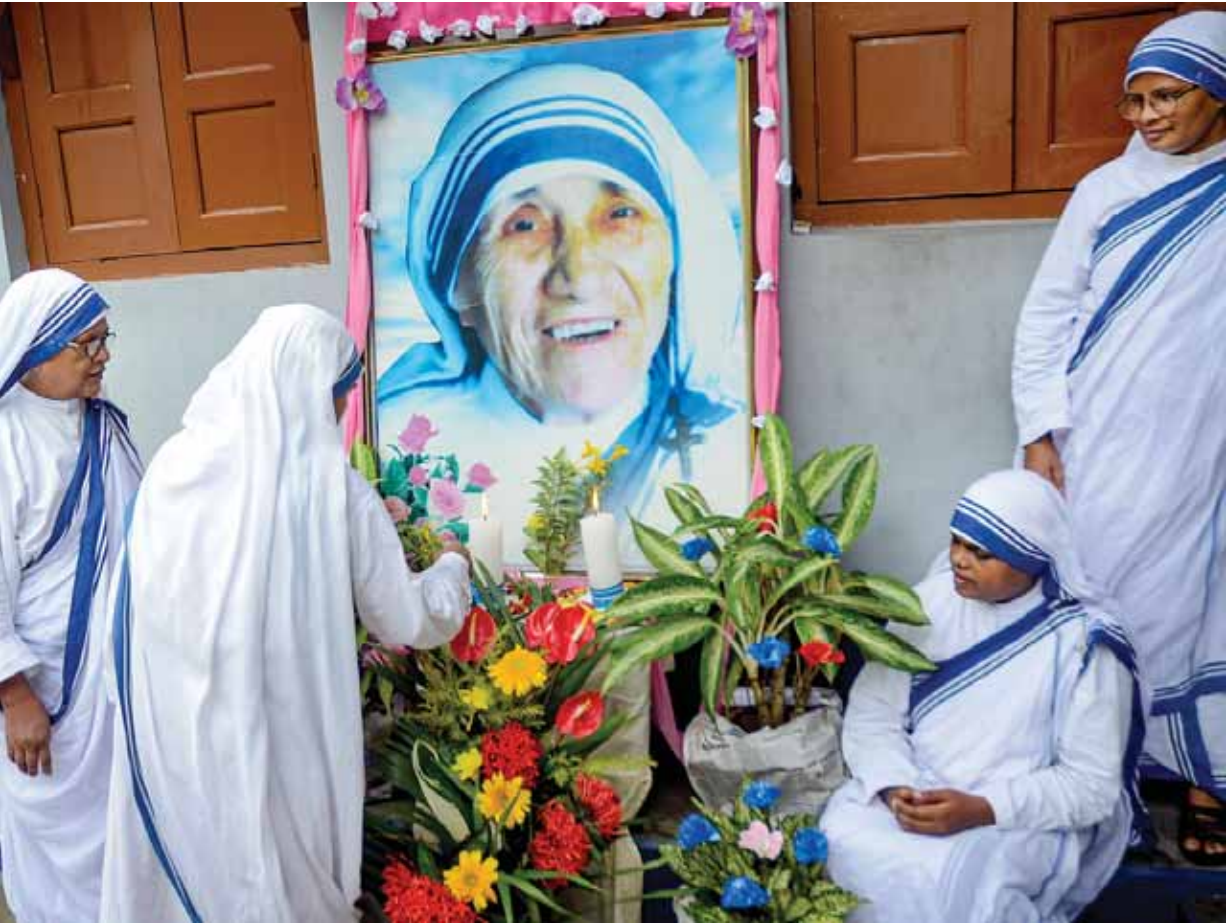
Nuns light candles in front of a portrait of Saint Teresa of Kolkata on her birth anniversary, in Agartala on, Friday.