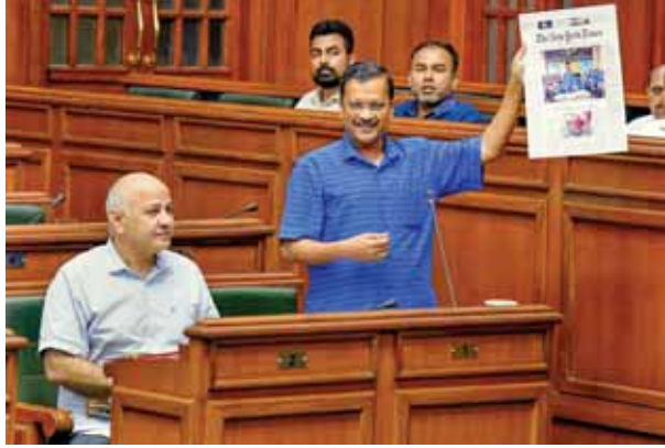
Delhi Chief Minister Arvind Kejriwal speaks during a special session of the Delhi Legislative Assembly in New Delhi on Friday. Delhi Deputy CM Manish Sisodia is also seen

Earlier, the Delhi Assembly witnessed stormy scenes with the ruling AAP shouting “khokha-khokha”, accusing the BJP of trying to buy its MLAs, and the Opposition hitting