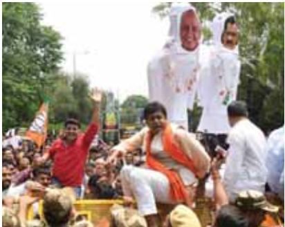
BJP workers during their protest against the Arvind Kejriwal-led Government over the Excise Policy case, near Delhi Vidhan Sabha in New Delhi on Friday

“When corruption in the Excise Policy has been exposed, Kejriwal has kept silence. It is the same Kejriwal who keeps express-