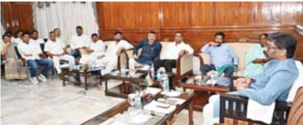
Chief Minister Hemant Soren chairs a meeting of United Progressive Alliance (UPA) legislators in Ranchi on Friday

The United Progressive Alliance, which is led by the Jharkhand Mukti Morcha in Jharkhand, is trying its best to keep the flock intact despite an imminent threat to membership of Chief Minister Hemant Soren in the State Legislative Assembly. While the Governor House is silent on the letter sent by ECI in the office of profit case against Soren, the UPA is weighing different options for the future if the worst becomes inevitable. Two meetings of UPA legislators were called on Friday at CM’s official residence, which was attended by 37 MLAs of flock. Some of