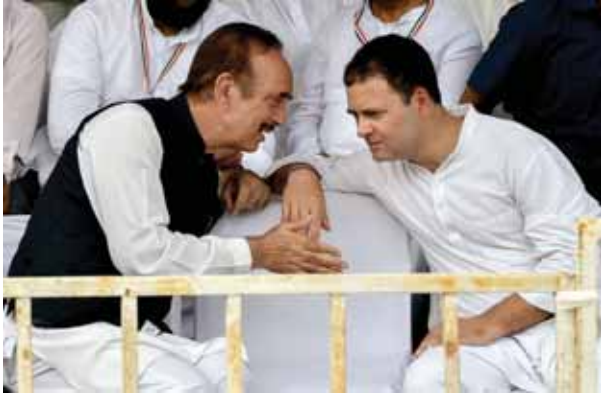
In this Sept 10, 2018 file photo, senior Congress leader Ghulam Nabi Azad with party leader Rahul Gandhi during a 'Bharat Bandh' protest, in New Delhi

“Azad was a senior leader of the Congress. It is saddening that when the party fighting against inflation and polarisation, he decided to quit. It is most unfortunate and regret-