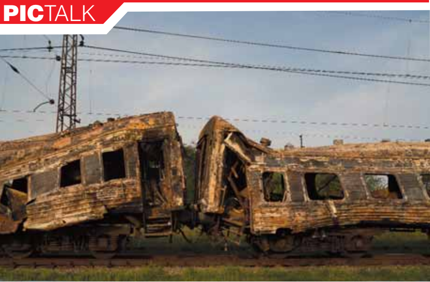
A heavily damaged train after a Russian attack yesterday on Ukraine's Independence Day in Chaplyne, Ukraine