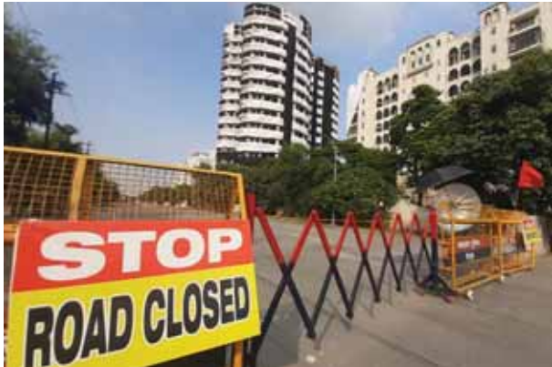
Barricades used to block a road leading to Supertech twin towers ahead of their demolition with explosives in compliance with a Supreme Court order, in Noida on Friday