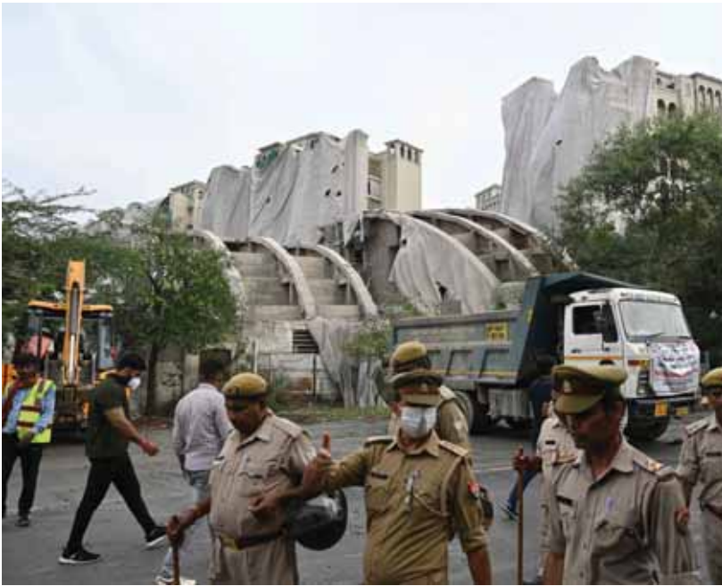
Ranjan Dimri | Pioneer