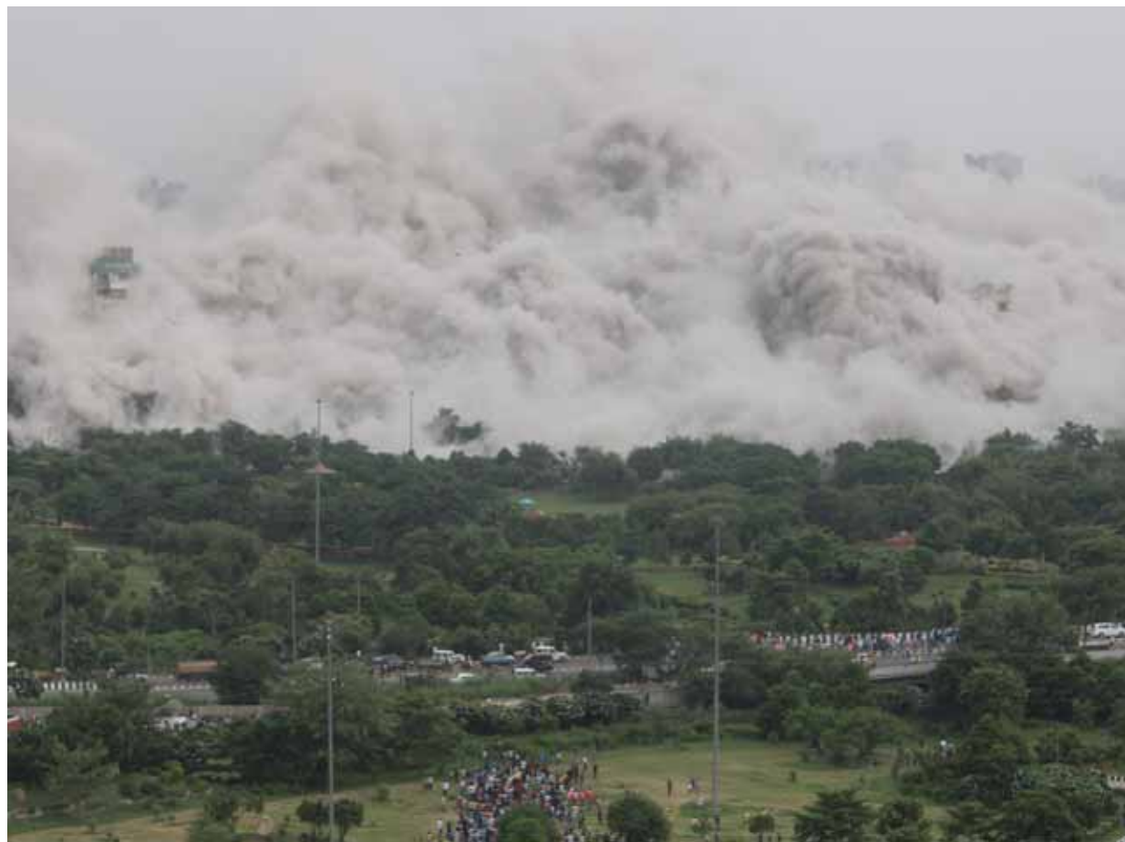
(Left to right) A massive cloud of dust enveloped the area seconds after the Supertech twin towers were demolished with the help of a controlled explosions. Curious onlookers gather to see the fallen towers hours after the cloud of dust settled on the historic demolition.