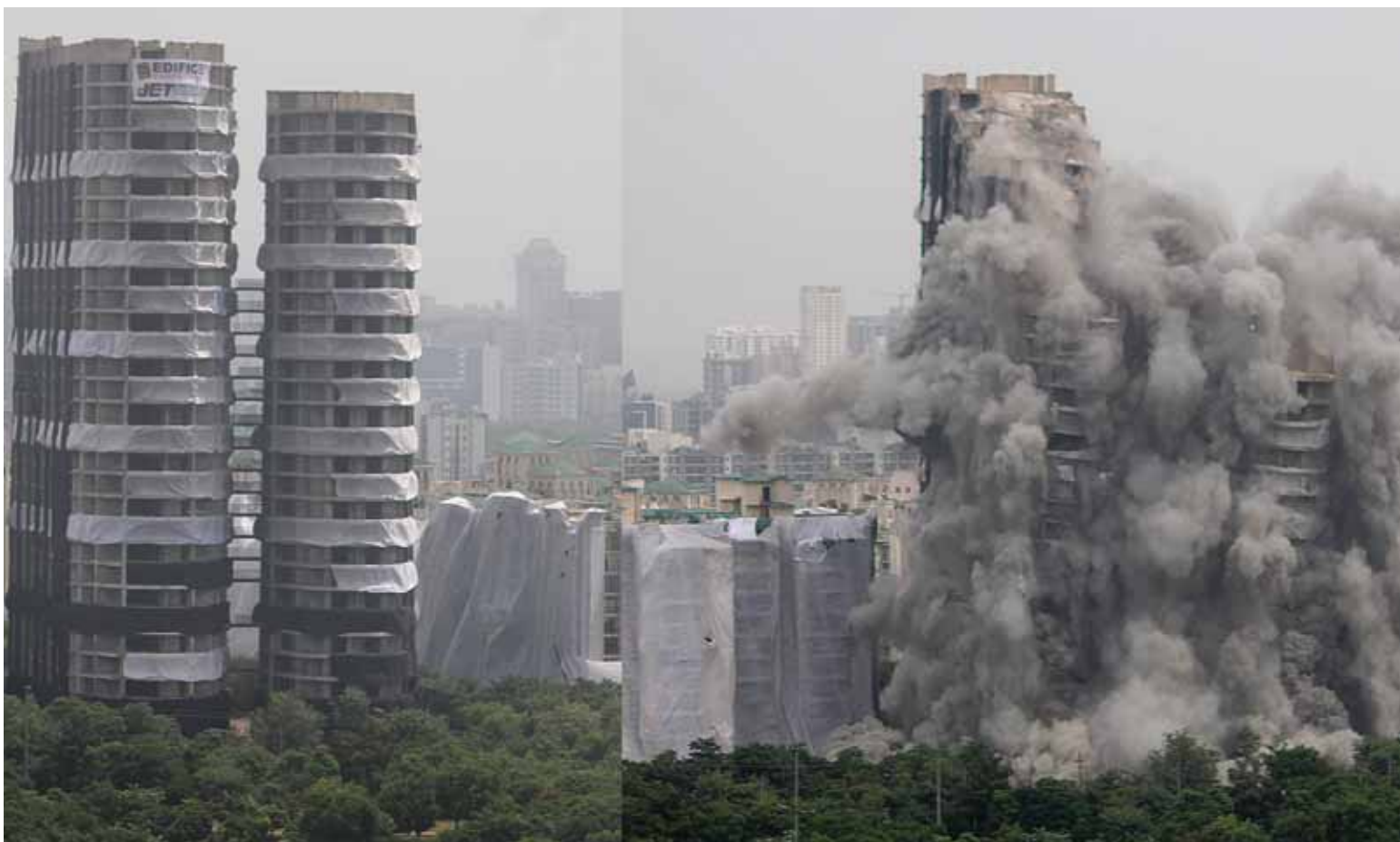
(Left to right) The Supertech twin towers stand tall in Noida just before the demolition. The implosion that brought down the two structures on Sunday afternoon.