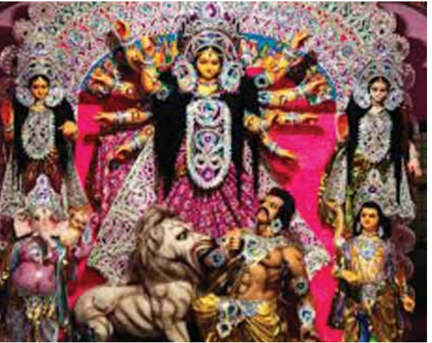
Durga Puja in Kolkata inscribed on ICH representative list of Intangible Cultural Heritage of Humanity in 2021