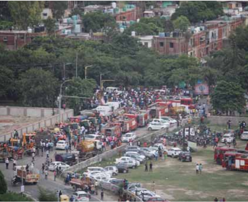
Vehicles parked in the area; (L) police personnel deployed near the debris of the demolished Twin Towers.