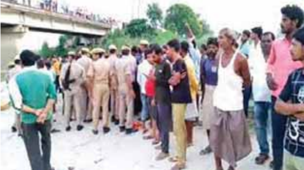
PNS ■ LUCKNOW

A day after a tractor-trolley carrying 22 people fell in the river Garra, officials in Hardoi on Sunday recovered eight bodies and called off the search operations.