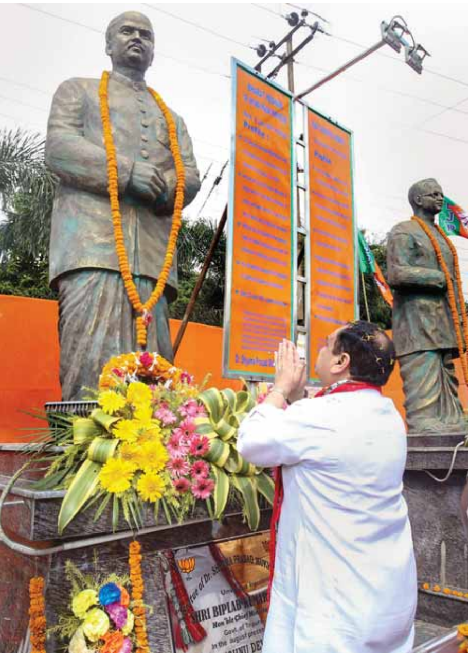
BJP national president JP Nadda pays homage to Dr Shyam Prasad Mukherjee, in Agartala on Monday