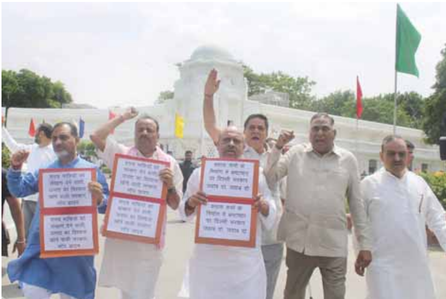
Delhi BJP leaders seeking the sacking of Deputy CM Manish Sisodia in the alleged Excise Policy scam protest against the AAP Government at the State Assembly, in New Delhi on Monday.