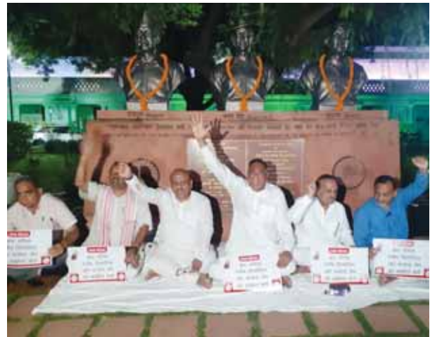
(R) BJP MLAs sit on protest over not being heard in Delhi Assembly, at night on Monday

Meanwhile, Raj Niwas sources have denied the allegations made against the LG, saying they would issue a