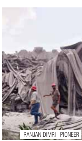
partner for the job. The two had together previously demol-