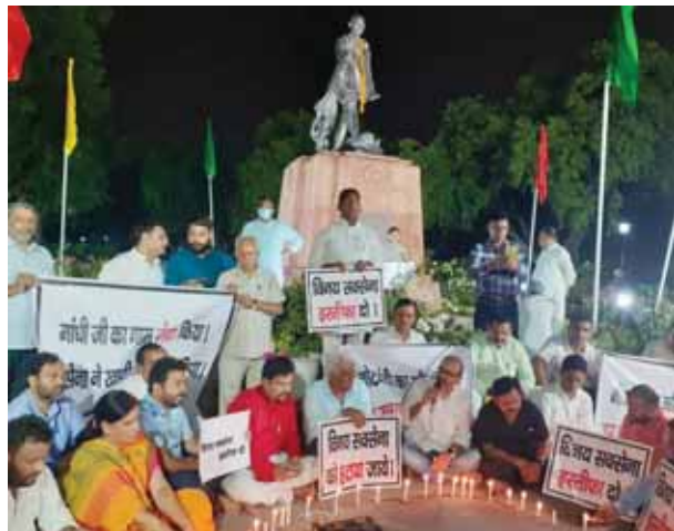
AAP MLAs stage overnight protest demanding resignation of Delhi Lieutenant Governor. (R) BJP MLAs sit on protest over not being heard in Delhi Assembly, at night on Monday