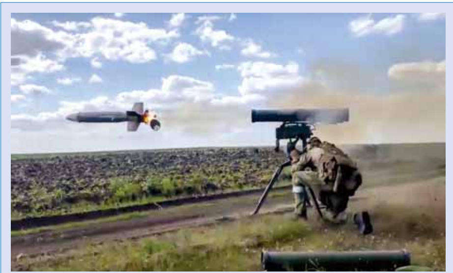
In this handout photo taken from video released by Russian Defense Ministry Press Service on Monday, a Russian soldier fires from a Komet at an undisclosed location in Ukraine