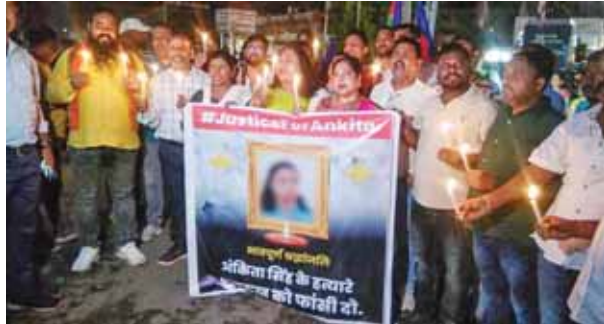
A candlelight march protest against the murder of a class-12 student, who was set on fire by a man in Jharkhand's Dumka district, in Ranchi, on Monday

The issue has snowballed into a political issue as the