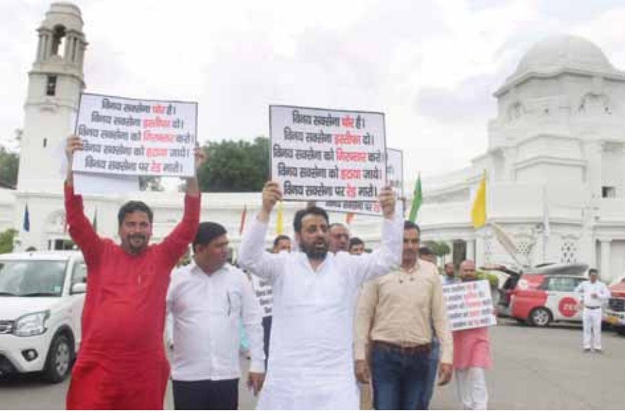
AAP MLAs display placards during a protest against Lieutenant-Governor Vinai Kumar Saxena at the State Assembly, in New Delhi on Monday for allegedly pressurising his employees to exchange demonetised notes worth ₹1,400 crore in 2016 when he was KVIC chairman.