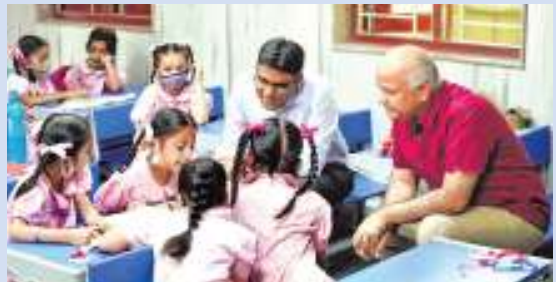
Delhi Government has started ‘Happiness Curriculum’ to teach students how to keep the stress and loneliness at bay

Various Governments across the world are gradually waking up to this silent killer. If the UK appointed a designated loneliness minister in 2018 to reach out to its older people, Japan last year took similar step after it felt that loneliness is afflicting across different age groups, including children, young people, women and older people. Rising cases of suicide was immediate trigger.