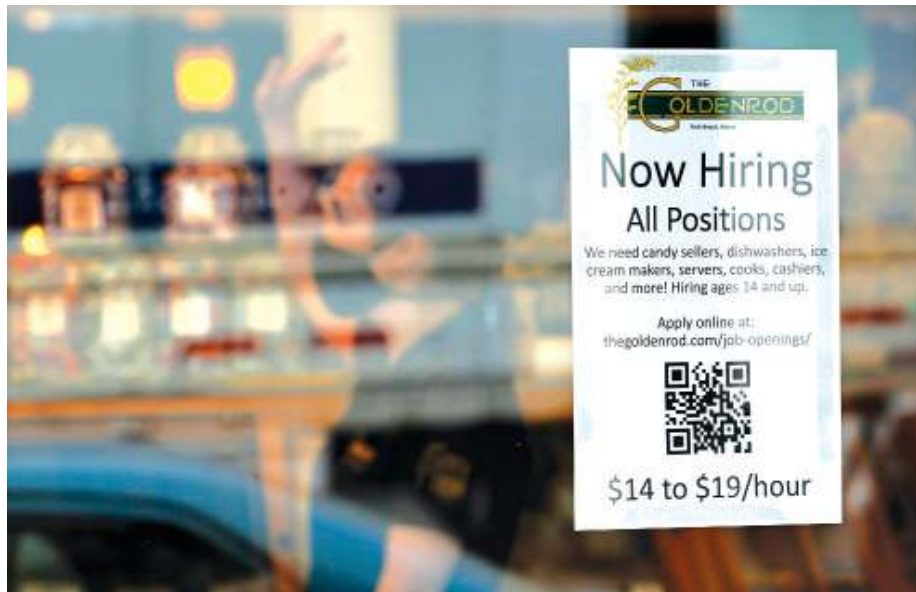
A sign advertises for help The Golden Rod, a popular restaurant and candy shop on June 1, 2022, in York Beach, Maine.

The committee considers trends in hiring as a key measure in determining recessions.