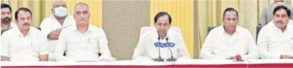
Chief Minister K Chandrashekar Rao addressing a media conference in Hyderabad on Saturday

He also said that more facilities are being provided to dialysis patients as per the recommendation of the State Health Minister. He said, 'We are already giving them bus passes, we are providing free dialysis services and recently we have also increased the number of dialysis centres. He said that it has come to their attention that there are 10,000-12,000 dialysis patients in the State and it has been decided to give them new 'Aasara' cards along with the services pro-