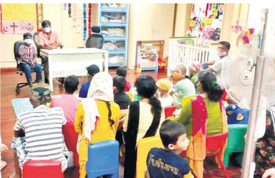
A doctor-patient interaction is held on the last Friday of each month to boost the courage of the families at the Noida Hospital

Cancer indeed is a great leveller. Although gaps do exist between high and low-income countries and between affluent and poor families, most of those are superficial or cosmetic. The biological probability of responding to treatment remains uniform