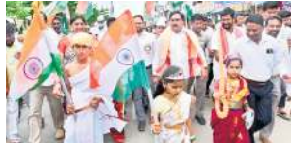
Minister for Panchayat Raj Errabelligi Dayakar Rao participating in freedom run in Warangal on Saturday