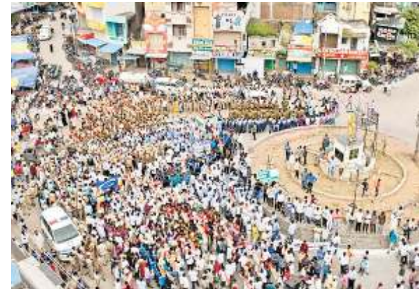
People participating in the Freedom Run in Nizamabad on Saturday