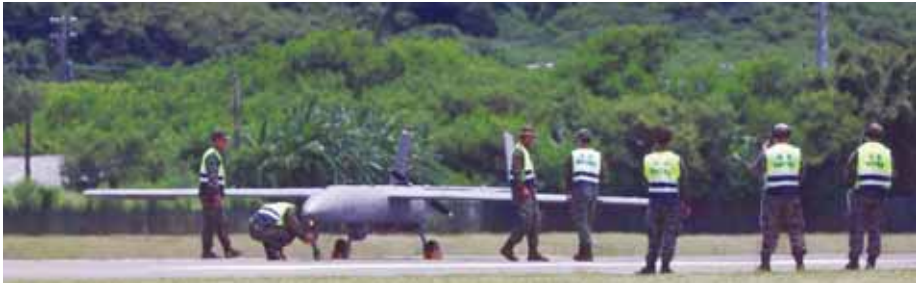
AP ■ BEIJING

China on Wednesday reaffirmed its threat to use military force to bring self-governing Taiwan under its control, amid threatening Chinese military exercises that have raised tensions between the sides to their highest level in years. The statement issued by the Cabinet's Taiwan Affairs Office and its news department followed almost a week of missile firings and incursions into Taiwanese waters and airspace by Chinese warships and air force planes. The actions have disrupted flights and shipping in a region crucial to global supply chains, prompting strong condemnation from the US, Japan and others. The Chinese statement said Beijing seeks "peaceful unification" with Taiwan but "does not pledge to relinquish the use of military force and retains all necessary options". In an additional response, China said it was cutting off dialogue on issues from maritime security to climate change with the US, Taiwan's chief military and political backer. China says the threatening moves were prompted by a visit to Taiwan last week by US House Speaker Nancy Pelosi, but Taiwan says such visits are routine and that China used that merely as a pretext to up its threats.