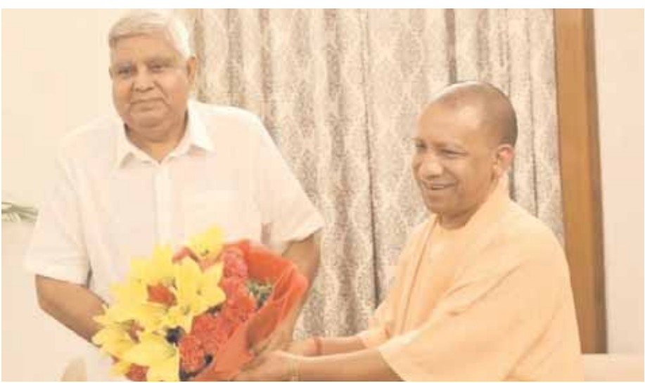
(Top) Chief Minister Yogi Adityanath paid a courtesy call on President Droupadi Murmu at Rashtrapati Bhavan in Delhi and extended warm greetings to her. The CM presented ODP products of Varanasi and also invited the president to visit Uttar Pradesh. (Above) Yogi Adityanath with Vice President Jagdeep Dhankar