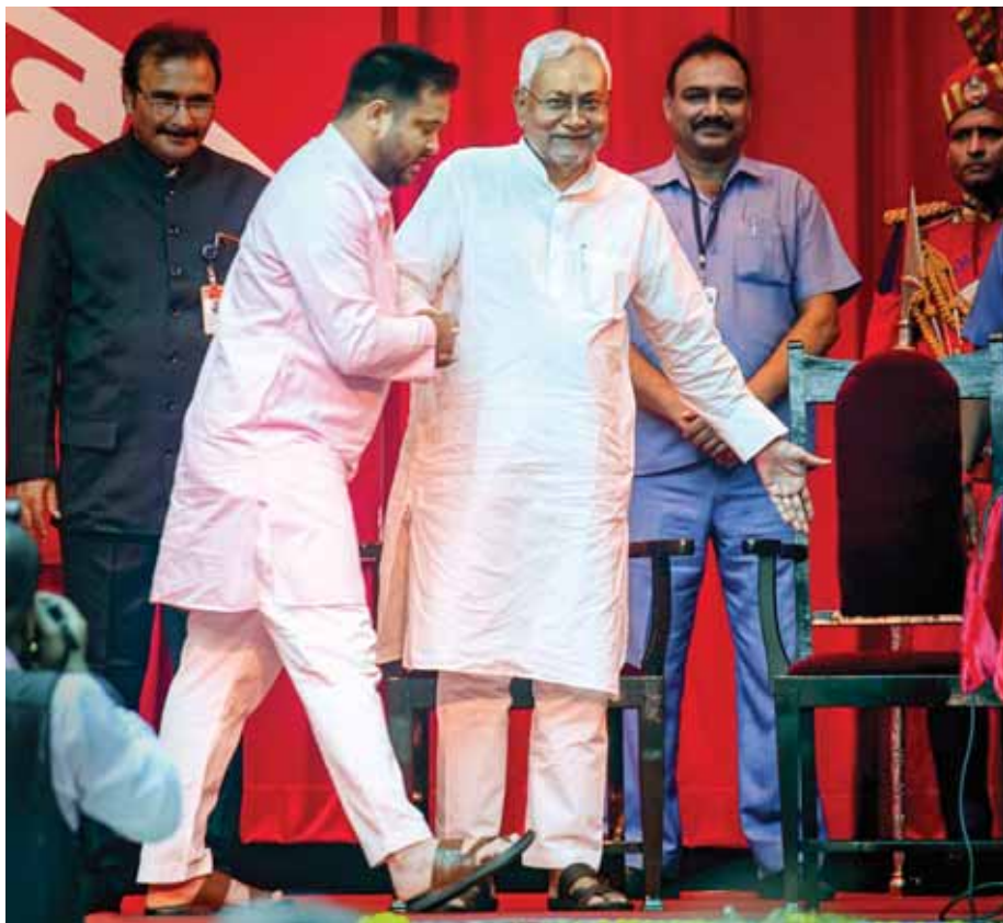
Bihar Chief Minister Nitish Kumar with his deputy Tejashwi Yadav during their swearing-in ceremony at the Raj Bhavan, in Patna, on Wednesday

Kumar was sworn in besides RJD's Tejashwi Yadav, who is likely to be designated as his deputy. Sources in the seven-party ruling coalition said a Cabinet expansion would