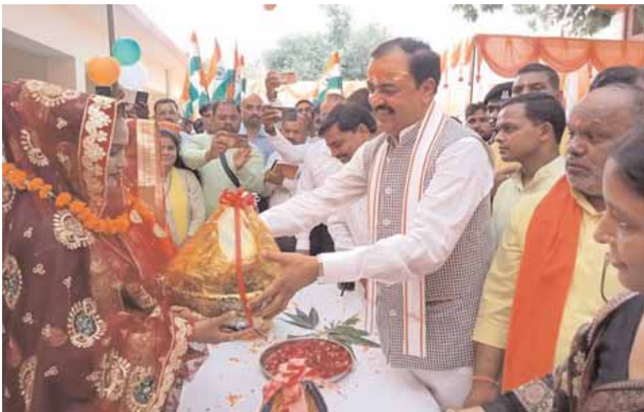
Deputy CM KP Maurya performing Godbharai rituals at Arajiline block in Varanasi on Wednesday.