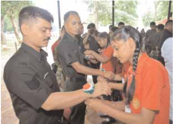
Girls tying rakhis to the hands of soldiers at 39-GTC in Varanasi on Wednesday.

A group of girls reached the 39 Gorkha Training Centre (GTC) campus located in the Cantonment area and tied rakhis to the Indian soldiers here on Wednesday on the eve of festival of Raksha Bandhan. The students of Raghav Ram Verma Girls Inter College took the oath of protecting the country by threading defense threads on the wrists of the army personnel engaged in the security of the border. The girl students tied rakhi on the wrists of the GCO and the jawans so that they couldn't feel like they were living away from home. The army personnel also took the oath of