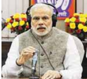
PIONEER NEWS SERVICE ■ NEW DELHI

Women village heads, kin of martyred soldiers and people mentioned by Prime Minister Narendra Modi in his 'Mann Ki Baat' radio address will be among the invitees at the 'At Home' function to be hosted by the Governors and Lieutenant Governors on Independence Day. In a communication to States and Union Territories, the Union Home Ministry stressed that apart from the usual protocol-based invitees, the attendees should represent diverse fields. The invitation for the 'At Home' function to be held at Governor or LG House on August 15 evening should be sent to physically challenged achievers in different fields, people who made an exemplary contribution to society, including during the COVID-19 pandemic, eco-warriors and those who have contributed to environmental conservation, it said. The Home Ministry