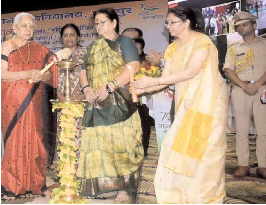
Governor Anandiben Patel inaugurates the Azadi Ka Amrit Mahotsav programme at CSJM University on Wednesday.