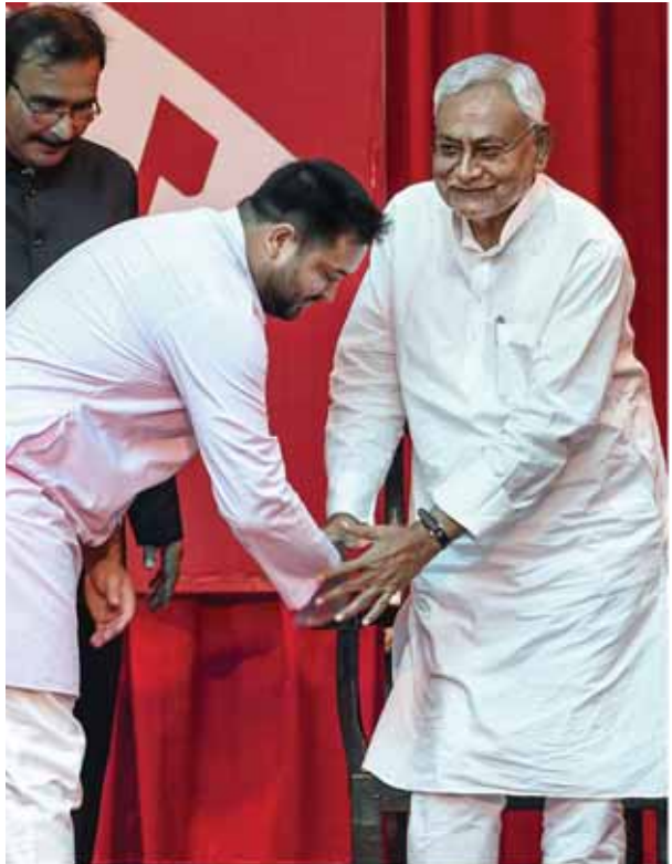
Bihar Chief Minister Nitish Kumar being greeted by his deputy Tejashwi Yadav during their swearing-in ceremony, at Raj Bhavan in Patna on Wednesday

"The applicant shall submit a detailed report from the training endocrinologist containing the details — duration, dosage, frequency of dosage, changes made, hormone assay reports, side effects, etc — of hormone therapy the applicant has been taking," it noted. An applicant who is on hormone replacement therapy, or undergoing gender reassignment surgery, will be declared medically unfit for at least three months, it added.