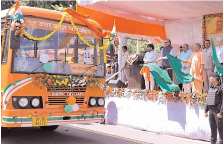
Chief Minister Yogi Adityanath flagging off new BS-6 buses

UPSRTC buses or any other government vehicles plying on the roads must be in proper fitness as also their drivers.