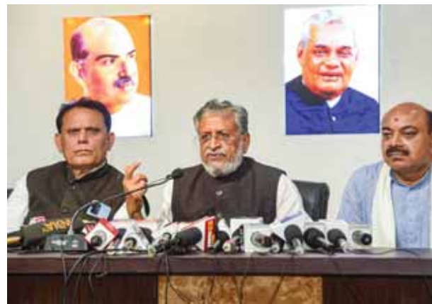
BJP MP Sushil Kumar Modi addresses a press conference at the party office, in Patna on Wednesday