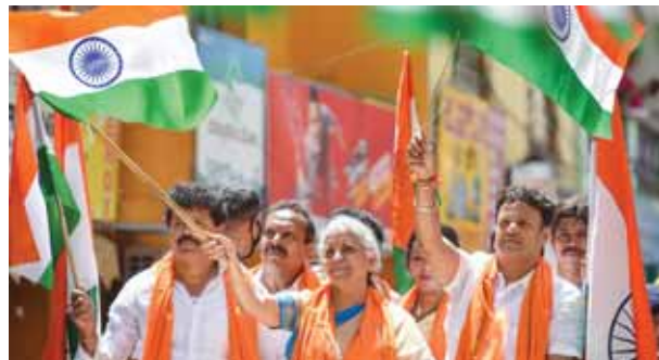
Union Finance Minister Nirmala Sitharaman participates in a 'Tiranga Yatra' as part of 'Azadi Ka Amrit Mahotsav' celebrations for 75 years of Independence, in Bengaluru, on Saturday