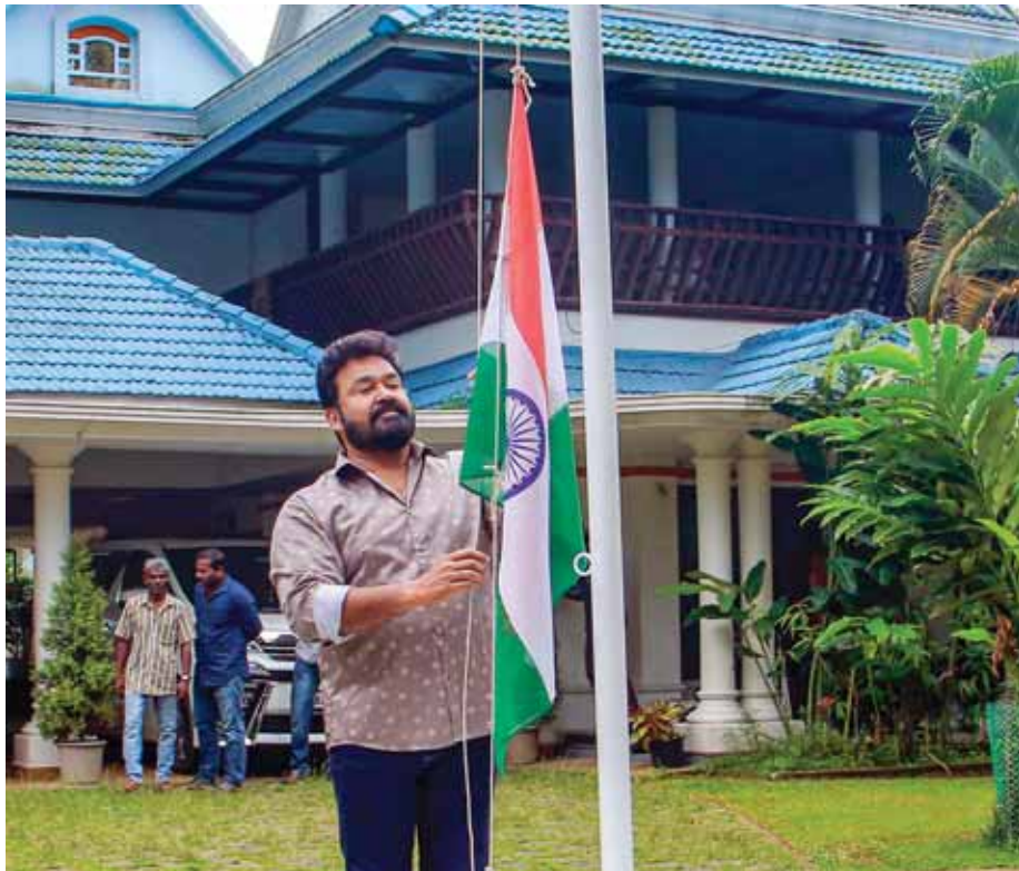
Film actor Mohanlal hoists the national flag at his residence on the occasion of 'Har Ghar Tiranga' campaign, in Kochi on Saturday