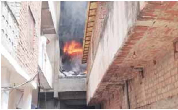
Shoe manufacturing unit caught fire in Jajmau on Saturday afternoon.