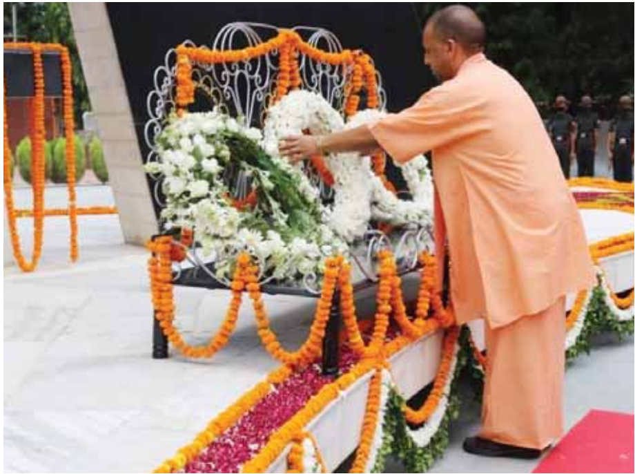
Chief Minister Yogi Adityanath paying floral tributes at 'Smritika', the war memorial of Surya Command, on Saturday