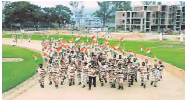
ITBP hoists national flag at high altitude borders as part of 'Har Ghar Tiranga' campaign