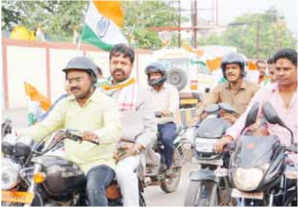
UP Minister of State (Independent Charge) for Ayush, Food Safety and Drug Administration Dr Daya Shankar Mishra 'Dayaloo' (on pillion seat) participating in bike rally.

The former state minister and MLA from City South assembly constituency Dr Neel Kanth Tiwari participated in Tiranga yatra. He also took part in a cleanliness campaign