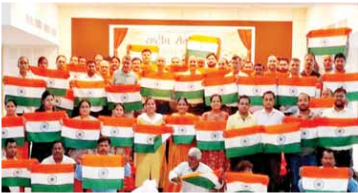
National flags were distributed among teaching and non-teaching staff of SMS

Varanasi (PNS): (SMS) on Saturday organised various programmes under the Azadi Ka Amrit Mahotsav. The national flags were distributed among villagers of Khushipur, Bandepur and Bhadwar villages under the campaign of Har Ghar Tiranga. An awareness programme about the environment was also organised under which the saplings were planted. The volunteers of NSS distributed national flags among the teaching and non-teaching staff of the institute. The bike rally and foot march were also taken out by the institute which were flagged off by the institute Director Prof PN Jha. A debate contest was also organised to mark the Vibhajan Vibhishika Diwas, which subject was 'Far-reaching impact of division of India on the development.