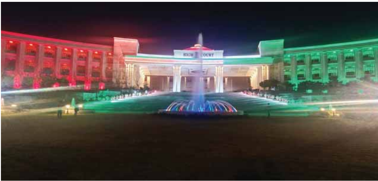
The high court building in Lucknow illuminated in tricolour on Saturday under Azadi Ka Amrit Mahotsav

ing progress towards achieving the goal of self-reliance. Not only have our brave soldiers protected the sovereignty and integrity of our nation, they have also been ready to protect world peace, if and when called upon to do so," he said. The chief minister applauded the armed forces for their services during natural disasters. Emphasising on the commitment of the state administration to soldiers and veterans, the chief minister spoke about the various initiatives taken for their welfare such as a defence helpline, felicitation of soldiers and veterans, support to families of armed forces personnel who have sacrificed their lives and building of memorials and naming of roads in the home districts after our bravehearts who have made the supreme sacrifice. While interacting with the gallantry award winners, veer naris and veterans, the chief minister expressed his gratitude towards their sacrifice and service to the nation. General Officer Commanding-in-Chief, Surya Command, Lt General Yogendra Dimri reaffirmed the commitment of the army towards the welfare and well-being of esteemed veterans and veer naris. Chief Secretary DS Misra, senior officers of the armed forces and civil administration and families of armed forces personnel and veterans were also present on the occasion.