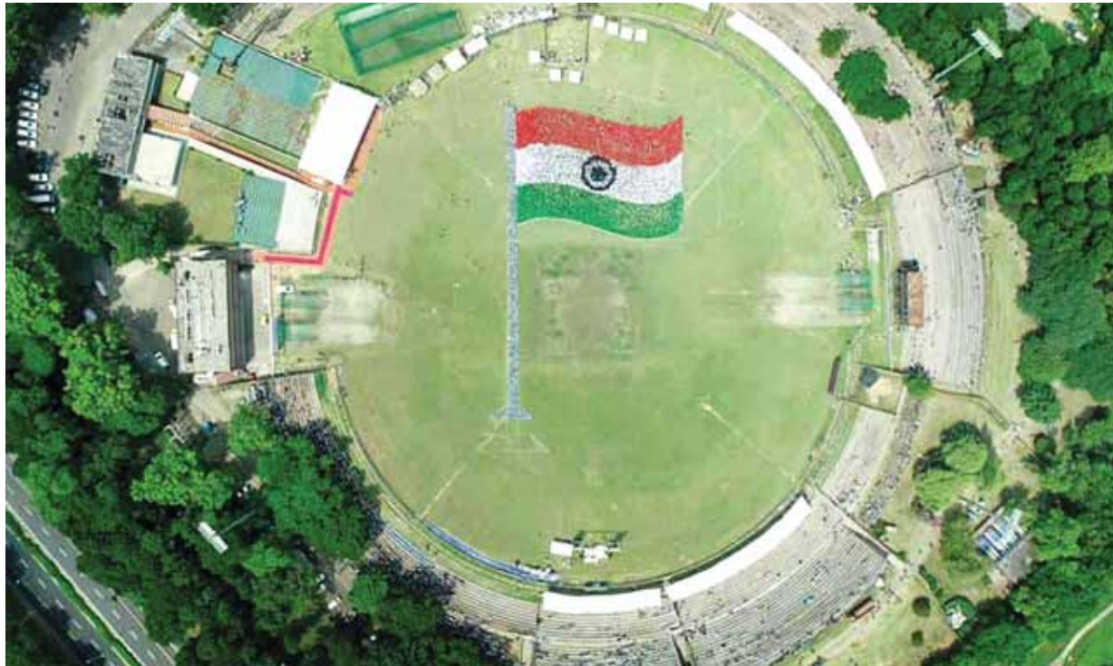
Students form a human chain to resemble a hoisted Indian national flag as they celebrate 'Azadi Ka Amrit Mahotsav' celebrations to commemorate 75 years of Indian Independence, in Chandigarh on Saturday. They created a Guinness World Record for their formation of 'World's Largest Human Image of a Waving National Flag'