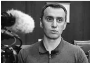
AP ■ KYIV

Ukraine's health minister has accused Russian authorities of committing a crime against humanity by blocking access to affordable medicines in areas its forces have occupied since invading the country 5 1/2 months ago. In an interview with The Associated Press, Ukrainian