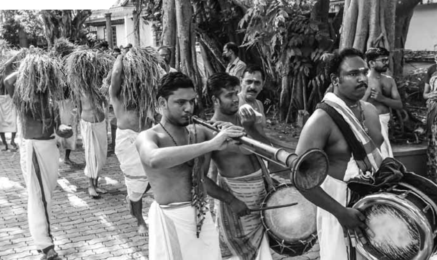
Priests participate in a traditional procession on the occasion of Chingam 1 or Malayalam New Year, in Kochi