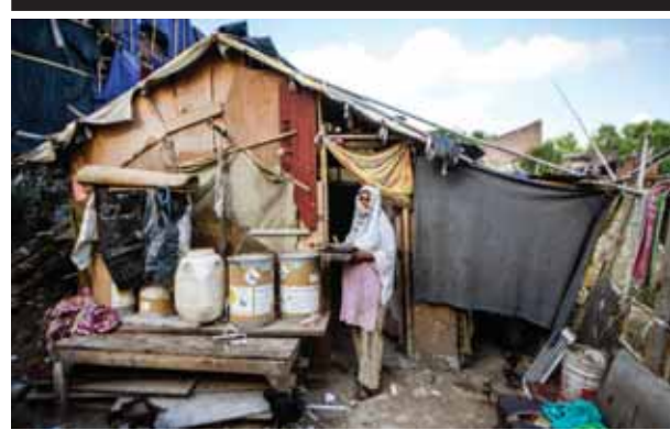
37-year-old woman poses for photographs at the Rohingya refugee settlement area in Kalindi Kunj in New Delhi on Wednesday

○ UNHCR's Report acknowledged that more than 18,000 Rohingyas have taken shelter in India, seeking refugee status