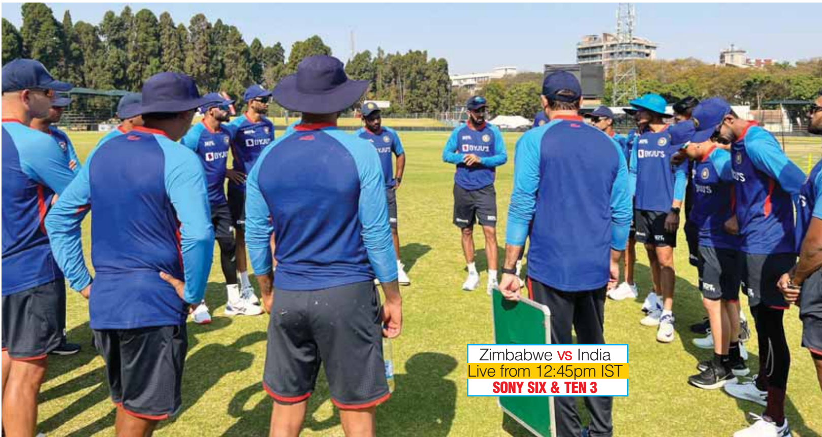
Zimbabwe vs India Live from 12:45pm IST SONY SIX & TEN 3

them any accolades but a defeat would invite sharp criticism.