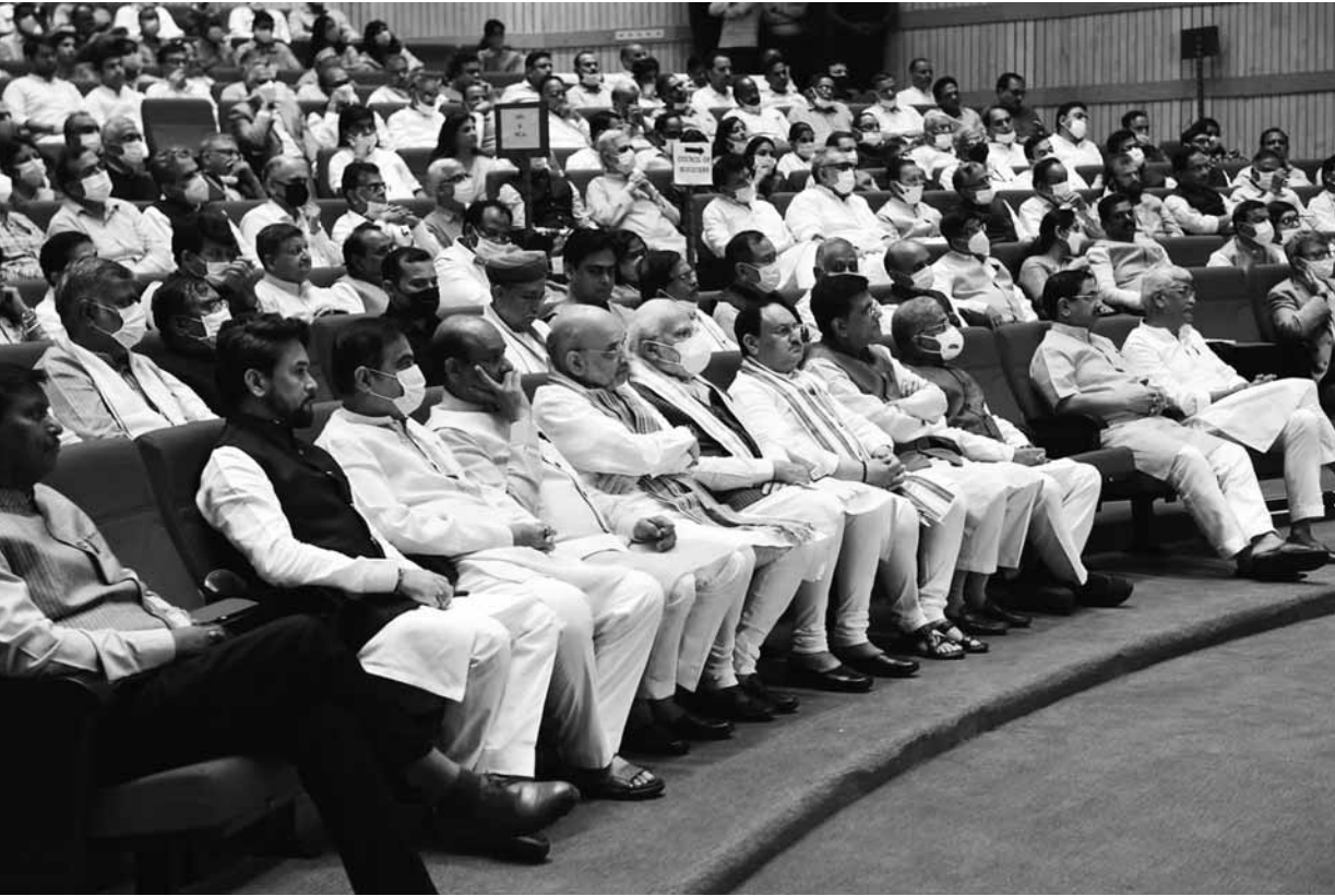
Prime Minister Narendra Modi, BJP national president JP Nadda and Union Ministers attend the screening of Doordarshan's serial 'Swaraj: Bharat Ke Swatantrata Sangram ki Samagra Gatha', at the Balayogi Auditorium, Parliament Library Building in New Delhi on Wednesday