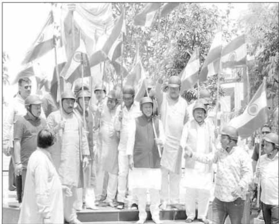
BJP Legislature Party Leader Babul Marandi along with party MLAs and leaders participate in a 'Tiranga Bike Rally' ahead of the upcoming Independence Day, in Ranchi on Friday.

On this occasion, Marandi said that the people of the country should play their positive role 75th year of Independence. It is a matter of pride for us that on this oc-