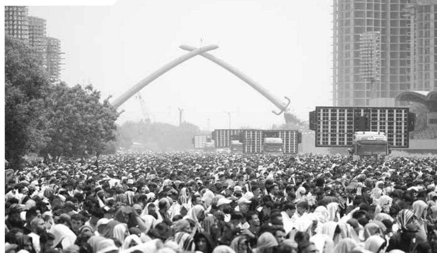
Followers of Shiite cleric Muqtada al-Sadr attend open-air Friday prayers at Grand Festivities Square, in Baghdad, Iraq