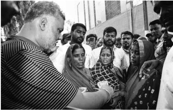
Jan Adhikar Party president Pappu Yadav meets family members of victims, after several people died after allegedly consuming spurious liquor in Saran district of Bihar, in Patna on Friday

Five people died here while two deaths occurred at Patna Medical College and Hospital (PMCH) where those who have fallen seriously ill were referred on Thursday," he said.