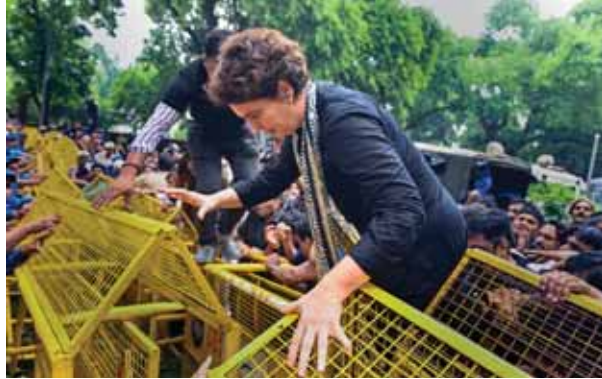
Congress leader Priyanka Gandhi during a protest in New Delhi on Friday

Asked about the questioning by the Enforcement Directorate of Congress president Sonia and him in the National Herald case, Rahul said, "Question all you want, there is absolutely nothing there, everybody knows it. We are not going to be intimidated by such tactics."