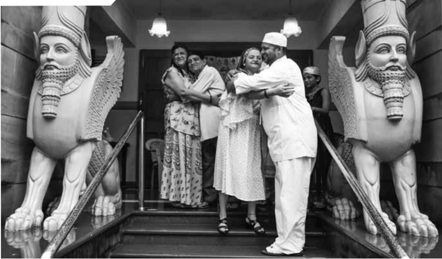
People from Parsi community greet one another on 'Navroz', the Parsi New Year, in Mumbai