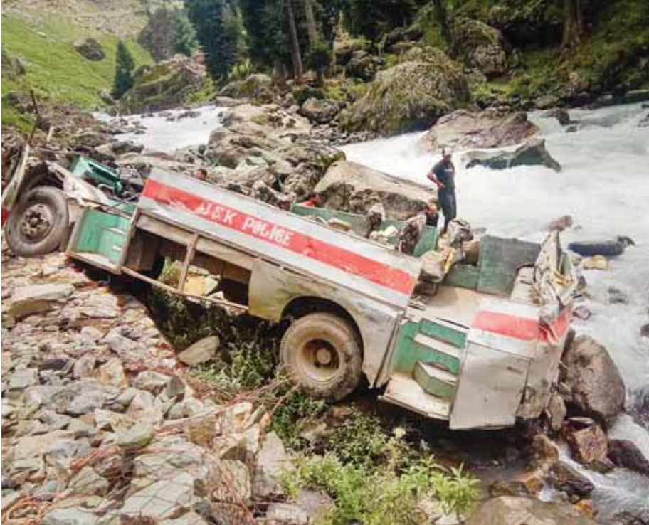
Rescue work underway after a bus carrying 39 personnel skidded off a road down to riverbed, near Chandanwari, in Anantnag district of J&K on Tuesday

Initially, nine critically injured jawans were airlifted to the command hospital in Srinagar while others received treatment in the GMC, Anantnag. Later, all others were shifted to the command