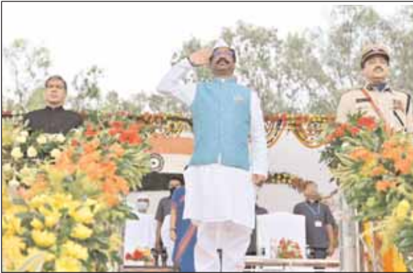
Chief Minister Hemant Soren salutes the national flag during the 76th Independence Day celebrations at Morhabadi Ground in Ranchi on Monday.

“Our government has constituted the “Employment of Local Candidates in the Private Sector of Jharkhand State Act, 2021”. Under this Act, every employer shall employ local candidates for 75 per cent of the total vacancy of posts carrying a monthly salary of up to forty thousand rupees. On July 16, 2022, about 11 thousand local youth have been given offer letters for appointment in the offer letter distribution ceremony for the announcement and appointment of local planning policy in the private sector. This decision will prove to be a milestone in providing employment to the local youth within the state and preventing migration,” said the CM.