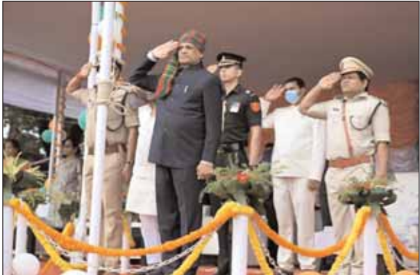
Governor Ramesh Bais salutes the national flag on the occasion of Independence Day celebrations at Dumka on Monday.

“After the formation of our government, we decided to make Jharkhand the dream of the brave sons of Jharkhand who sacrificed their lives in the freedom struggle. We will make strong and sincere efforts to fulfill the expectations on which a separate Jharkhand state was created. Our government is constantly striving to build a strong state with the vision of the basic mantra of development, democracy,” he said.