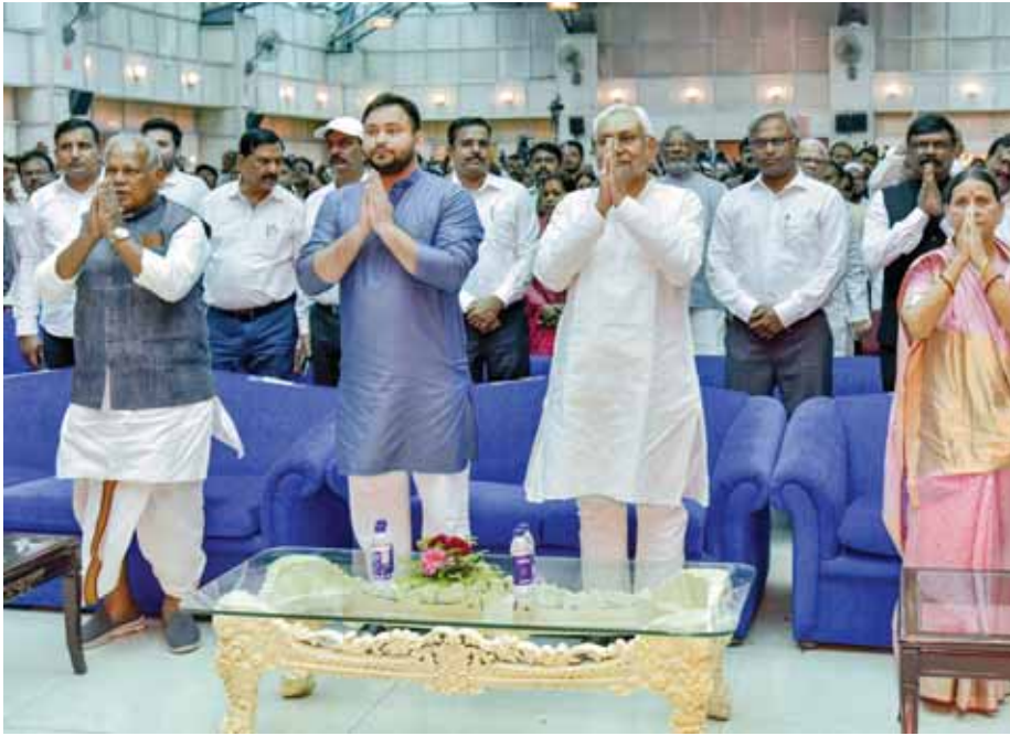
Bihar Chief Minister Nitish Kumar with Deputy Chief Minister Tejashwi Yadav, HAM-S Chief Jitan Ram Manjhi and RJD leader Rabri Devi during the swearing-in ceremony of Bihar Cabinet Ministers at Raj Bhavan in Patna on Tuesday

Kushwaha, a former Union Minister in the Modi Government, had merged his RLSP party last year in March, chose to express his “disappointment” on not being given a responsibility in the new setup by flying to Maharashtra with his family. Kushwaha