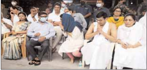
Chief Minister Hemant Soren interacts with family members of veteran cricket administrator Amitabh Choudhary, during his funeral procession in Ranchi on Wednesday. Choudhary died due to a heart attack at the age of 62.

In protest against the Netarhat Field Firing Range, a memorandum was also submitted by about 39 revenue villages of Latehar district