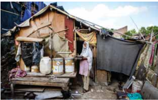
37-year-old woman poses for photographs at the Rohingya refugee settlement area in Kalindi Kunj in New Delhi on Wednesday

infiltrated into India during 2012-2014, mostly in Jammu, Haryana's Mewat, UP, Telangana, Kerala, part of Bengal, Assam borders. ○ UNHCR's Report acknowledged that more than 18,000 Rohingyas have taken shelter in India, seeking refugee status