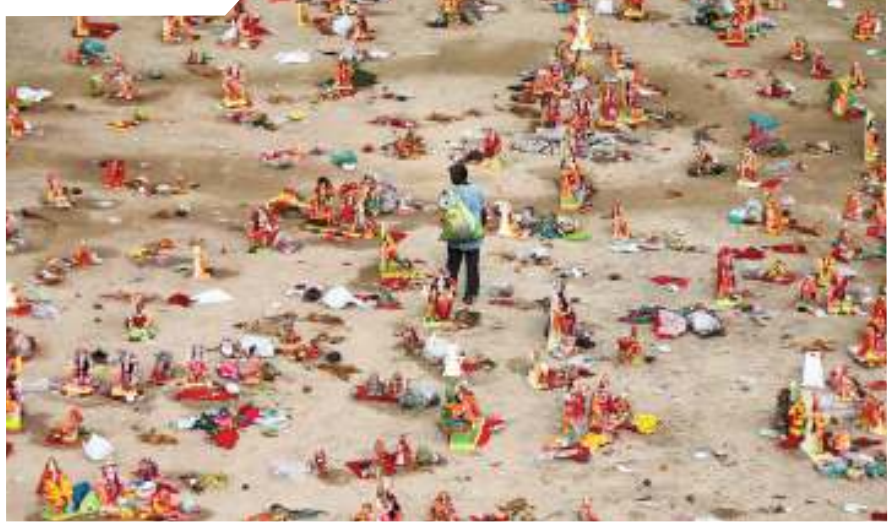
A ragpicker collects recyclable items from the offerings and idols of Goddess Dashama, left by devotees in Ahmedabad