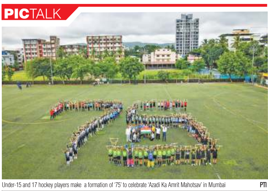
Under-15 and 17 hockey players make a formation of '75' to celebrate 'Azadi Ka Amrit Mahotsav' in Mumbai

The entire episode highlights four points. First and foremost, governance and maintaining law and order are reactive rather than proactive. Action should have been taken against him not after but before the video became viral. About half a dozen cops have been suspended on grounds of dereliction of duty; it's a good decision. But even better would be efforts to bring about a system which precludes dereliction of duty in the first place. Second, sloganeering and rhetoric are not substitutes for statecraft and policing. Setting narratives, smart one-liners, and clever memes have their importance in politics, but to keep public opinion on their side—or at least not opposed to them—the powers that be have to do something more substantive than continuous messaging. Third, social media, often blamed for a lot of bad things, can also help ensure justice. It was after all the viral video that led to action against Tyagi. And, finally, we come to... well, a cliché: the power of one. The guts and gumption of one woman will bring him to justice. The citizens of India need not shout or fight like Sunny Deol to get justice. They just have to take a stand.