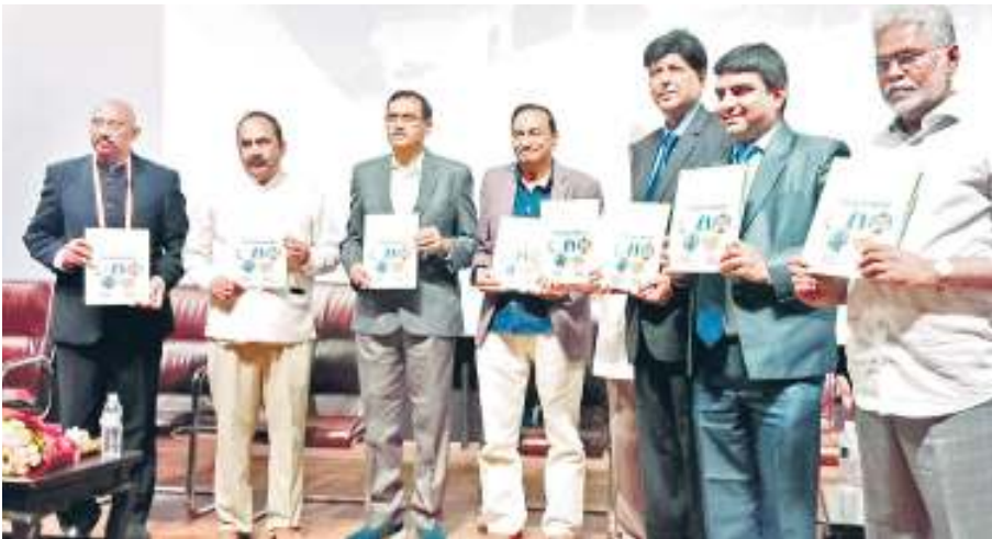
■ VIJAYAWADA