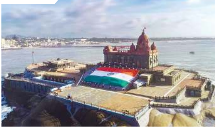
A 75-ft National Flag being unfurled at the southern tip of India, ahead of Independence Day, in Kanyakumari